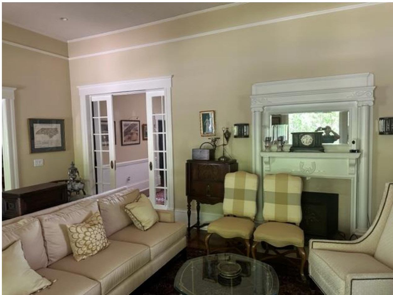
1st Front Formal Living Room Facing Back (South) toward stairwell