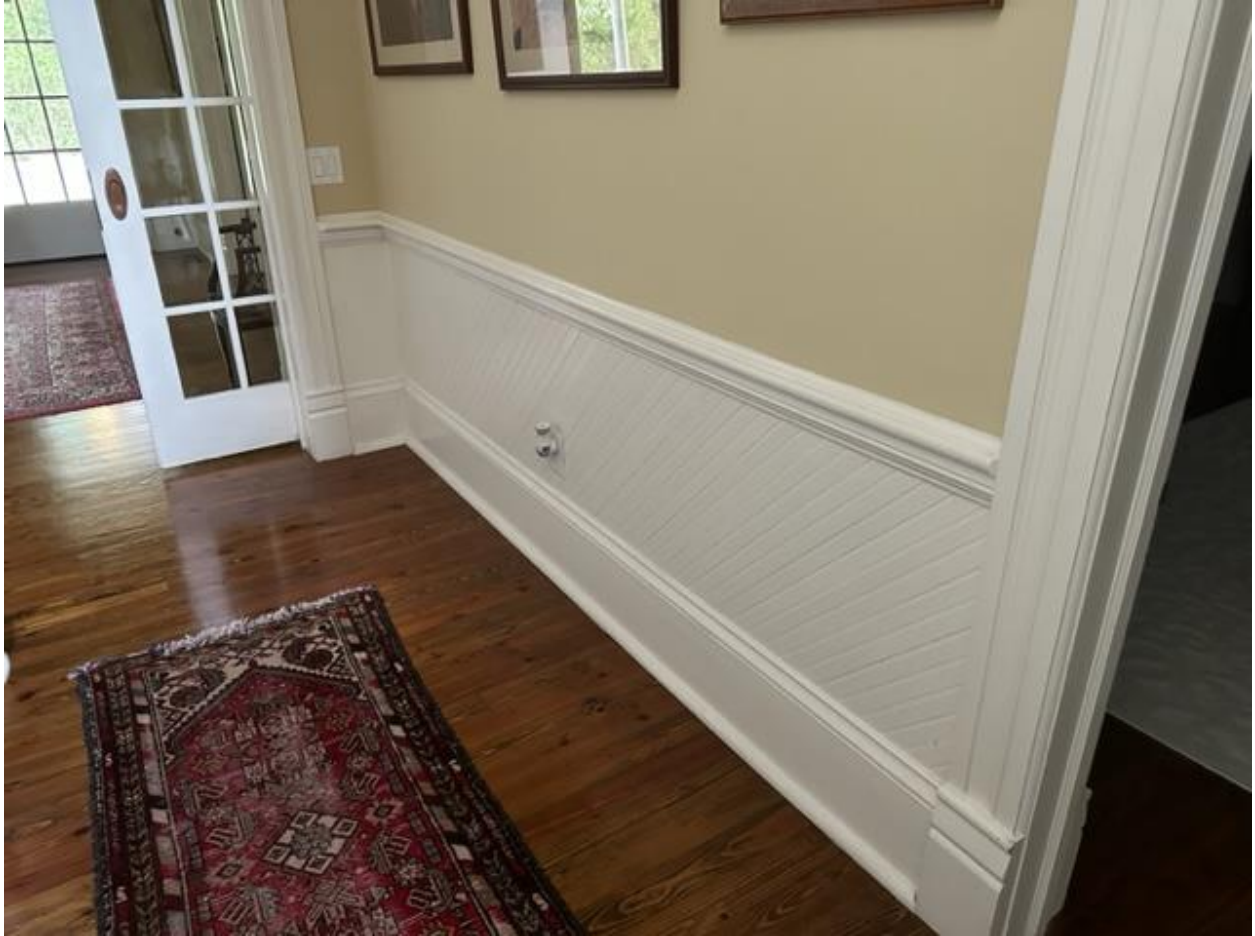
First Floor stairway showing original wainscoting.jpg