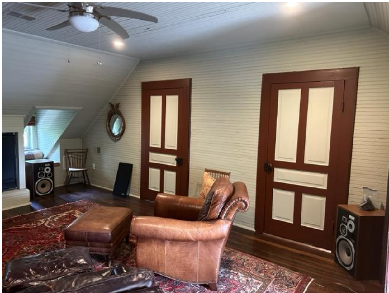
3rd Floor facing Northeast showing doors leading to bathroom