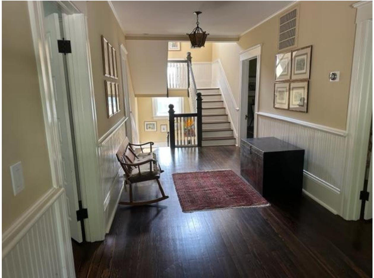
2nd floor hallway facing South.jpg