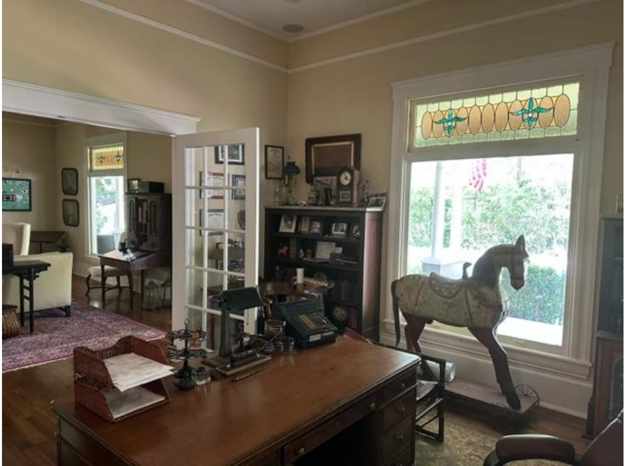
1st Front Office Facing Northwest toward formal living room