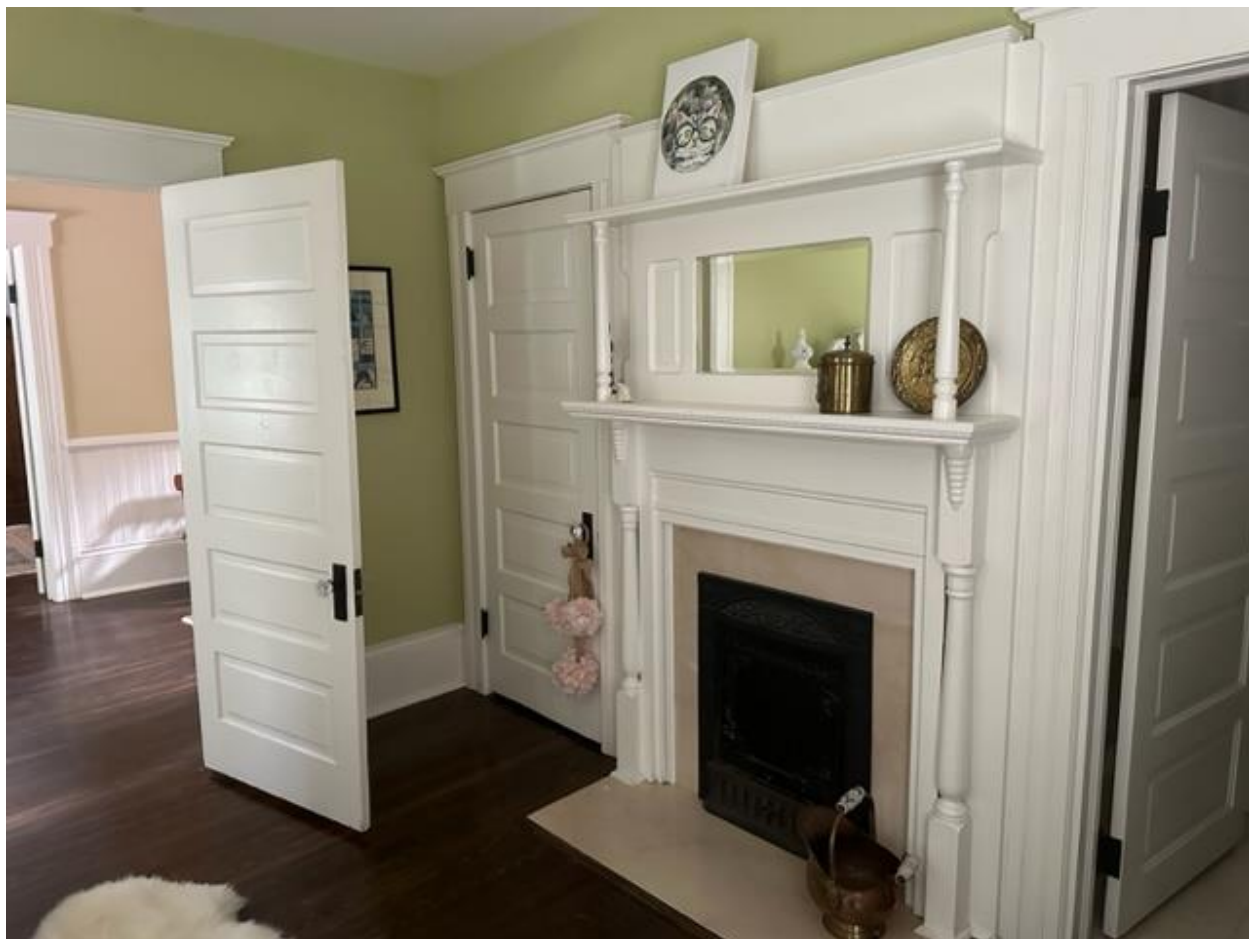
2nd Floor West Side Front Room facing Southeast into hallway