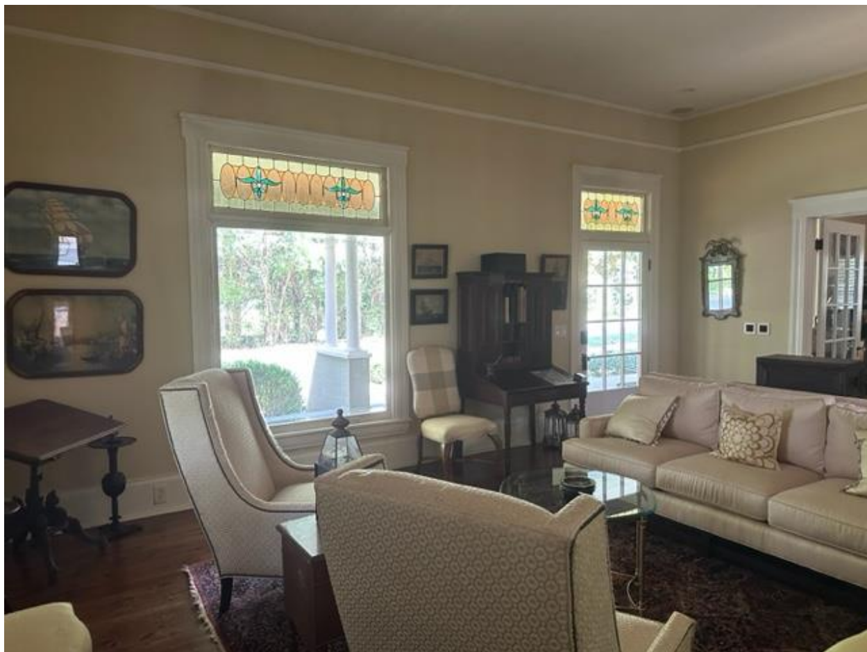
1st Front Formal Living Room Facing Front (North )

Note that the front door and the two large double hung windows on the front of the house are original as well as the Tiffany stain glass features.