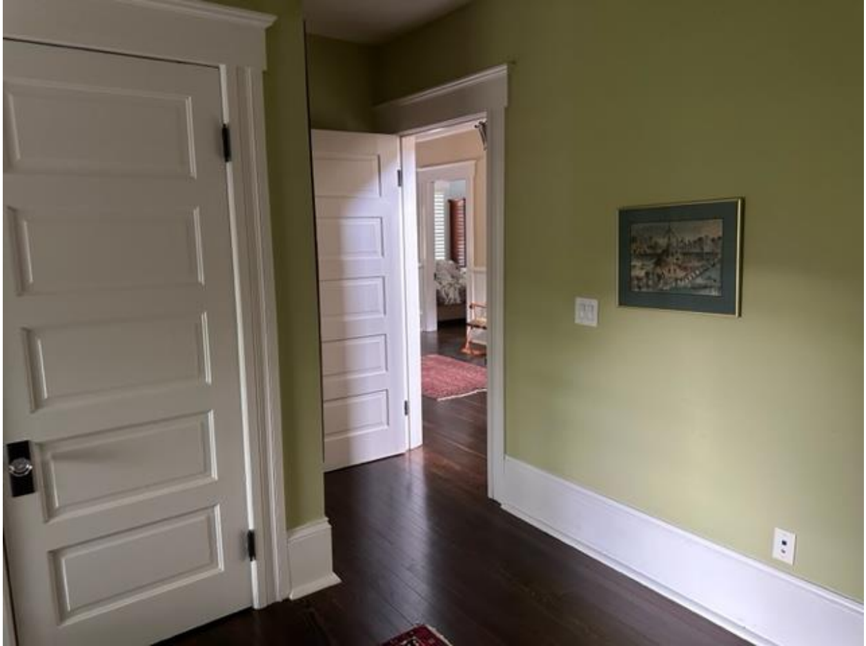
2nd Floor West Side Back Room facing Northeast into hallway