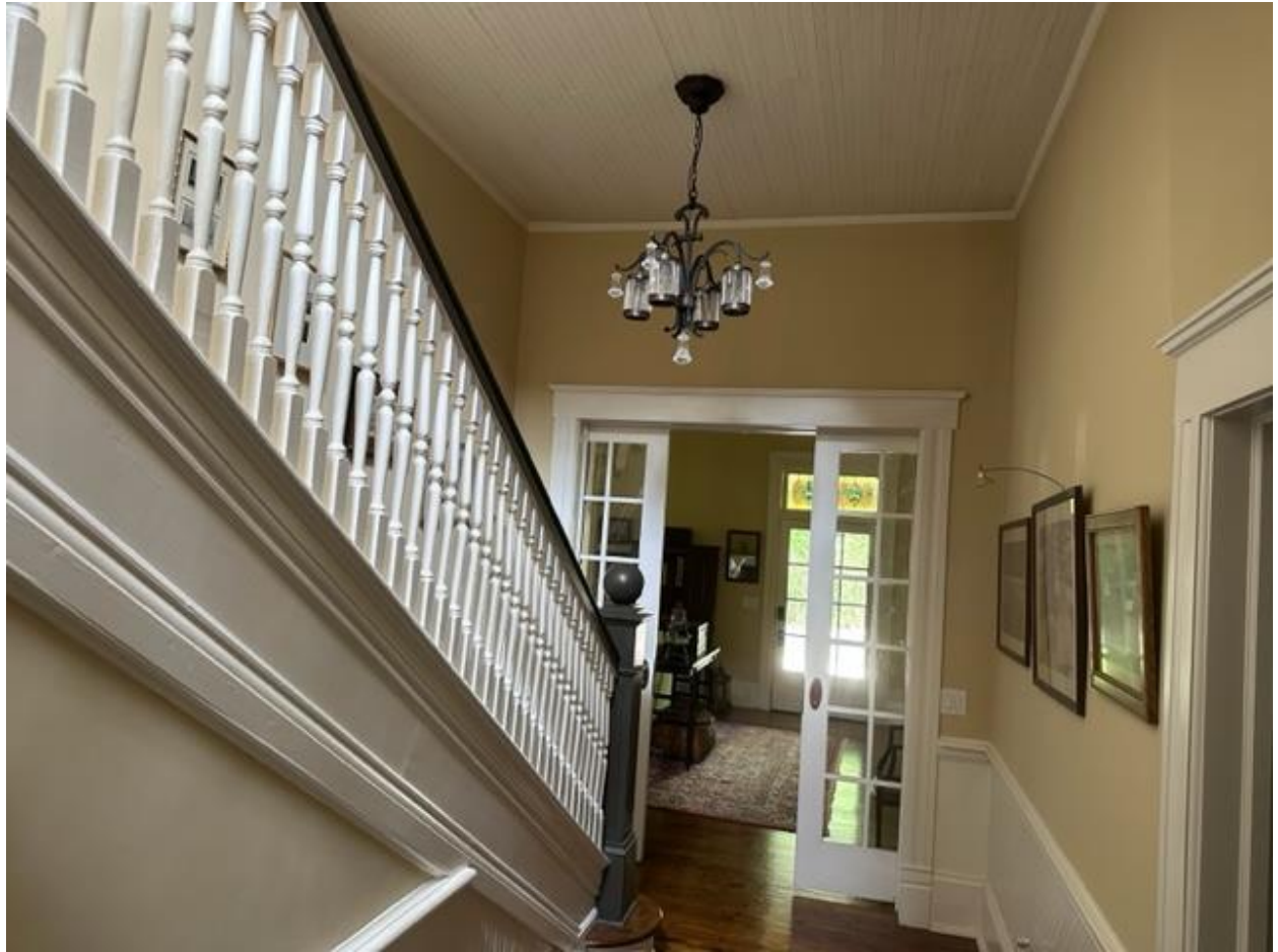
Stairwell Facing Front (North) toward formal living room.jpg