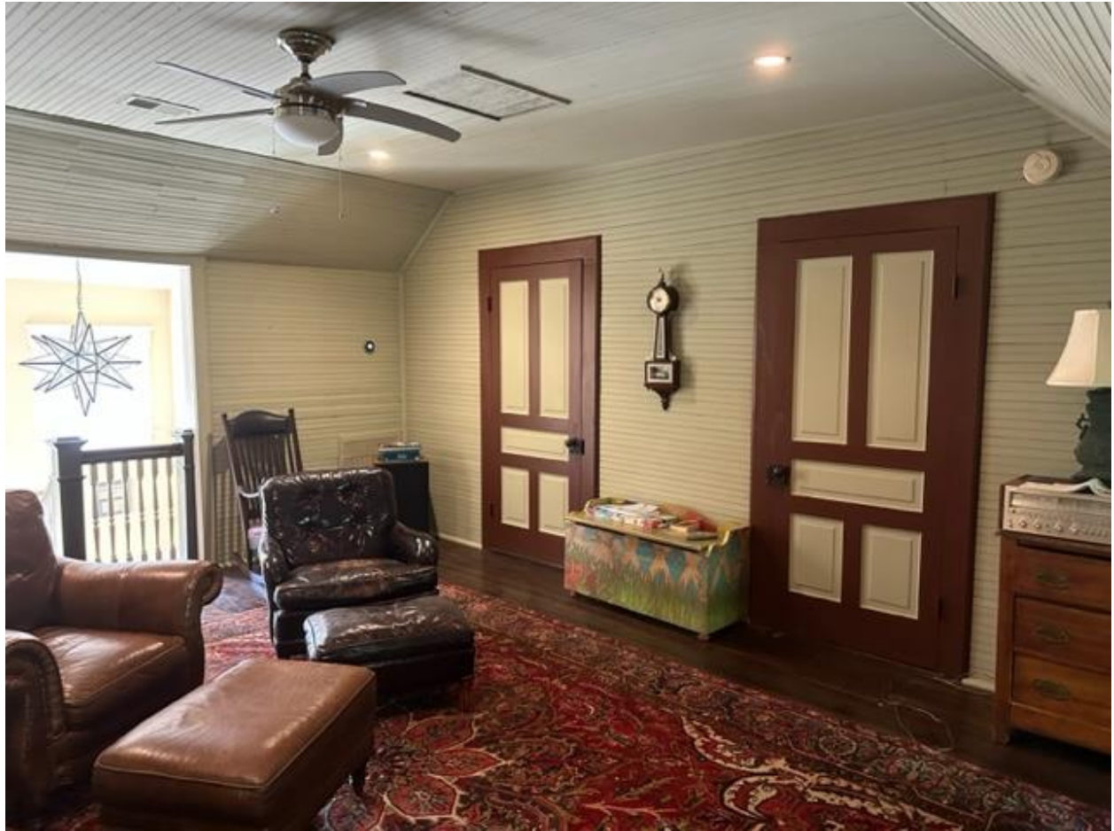
3rd Floor room facing Southwest showing doors entering mechanical room and closet