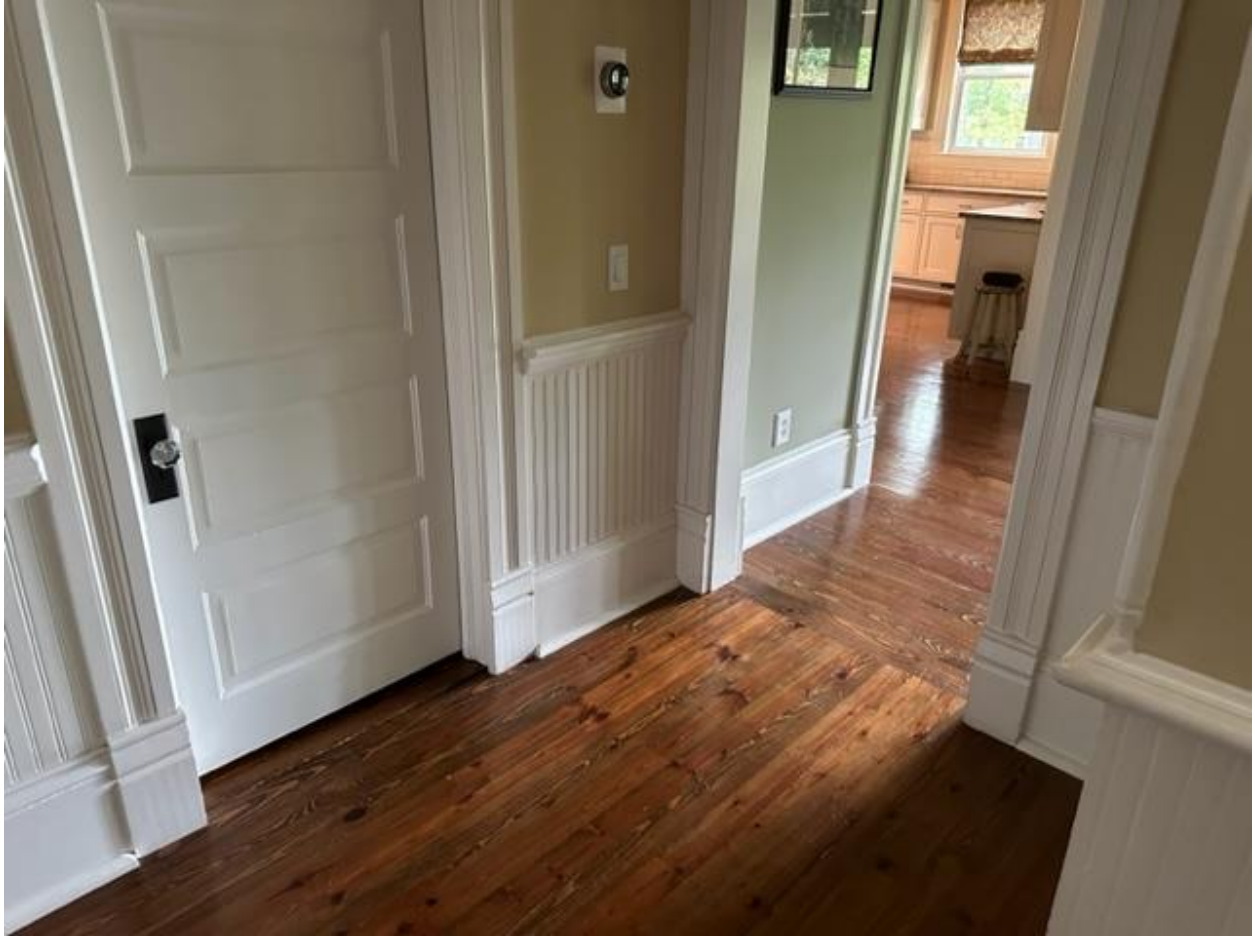
1st Rear Entry To Stairwell facing back into dining room