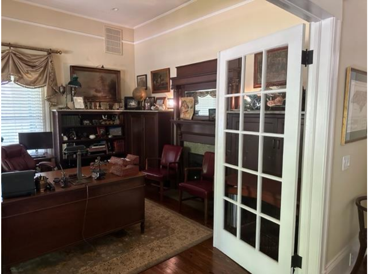
1 st floor Front Office Facing East.

Here is a picture of the damage on that East wall under the office window.