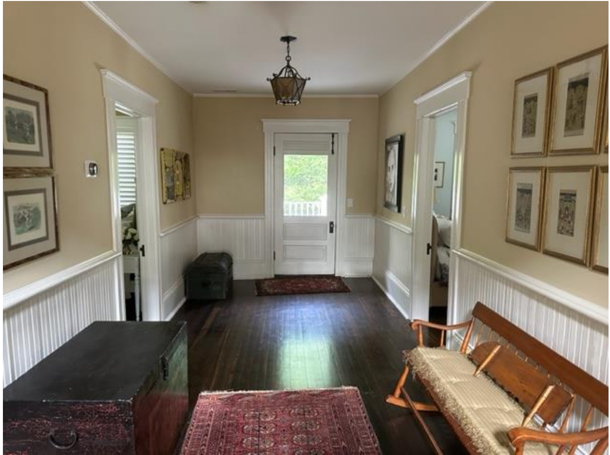
Second Floor Hallway Facing North toward open from porch