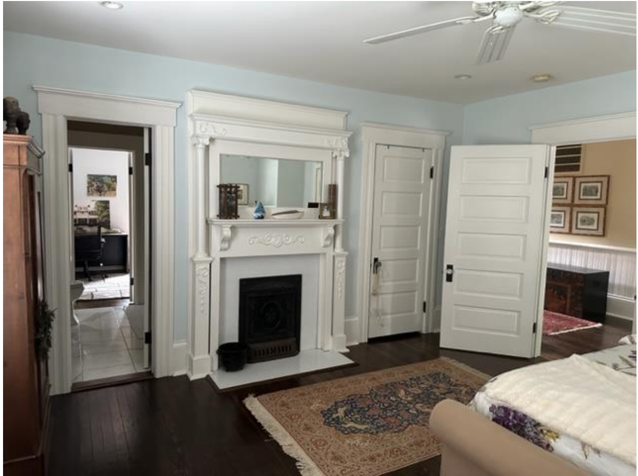
2nd Floor East From Room