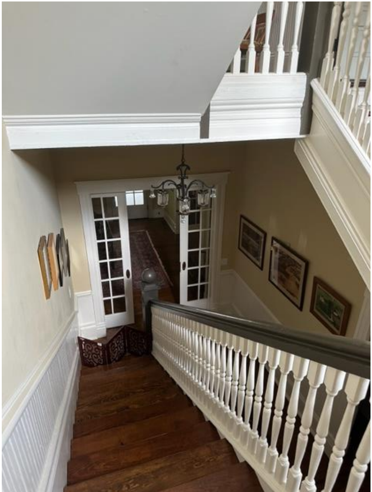
Stairwell from Landing Facing North down to formal living room.jpg