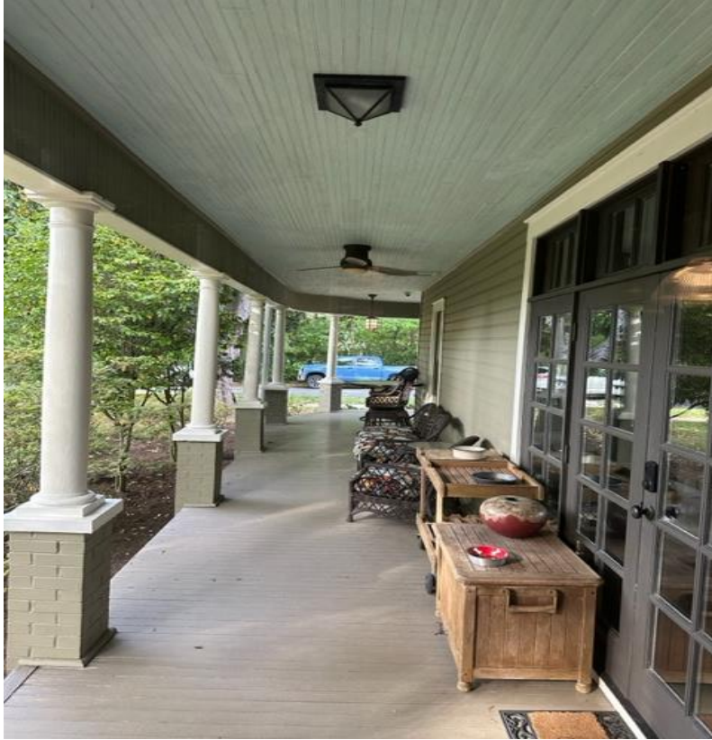
1 st Floor West Porch facing North

Note: West porch enclosure had poorly constructed bath with tub supported by 2x4 on a drain line!