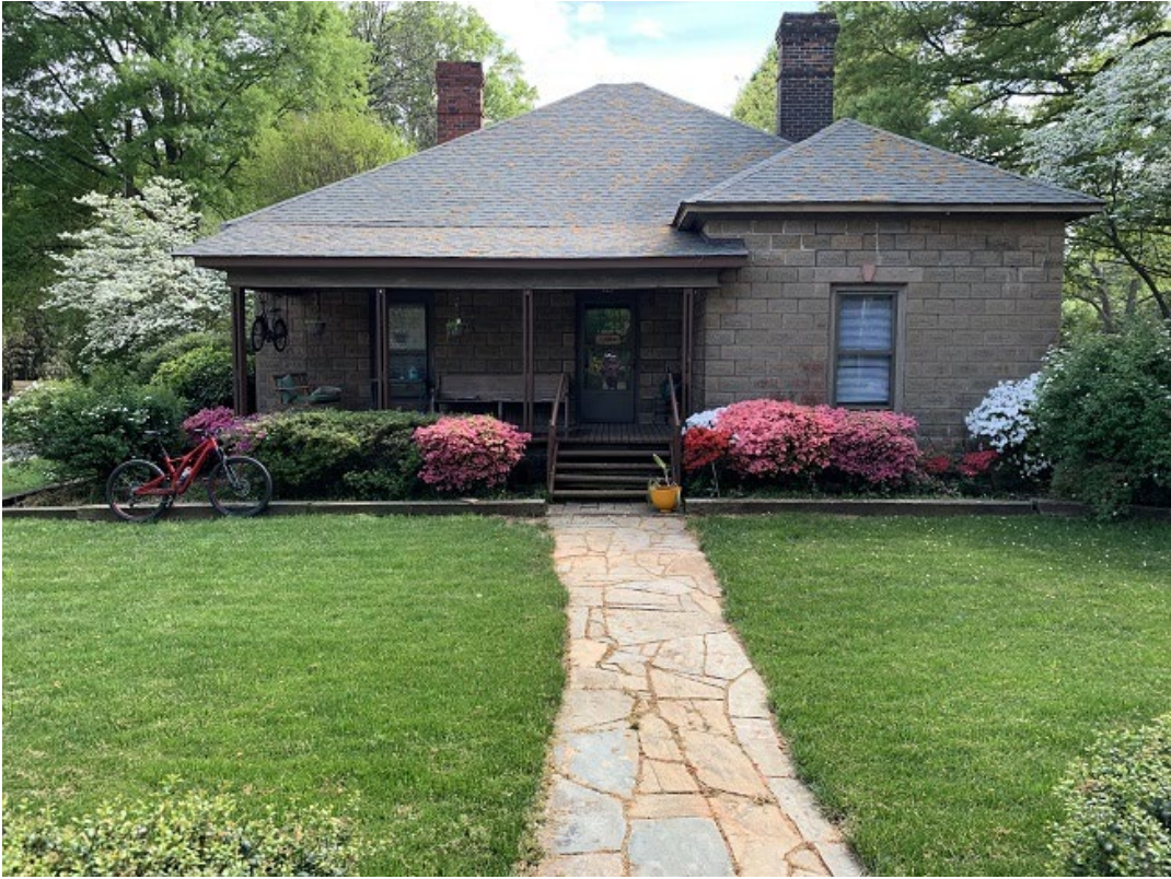
d. Historic 1 st Ward Houses at 801 and 815 E 8th St