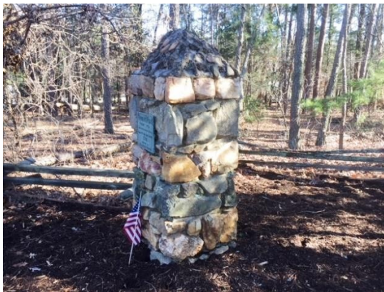
General Davidson Memorial Huntersville