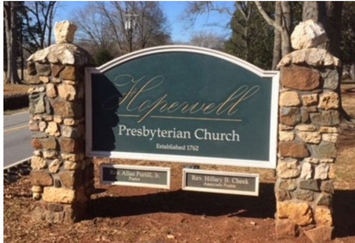
Hopewell Presbyterian Church Sign