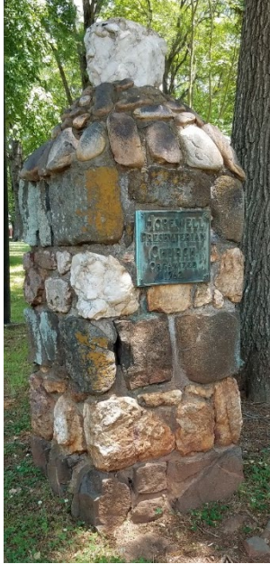
Hopewell Church Marker