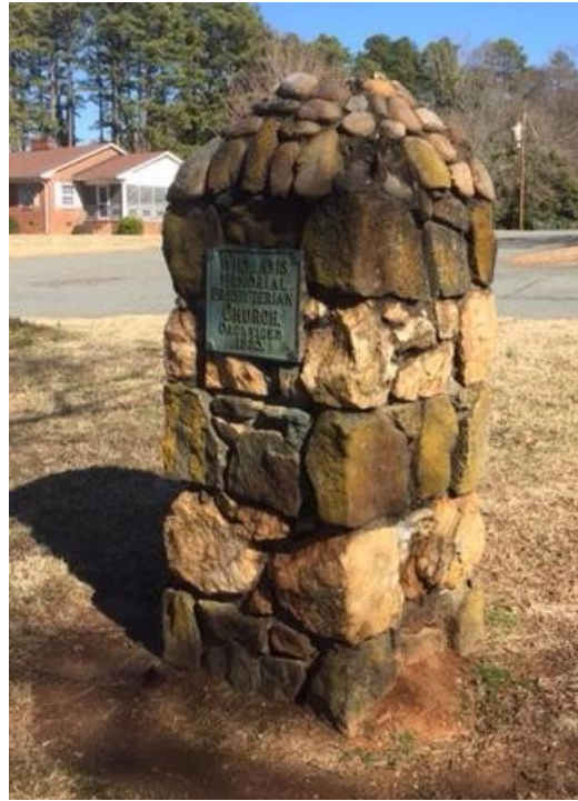
Williams Memorial Presbyterian Church Marker Charlotte