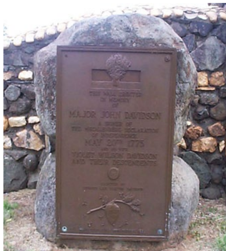
Major John Davidson Marker