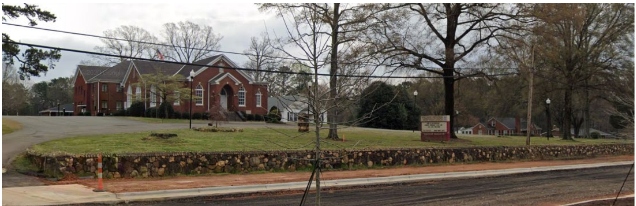
Williams Memorial Presbyterian Church Wall Charlotte