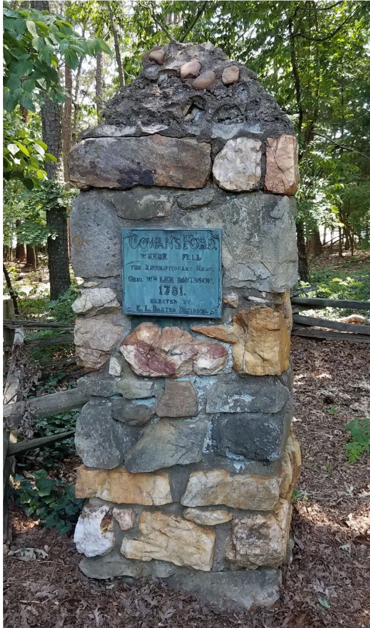
North face of General William Lee Davidson Memorial