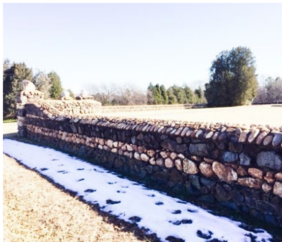
Northwestern Stem leading to Entry Gate of Rural Hill Cemetery

cemetery entrance, consisting of a bronze plaque mounted on a 4.5-foot-tall stone pier of two stacked boulders attached via stonework and mortar to the cemetery wall. Both the wall and the monument are prominent landscape features of the Rural Hill property and are included within a prior designation of Rural Hill as a local historic landmark by the Mecklenburg County Board of County Commissioners. 26