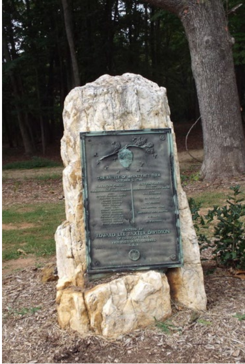
Battle of McIntyre's Farm Monument Charlotte