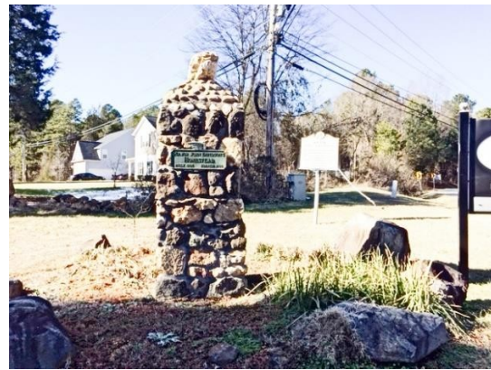
Rural Hill Direction Marker Huntersville