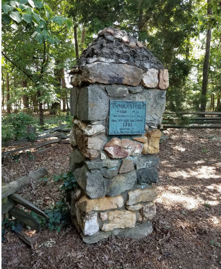
North and east faces of General William Lee Davidson Memorial