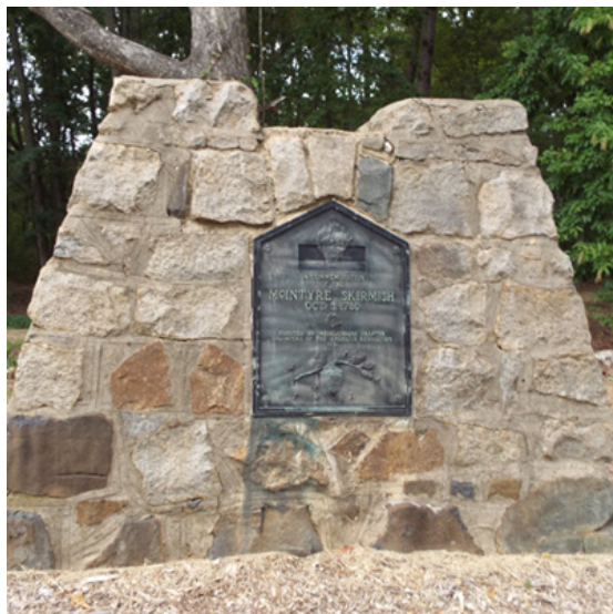
D.A.R. Battle of McIntyre’s Farm monument