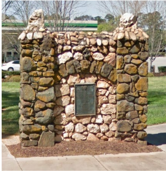
Cowan's Ford – Davidson College Monument Huntersville