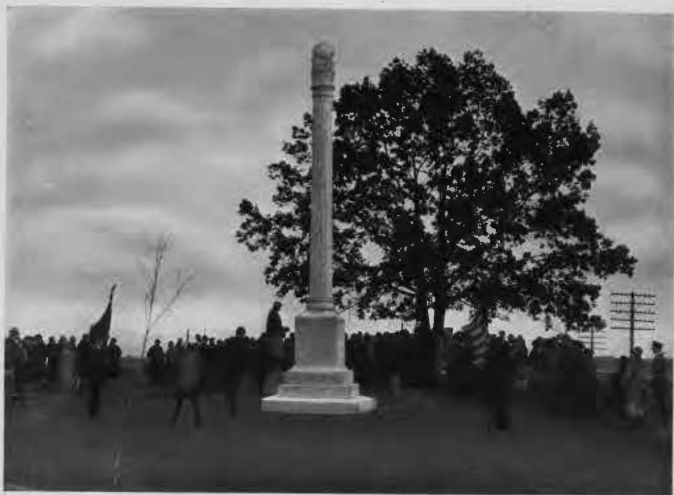
UNVEILING MONUMENT TO COMMEMORATE CAMP GREENE AND THE MEN WHO TRAINED THERE FOR SERVICE IN THE WORLD WAR