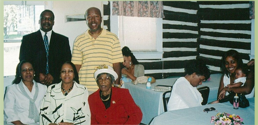
➤ Served as the social hall for Reed's Temple