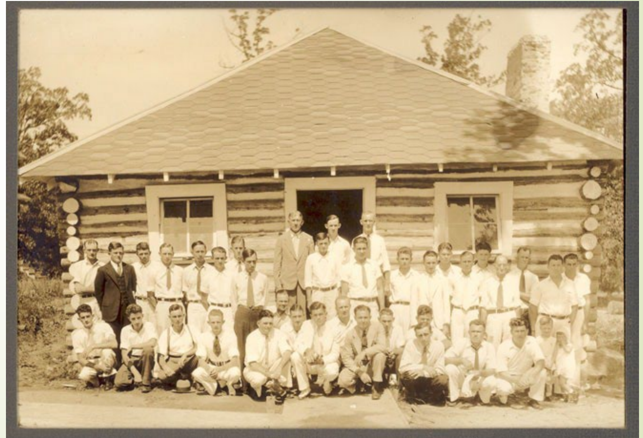
Lingle Hut ca 1933