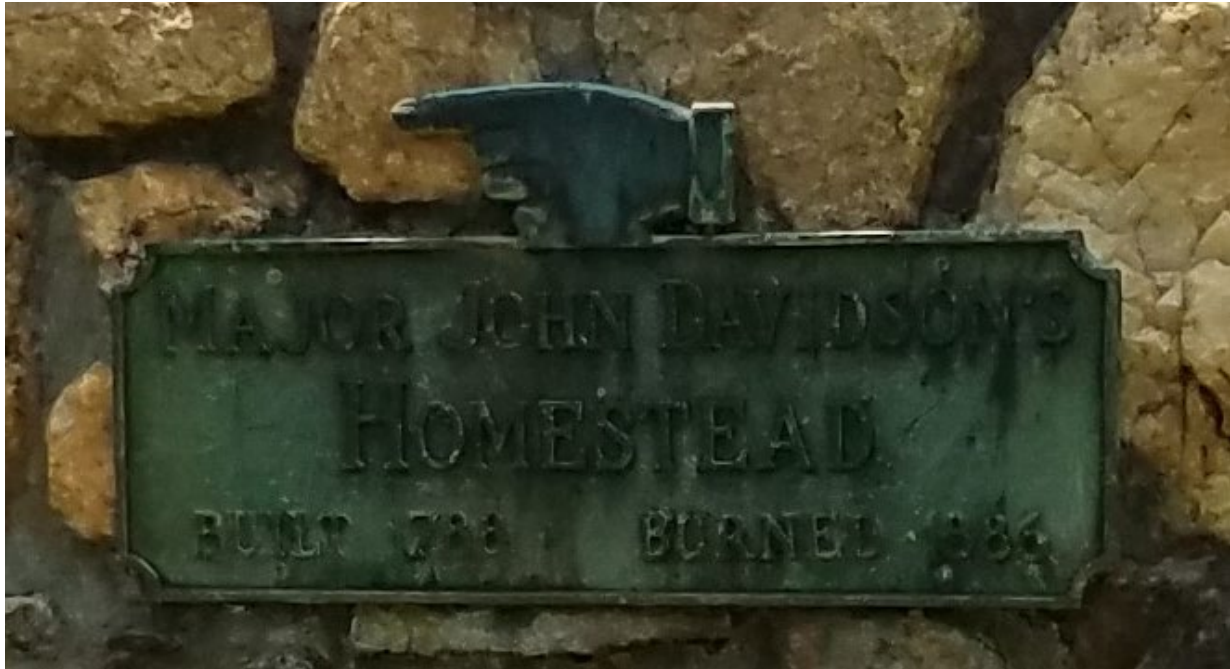
Plaque on Rural Hill directional marker

indicating the direction of the homestead, also known as Rural Hill.