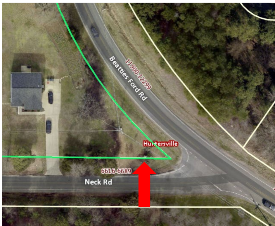
Aerial Image of Rural Hill directional marker (arrow indicates monument's location)

The Rural Hill directional marker is one of only two extant solitary rock piers erected by Baxter Davidson, both of which are located in Huntersville. The second such standalone marker is the General Davidson Memorial, located in a small memorial park on the south side of North Carolina Highway 73, directly across from the McGuire Nuclear Station. Standing on private residential property, some fifty feet from a busy Beatties Ford Road/Neck Road intersection, the continued integrity of the Rural Hill directional marker is at risk, given the rapid growth of both development and vehicular traffic in the immediate area. Indeed, the marker has already been struck and damaged by an automobile at least once, necessitating its reconstruction slightly westward to its current location.