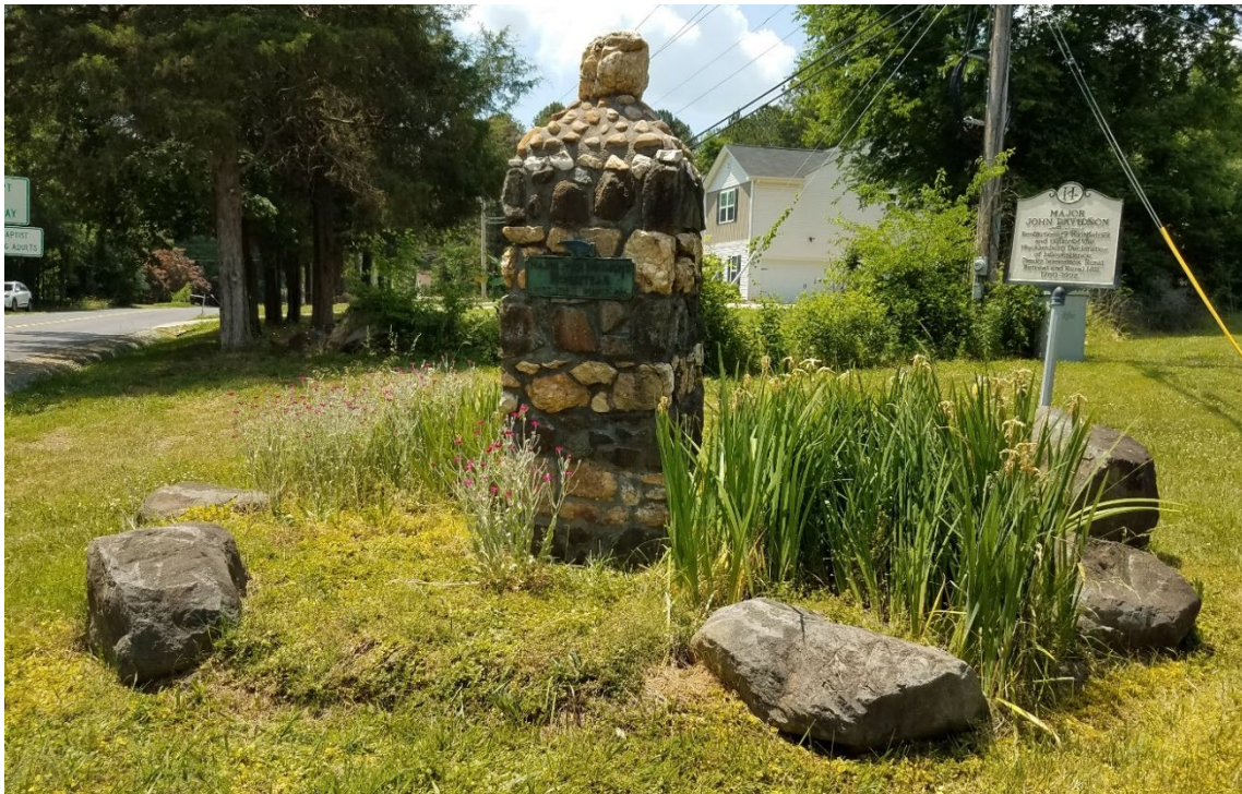
Northeast face of Rural Hill Directional Marker