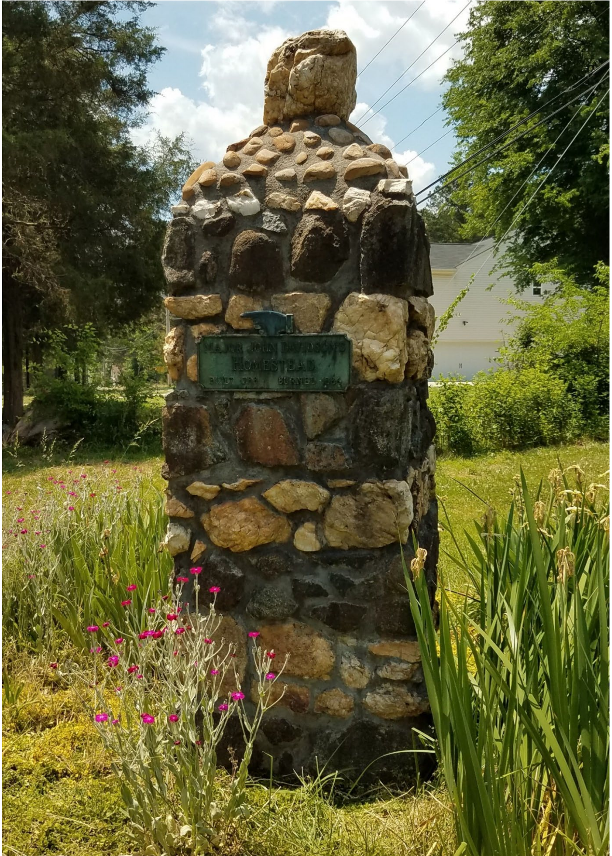
Northeast face of Rural Hill Directional Marker