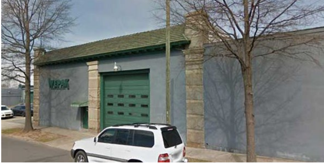
Source: Jason Thomas, “Old building between Craft and Seoul Food sold for adaptive reuse project,” Charlotte Axios , November 17, 2017, https://charlotte.axios.com/109904/old-building-craft-seoul-food-sold-adaptive-reuse-project/ , accessed January 20, 2022.