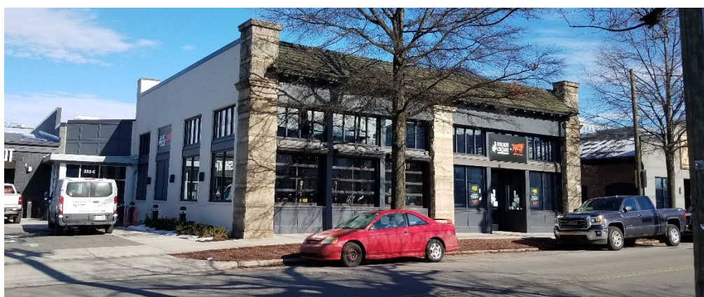
January 19, 2022.