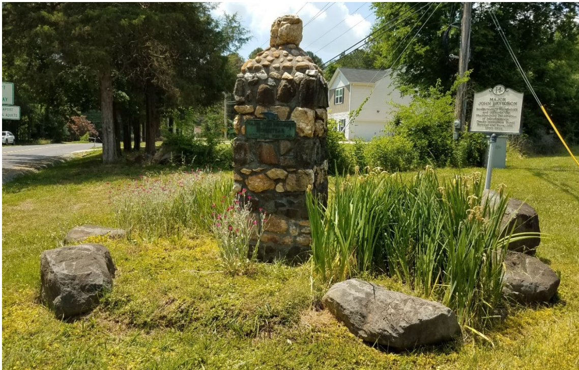
Rural Hill Directional Marker