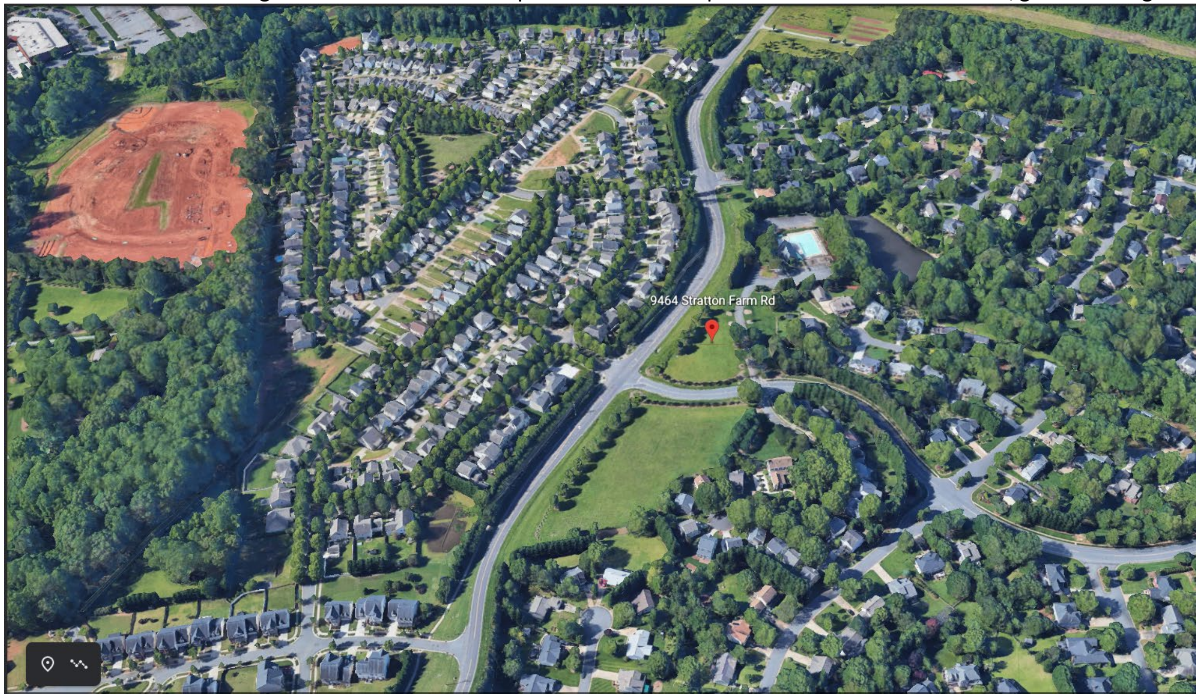
View from North showing intensification of development in area and presence of sidewalk and curb/gutter throughout.