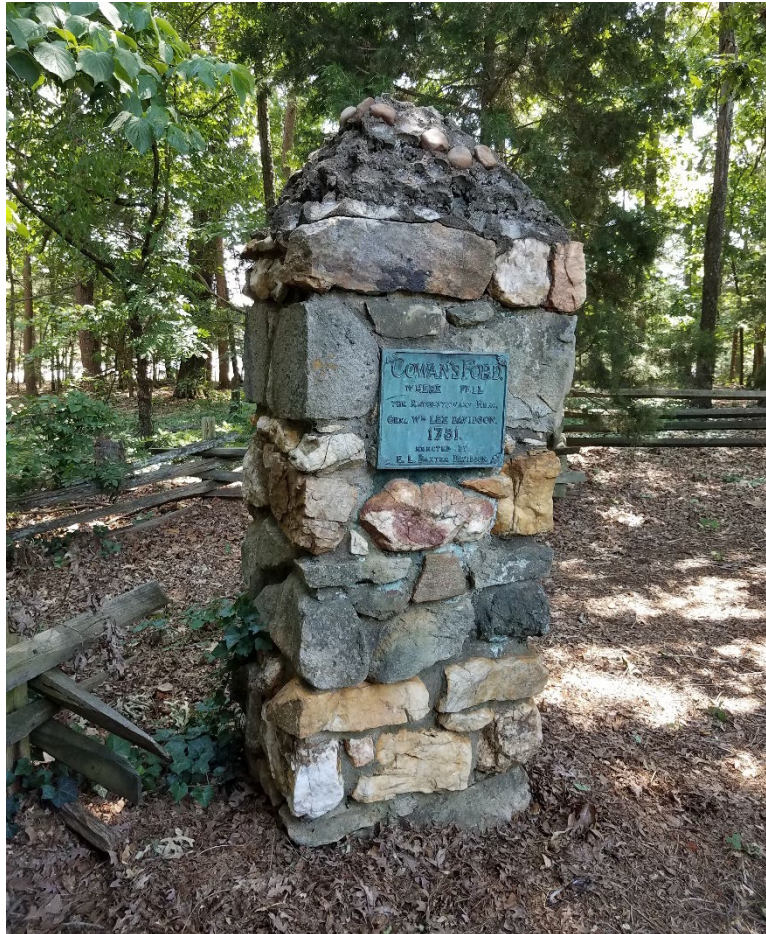
General William Lee Davidson Memorial