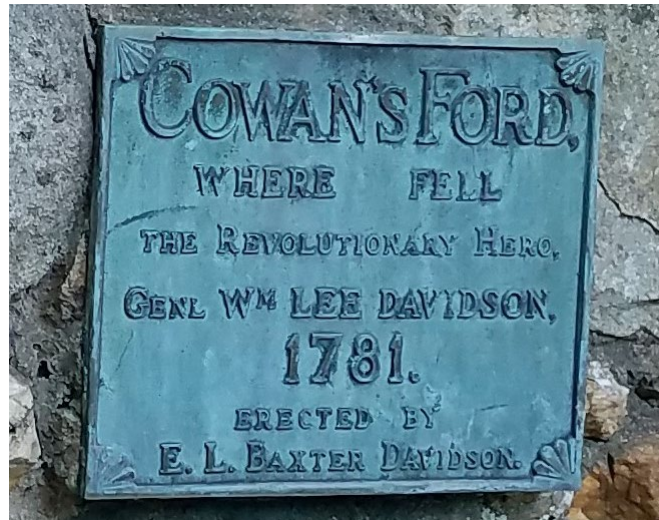
Plaque on General Davidson Memorial

Like the Rural Hill directional marker, the stem or visible face of the General Davidson Memorial is composed of alternating strings of rough-faced dark brown and white stones. The stones are embedded in mortar, and the stem of the pier rises perpendicularly from a toeless foundation to a pyramidal cap (comprising approximately 12 inches of the entire memorial's height) that is partially decorated with small, smooth, white stones. Given its physical similarity to the Rural Hill directional marker, one would expect the cap of the General Davidson Memorial to be fully decorated with more small stones and topped with a large rock finial, like its Rural Hill counterpart. Over time, however, many of the decorative stones comprising the memorial's cap appear to have been dislodged, leaving the cap's surface bare and dimpled in several places. The slightly flattened top of the memorial's cap suggests that it may also have originally featured a stone finial. The memorial is approximately 2.5 feet in both length and width.