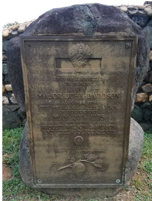
Plaque on Major John Davidson Marker