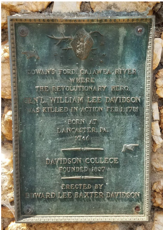
Plaque on Cowan's Ford – Davidson College Monument

A large metal plaque is positioned on the south-facing side of the monument. It reads “COWAN’S FORD, CATAWBA RIVER / WHERE / THE REVOLUTIONARY HERO, / GEN’L. WILLIAM LEE DAVIDSON / WAS KILLED IN ACTION FEB. 1, 1781 / BORN AT / LANCASTER, PA. / 1746 / DAVIDSON COLLEGE / FOUNDED 1837 / ERECTED BY / EDWARD LEE BAXTER DAVIDSON.” The top of the plaque features a depiction in relief of a hornet’s nest attached to a tree branch surrounded by flying hornets, the historic Revolutionary War symbol of Mecklenburg County. That image incorporates similar design elements as the hornet’s nest featured at the bottom of the Major John Davidson Marker plaque located at the Rural Hill Cemetery (also created at the behest of Baxter Davidson), but the two designs are decidedly different in overall conception and execution. The Cowan’s Ford – Davidson College Monument plaque also depicts two stylized hands, one indicating the direction of the site of the Battle of Cowan’s Ford and the other pointing toward Davidson College.