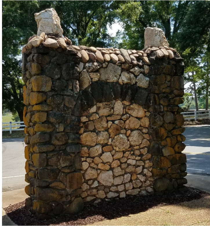
North Face of Cowan's Ford – Davidson College Monument