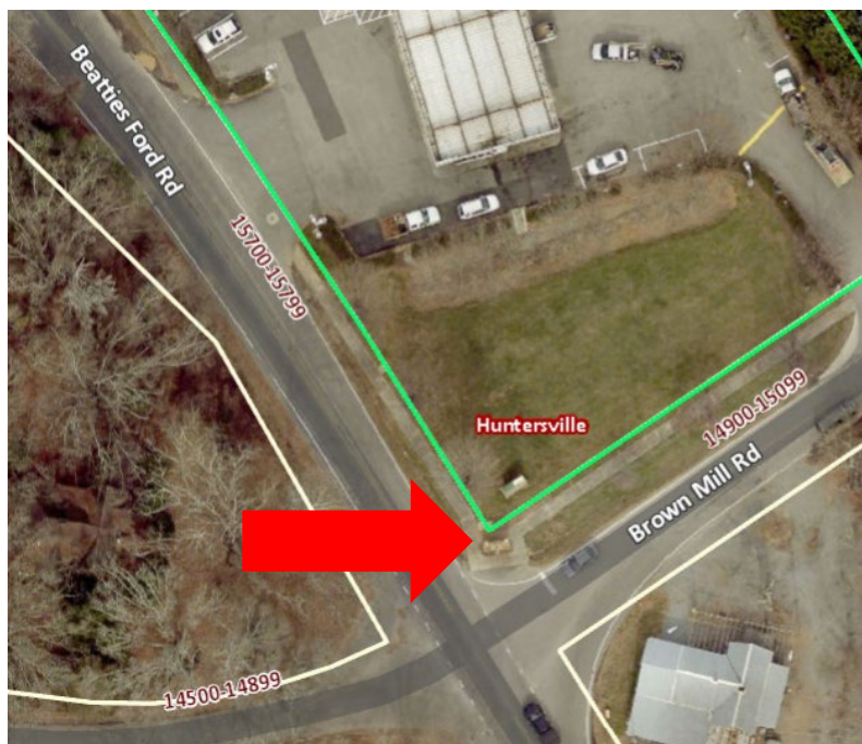
Aerial Image of Cowan's Ford – Davidson College Monument (arrow indicates monument's location)

The Cowan's Ford – Davidson College Monument is located to the immediate northeast of the intersection of Brown Mill and Beatties Ford Roads. The monument's purpose is to instruct people traveling northward by automobile on Beatties Ford Road to turn left if they wish to proceed to the site of the Battle of Cowan's Ford (a February 1, 1781, Revolutionary War battle) or to turn right if they wish to visit Davidson College. The proximity of the monument to a busy Beatties Ford Road intersection that lies less than 400 feet south of North Carolina Highway 73 places the monument's continued integrity at risk, given the rapid growth of both development and vehicular traffic in the immediate area.