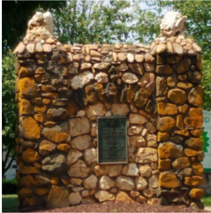
South Face of Cowan's Ford – Davidson College Monument