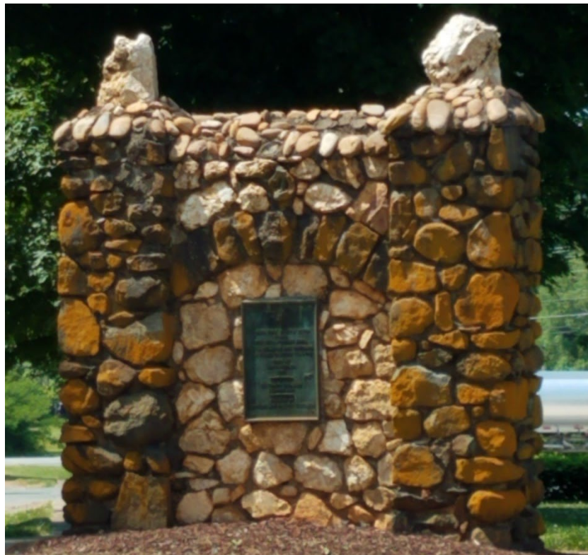
South Face of Cowan's Ford – Davidson College Monument