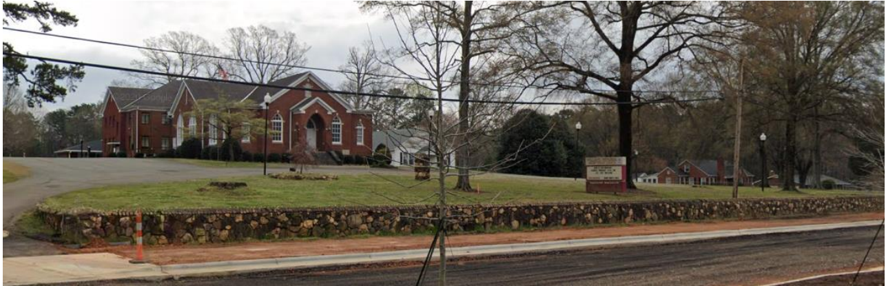
Williams Memorial Presbyterian Church Wall