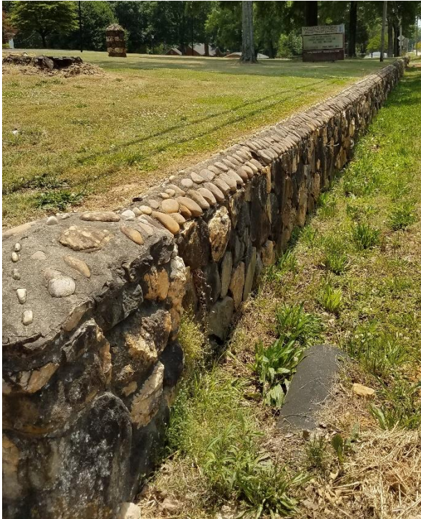
Looking Toward Southern Terminus of Williams Memorial Wall