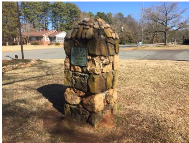
Williams Memorial Presbyterian Church Marker