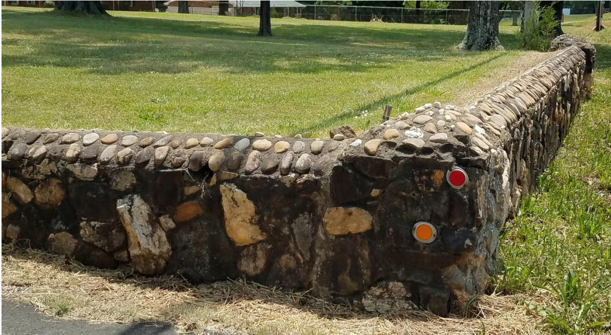
Southern Entrance to Williams Memorial Presbyterian Church Property Looking Toward Southern Terminus of Wall

A stone pier provided by Baxter Davidson stands in front of the main church building, nearly 50 feet behind the stone wall. The pier resembles a similar marker on the grounds of Hopewell Presbyterian Church. Both markers feature a stem composed of alternating strings of rough-faced dark brown stones and strings of rough-faced white stones, all embedded in mortar. Each marker rises perpendicularly from a toeless foundation to a pyramidal cap decorated with small, smooth, lighter-colored stones, and features a metal plaque displaying the name and founding date of the relevant church. Both markers stand approximately 6 feet tall and 2.5 feet in both length and width, but the Hopewell marker has a flint-rock finial fixed atop its cap that adds approximately 12 inches to its overall height. The Williams Memorial marker has no finial, but the slightly flattened top of its cap suggests that a stone finial may have originally topped the pier.