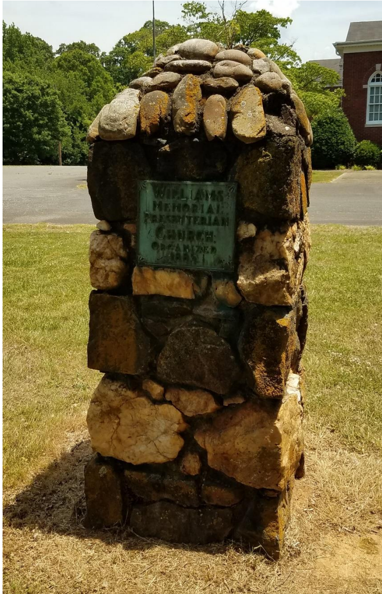
Williams Memorial Church Marker