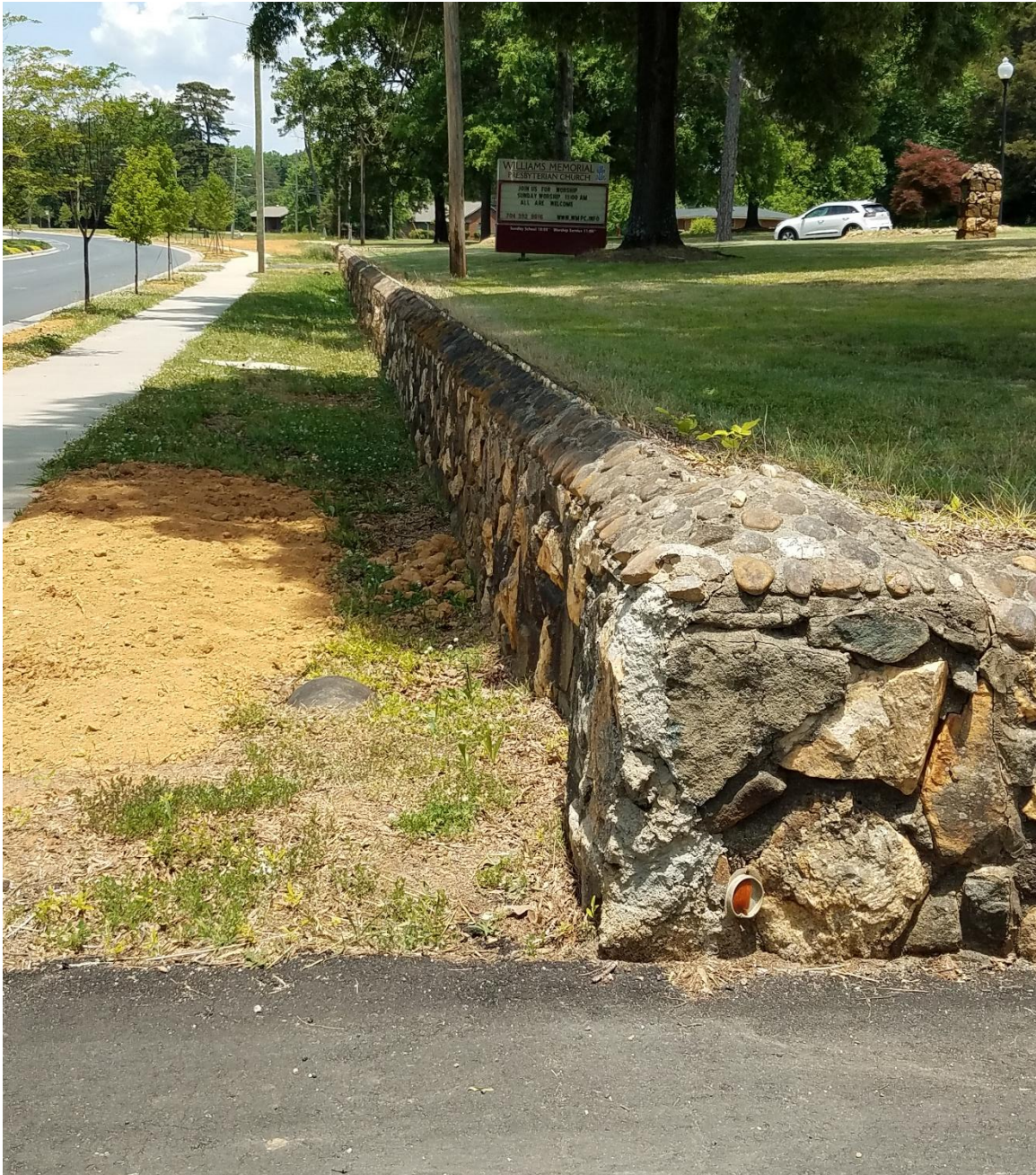
Southern Entrance to Williams Memorial Presbyterian Church Property Looking Toward Northern Terminus of Wall