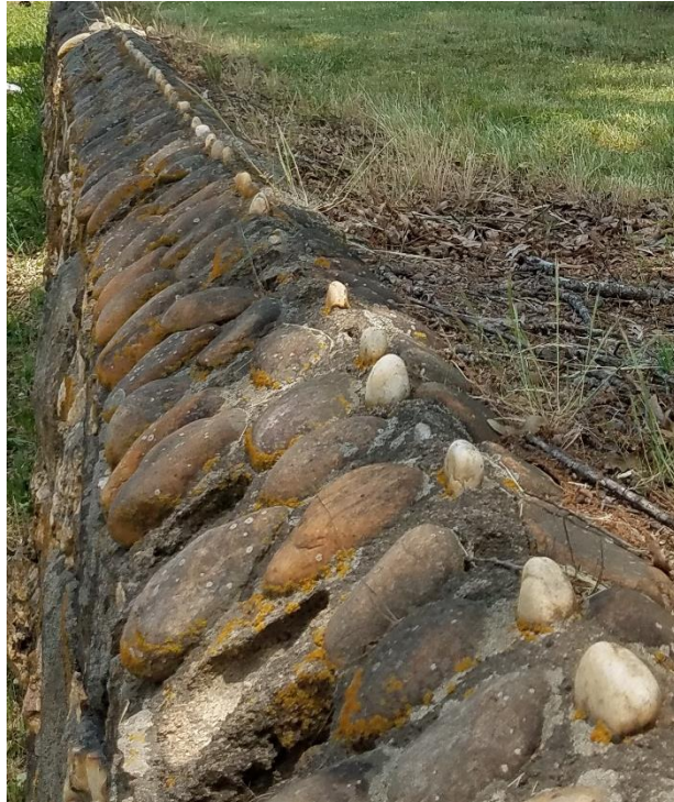
Detail of Domed Cap of Williams Memorial Wall