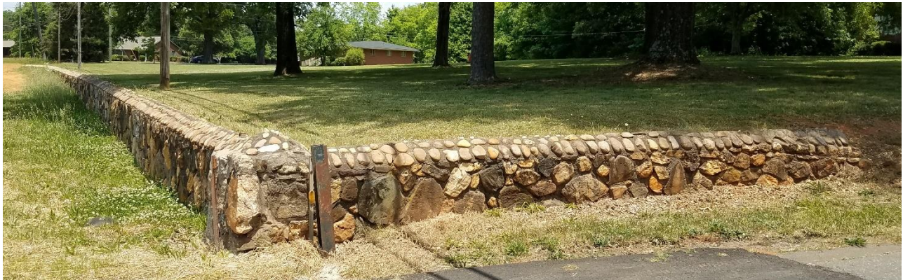
Northern Entrance to Williams Memorial Presbyterian Church Property Looking Toward Northern Terminus of Wall

In form and execution, the Williams Memorial wall is the least refined of the stone structures erected by E. L. Baxter Davidson in north Mecklenburg County. In comparison, the walls he provided for Huntersville's Hopewell Presbyterian Church span both sides of Beatties Ford Road and are longer (approximately 1,000 feet long on the eastern side of Beatties Ford Road and approximately 830 feet long on the western side), taller (ranging from 5 to 6 feet tall on the eastern side and from 3 to 4 feet tall on the western side), and deeper (both Hopewell walls are approximately 2 feet deep). The Hopewell walls are also more elaborate, featuring alternating symmetrical bands of white and dark brown rocks, as well as stairways and more piers. The Williams Memorial wall features only two openings providing access for a semicircular driveway into the church grounds.