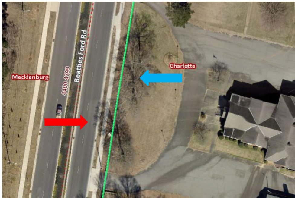
Aerial Image of Williams Memorial Presbyterian Church Wall (red arrow indicates wall's location; blue arrow indicates marker's location)

The stone wall erected by E. L. Baxter Davidson at Williams Memorial Presbyterian Church is located approximately 20 feet from a four-lane stretch of Beatties Ford Road, and extends nearly 730 feet along the property's frontage on the eastern side of that busy thoroughfare. Given its proximity to the rapid development along the Beatties Ford Road corridor and the accompanying increase in vehicular traffic, the wall's continued integrity is at risk.