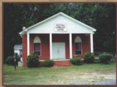
The second sanctuary of Matthews Chapel was built in 1952. The bell from the first church was placed beside the new structure.