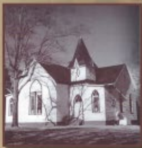
Early Tank Town residents attended Murkland Presbyterian Church, on Old Providence Road before the Matthews Chapel Presbyterian Church was built.