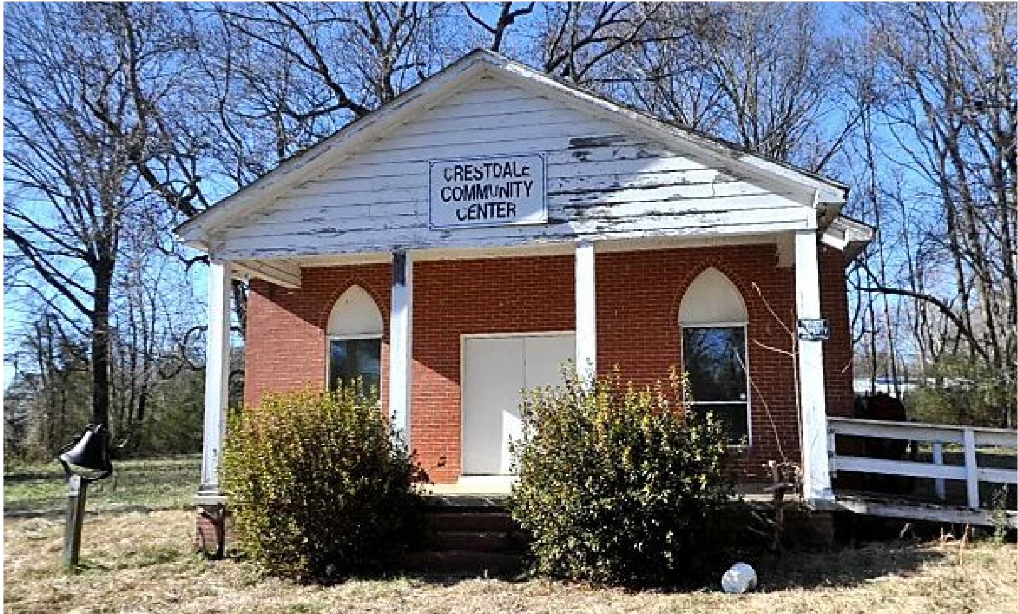
Matthews Chapel Presbyterian Church