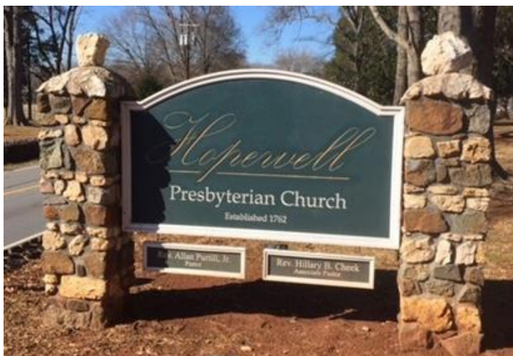
Hopewell Presbyterian Church Sign