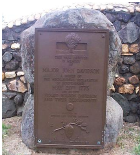
Major John Davidson Marker