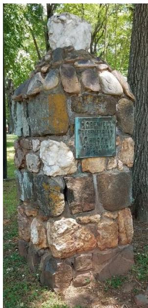
Hopewell Church Marker