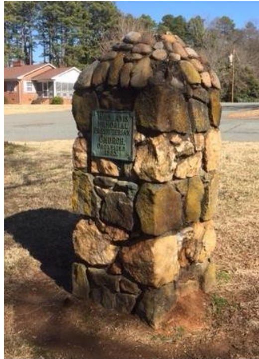
Williams Memorial Presbyterian Church Marker Charlotte