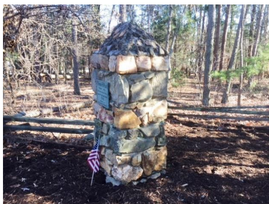
General Davidson Memorial Huntersville