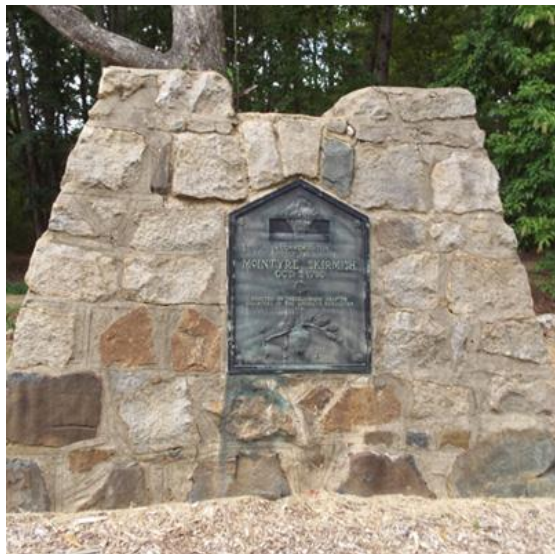
D.A.R. Battle of McIntyre's Farm monument