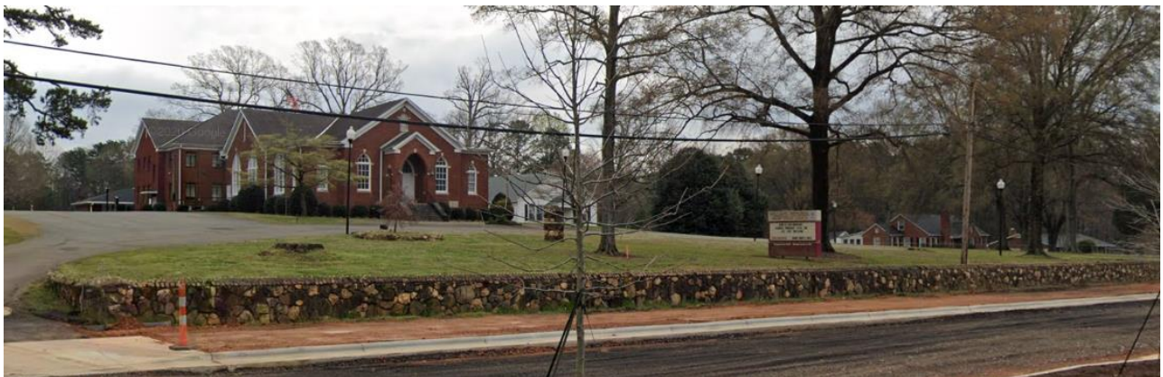
Williams Memorial Presbyterian Church Wall Charlotte