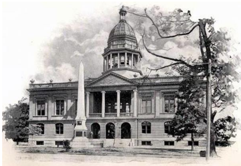
Original Location of Signers' Monument

the signers of the Mecklenburg Declaration of Independence. Dedicated on May 20, 1898, the marker was originally located at the Mecklenburg County Courthouse on South Tryon Street. It now stands in front of the former Courthouse on East Trade Street. 14