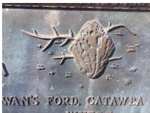
Hornet's Nest on the Cowan's Ford – Davidson College Monument. The Hornet's Nest was the historic Revolutionary War symbol of Mecklenburg County.