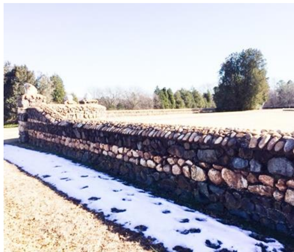
Northwestern Stem leading to Entry Gate of Rural Hill Cemetery

cemetery entrance, consisting of a bronze plaque mounted on a 4.5-foot-tall stone pier of two stacked boulders attached via stonework and mortar to the cemetery wall. Both the wall and the monument are prominent landscape features of the Rural Hill property, and are included within a prior designation of the property as a local historic landmark by the Mecklenburg County Board of County Commissioners. 26