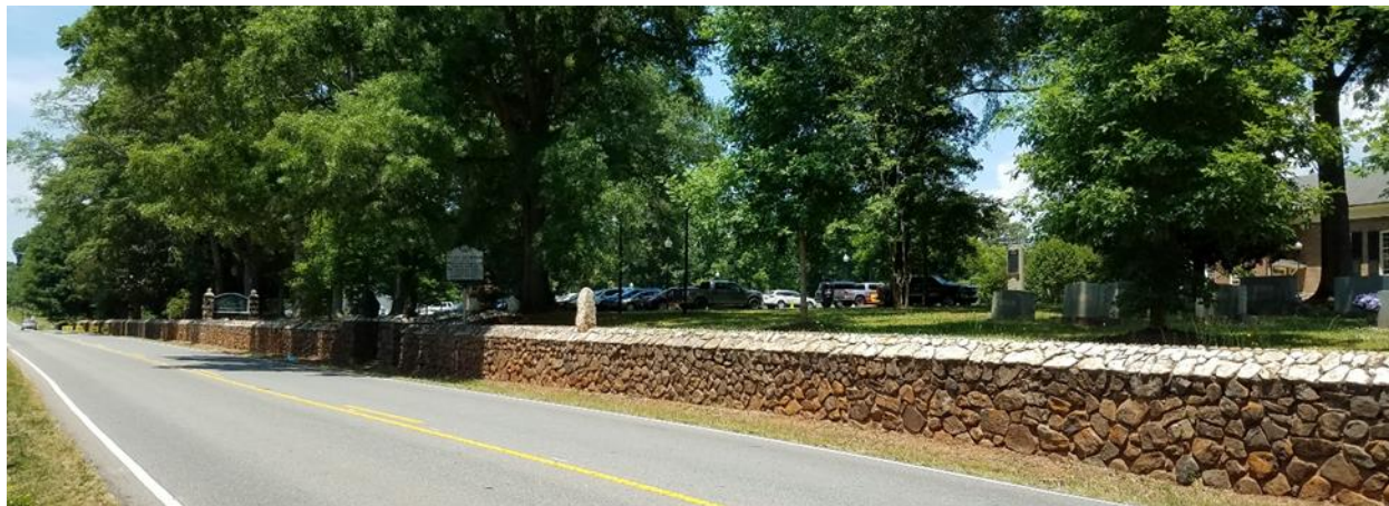
East Wall – Hopewell Presbyterian Church

Davidson was also responsible for the construction of stone structures at Huntersville's Hopewell Presbyterian Church (10500 Beatties Ford Road), including stone walls lining both sides of Beatties Ford Road (each exceeding approximately 500 feet in length), a stone pier marker approximately 6 feet tall identifying the church and its founding date, and a pair of 6-foot-tall stone piers that support an engraved wooden church sign. Those stone structures are prominent landscape features of the Hopewell church property, and are included within a prior designation of the property as a local historic landmark by the Mecklenburg County Board of County Commissioners. 27