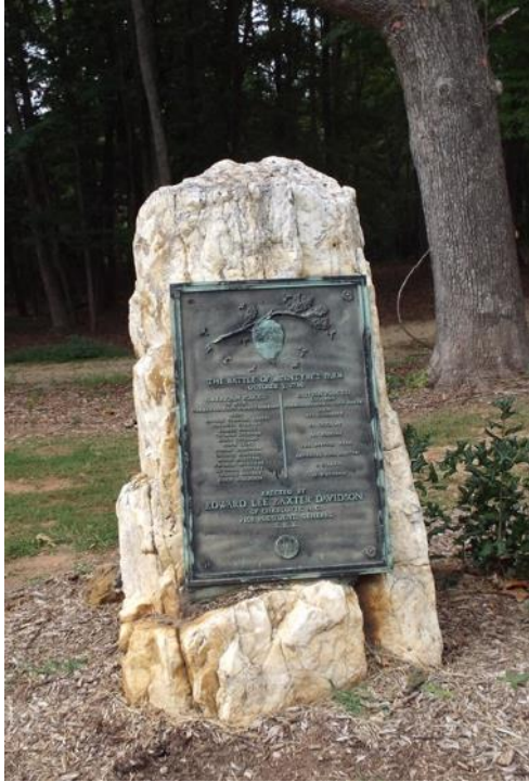
Battle of McIntyre's Farm Monument Charlotte