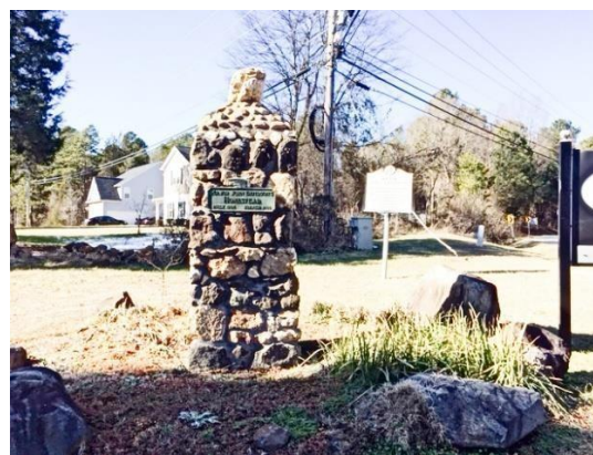
Rural Hill Direction Marker Huntersville