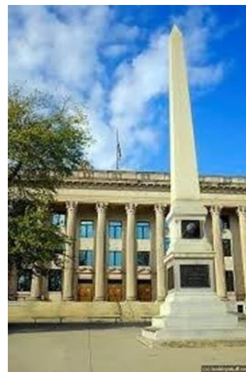
E. Trade St. Location of Signers' Monument