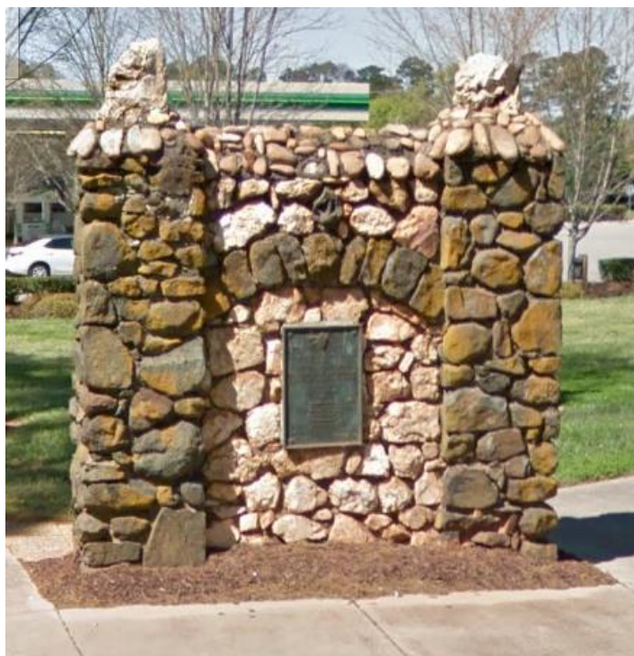
Cowan's Ford – Davidson College Monument Huntersville