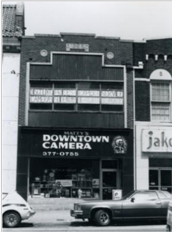
Matty's Downtown Camera, 314 South Tryon Street, Charlotte