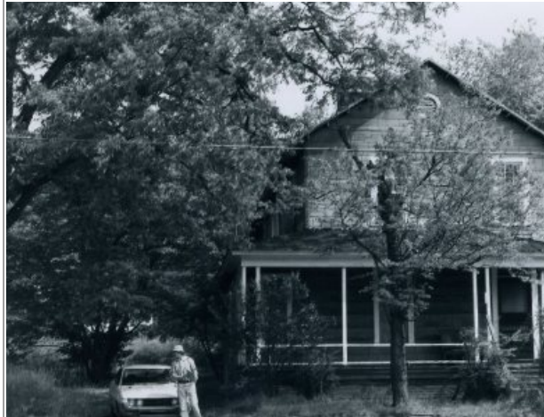
424 North Poplar Street, Charlotte