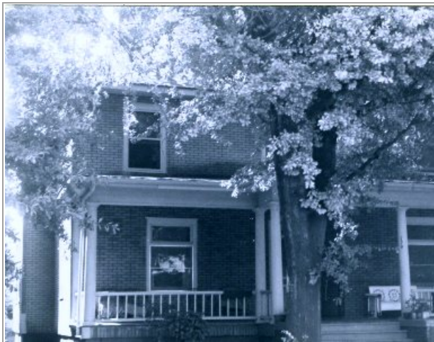
229 South Cedar Street, Charlotte