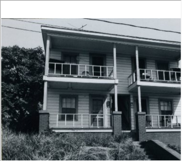
417 North Caldwell Street, Charlotte