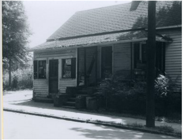
319 South Cedar Street, Charlotte