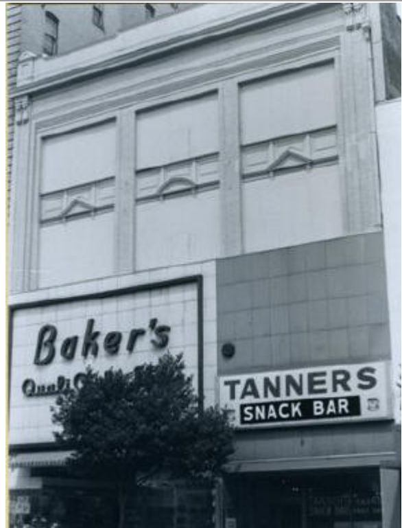
Bakers Shoes & Tanners Snack Bar, 111 North Tryon Street, Charlotte