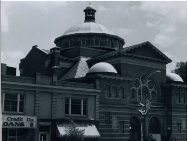
First Baptist Church, 324 North Tryon Street, Charlotte