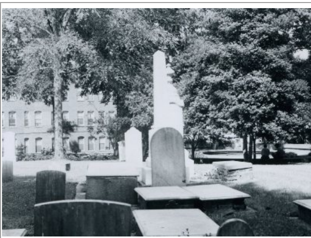
Old Settler's Cemetery, W. Fifth Street, between Poplar St. and Church Street.