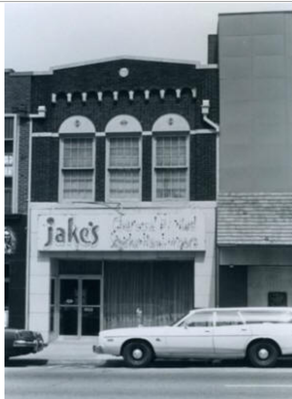
Jake's, 312 South Tryon Street, Charlotte