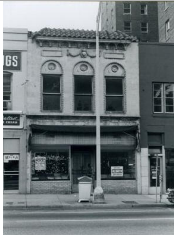
227 West Trade Street, Charlotte