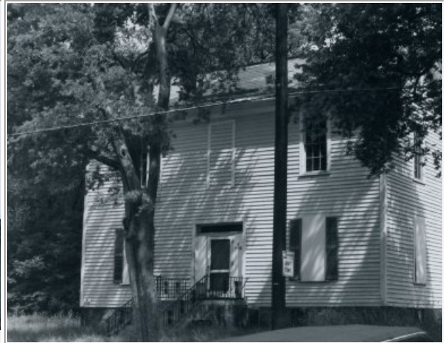
McClung House, 418 North Poplar Street, Charlotte