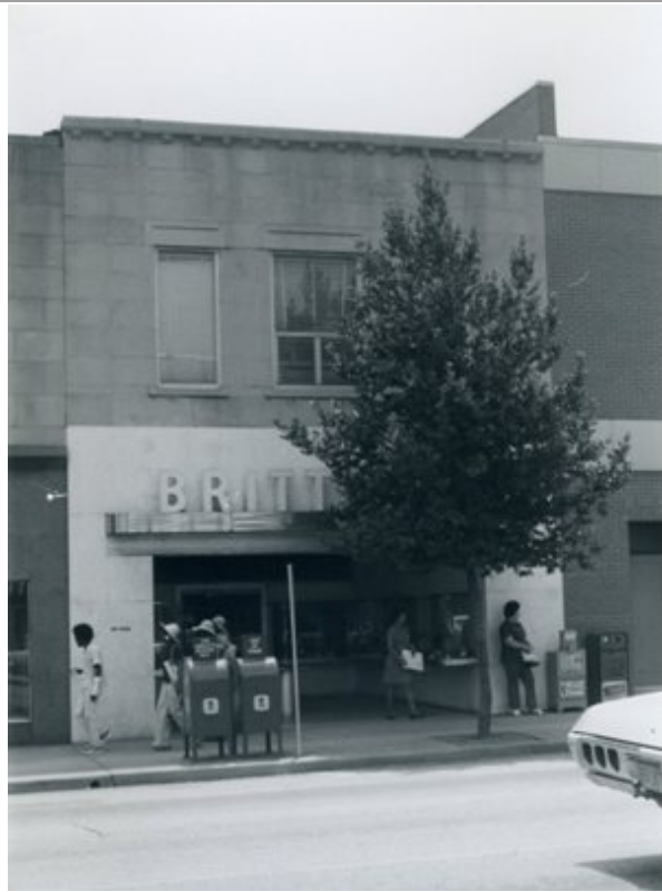
Brittain's Shoes, 204 North Tryon Street, Charlotte