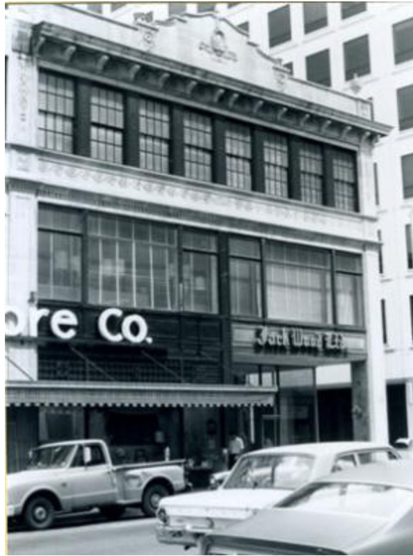
Sears Roebuck Department Store, 300-04 South Tryon Street, Charlotte