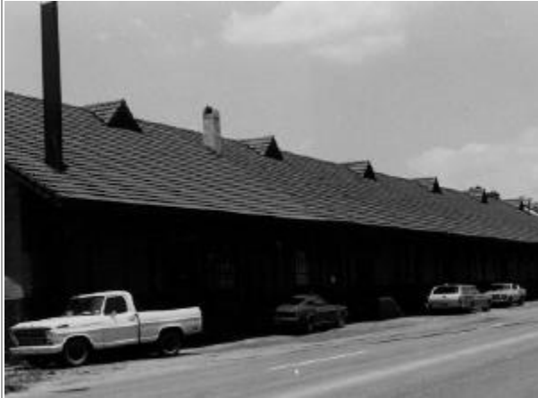
Piedmont & Northern Railroad Freight Depot, West side of Mint St., between 2nd & 3rd Streets, Charlotte