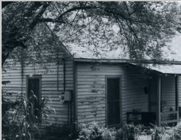
329 South Cedar Street, Charlotte