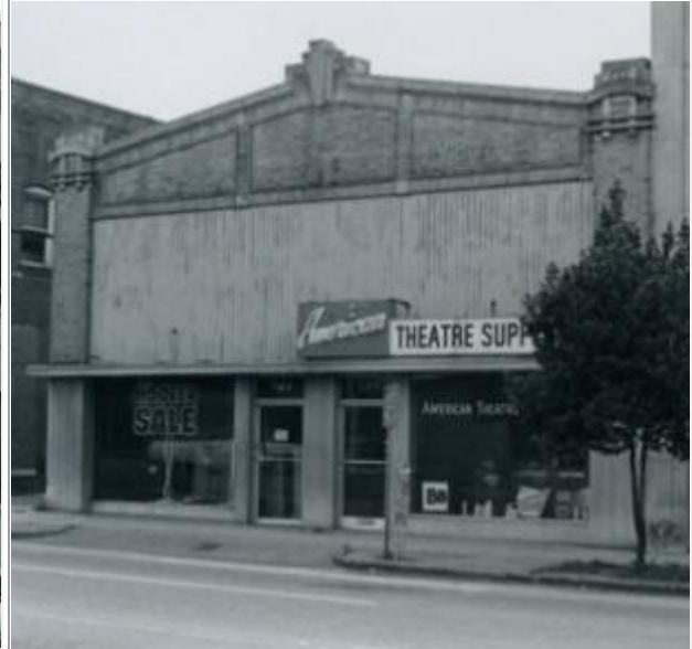
American Theatre Supply Company, 579-29 South Tryon Street, Charlotte