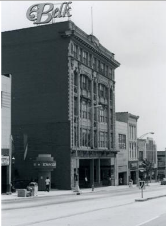
Belk Brothers Department Store (facade), Trade Street, Charlotte