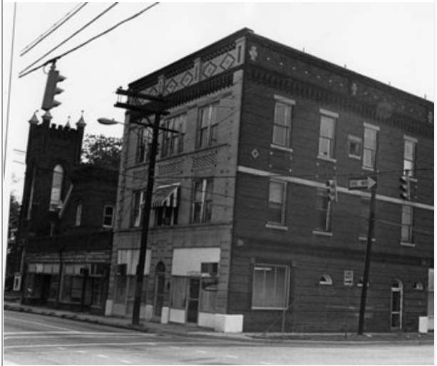
Mecklenburg Investment Co. Building, 233-237 South Brevard St., Charlotte