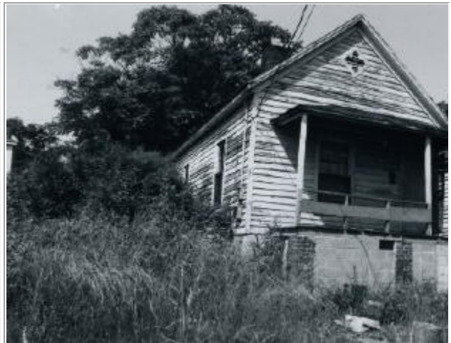
422 East 8th Street, Charlotte