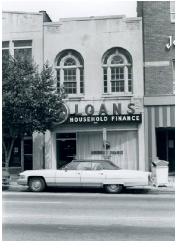
Household Finance, 235 North Tryon Street, Charlotte