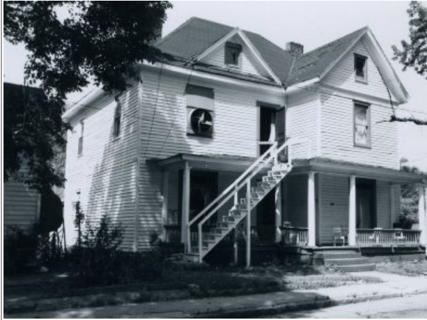
325 West 7th Street, Charlotte