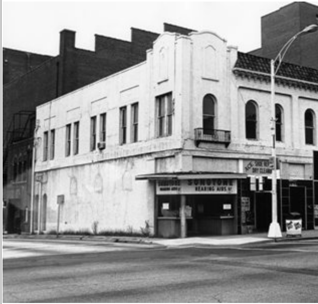
Old Carolina Theatre Building, 224-232 N. Tryon Street, Charlotte