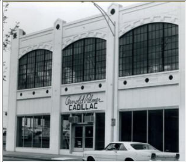
Arnold Palmer Cadillac, 710 South Tryon Street, Charlotte