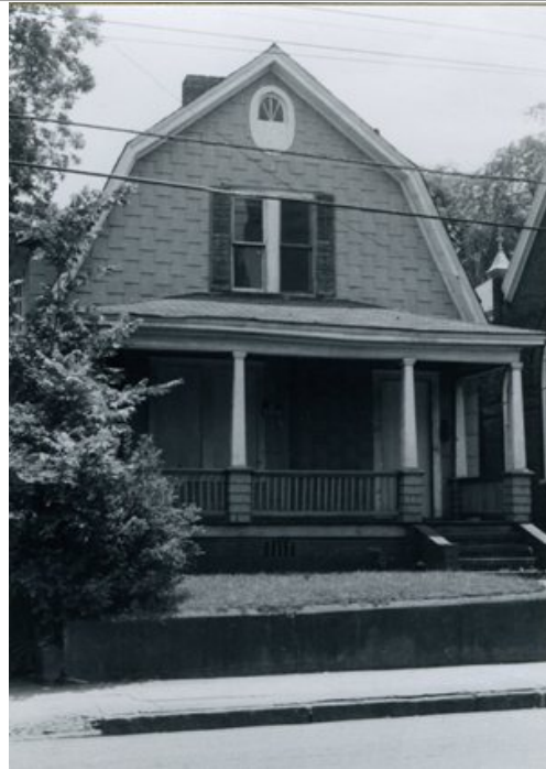
217 South Brevard Street, Charlotte