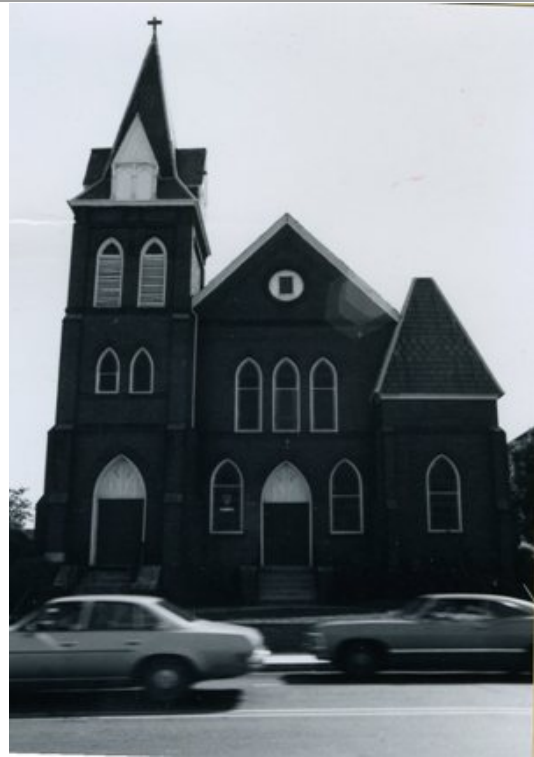
First United Presbyterian Church, 200 East 7th Street, Charlotte