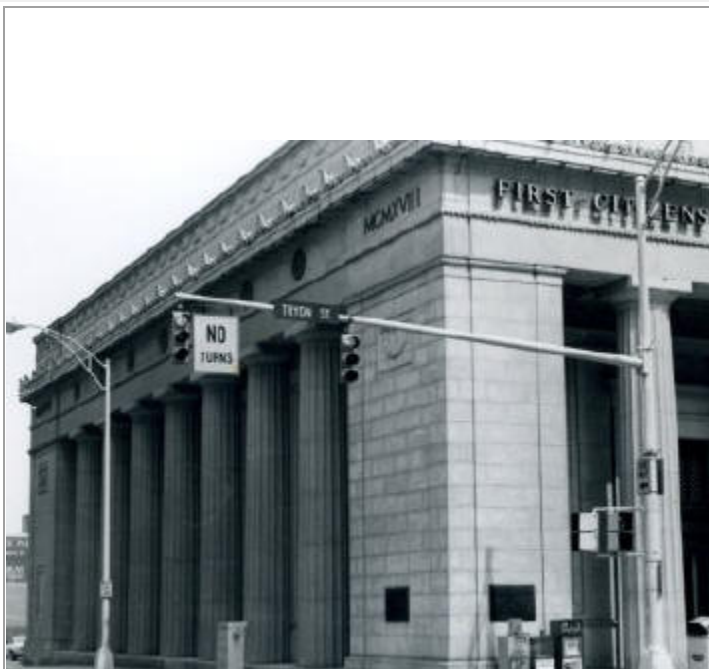
First National Bank, 128 South Tryon Street, Charlotte