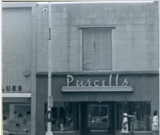
Purcell's, 206 North Tryon Street, Charlotte