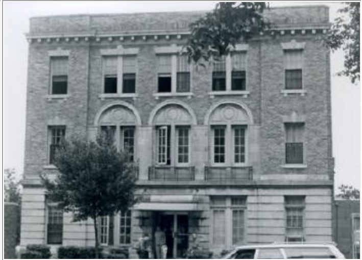
Guthery Apartments, 508 North Tryon Street, Charlotte