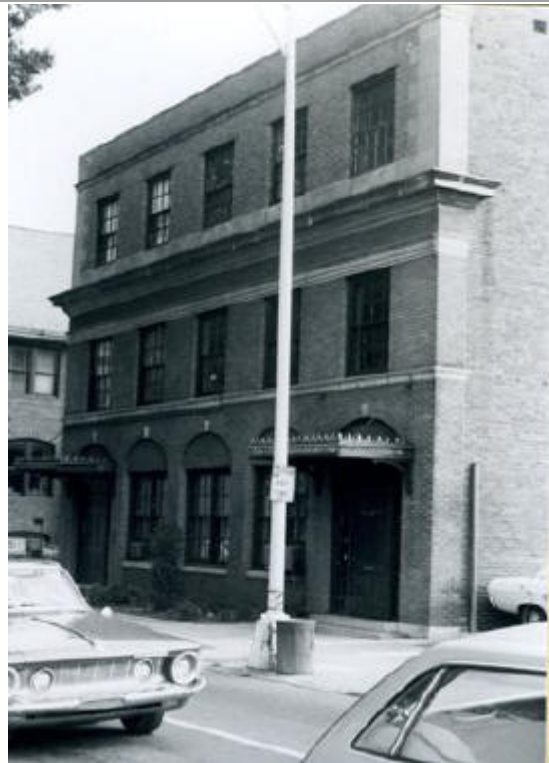
Allan Science Research Center, 123 West 7th Street, Charlotte