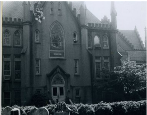
First Presbyterian Church, West Trade, Poplar, 5th, and Church Streets, Charlotte