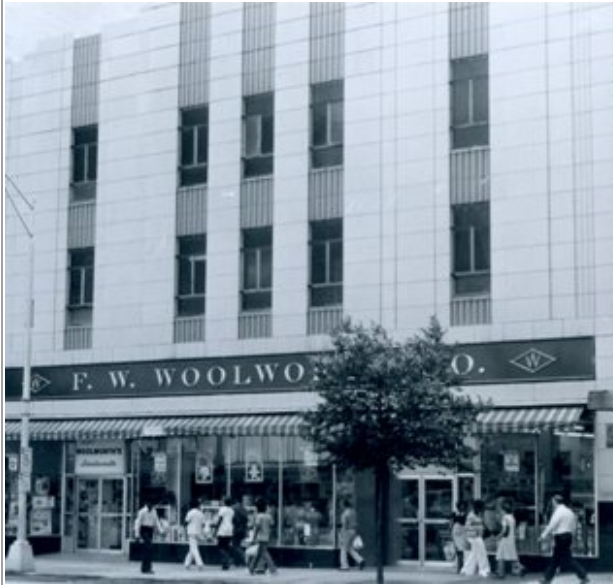
F.W. Woolworth Company, 112 North Tryon Street, Charlotte