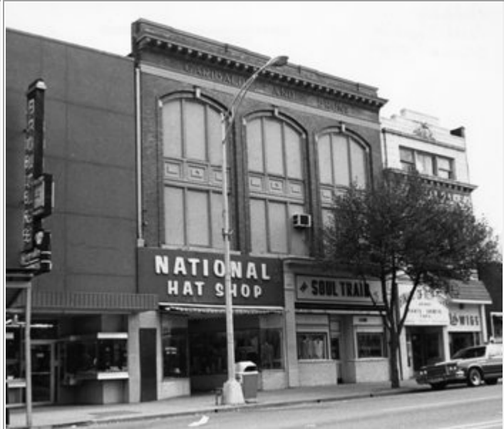
Garibaldi and Bruns, 104 South Tryon Street, Charlotte