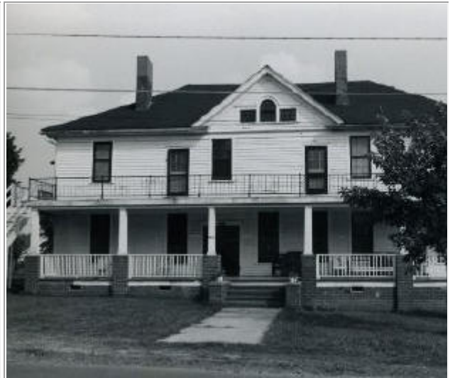
3020 Alexander Street, Charlotte