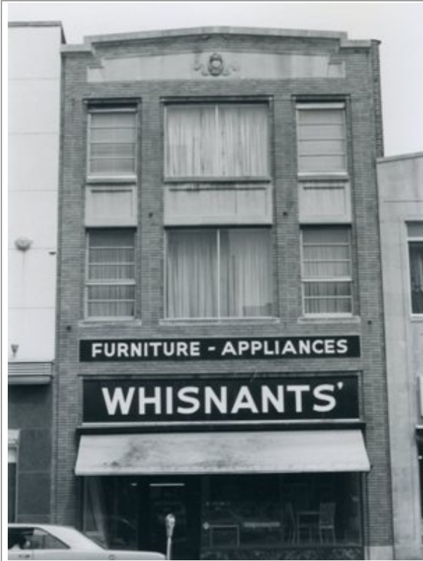
Whisnants' Furniture-Appliances, 231 North Tryon Street, Charlotte