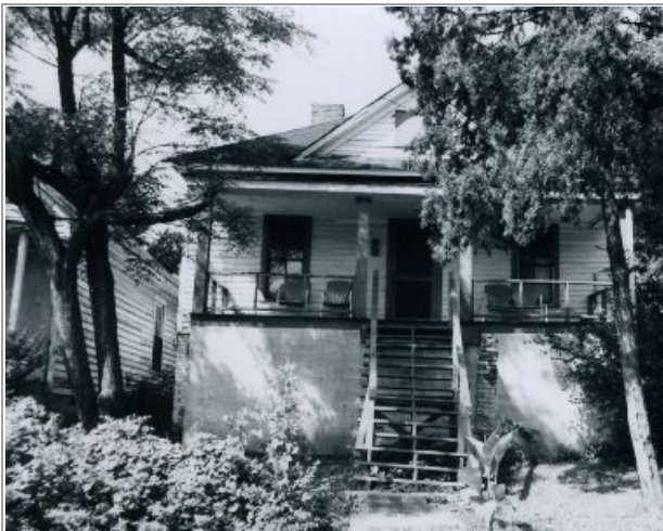
414 East 8th Street, Charlotte