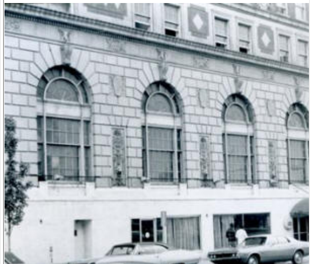
White House Inn, 237 West Trade Street, Charlotte