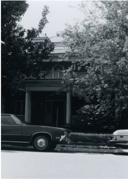
906 South College Street, Charlotte