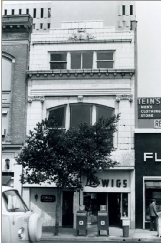
O'malleys Jewelers and Lee's Wigs, 102 South Tryon Street, Charlotte