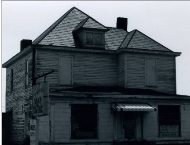
Shue's Auto Upholstery, 147 West Morehead, Charlotte