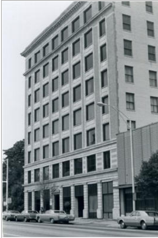
Professional Building, 406 North Tryon Street, Charlotte