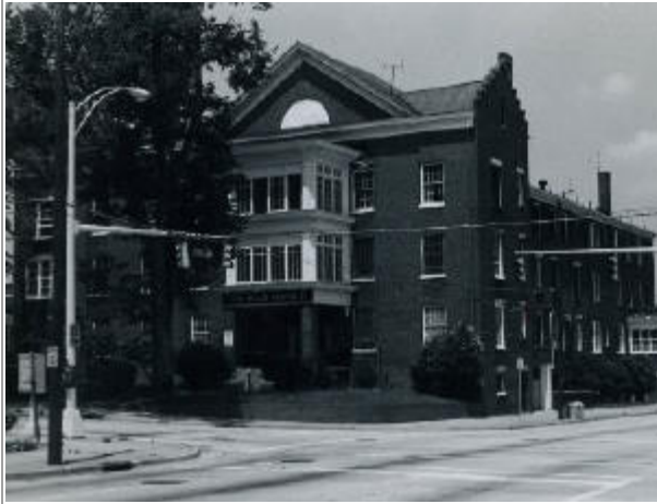
St. Peter's Hospital, 229 North Poplar Street, Charlotte