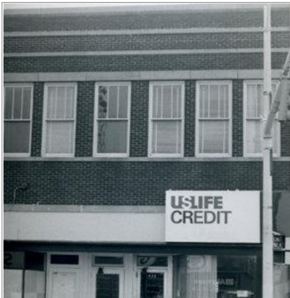
US Life Credit, 437-39, South Tryon Street, Charlotte