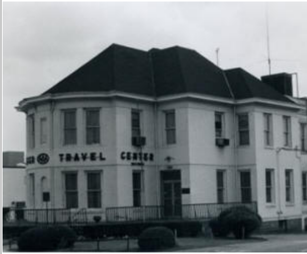
Carolina AAA Travel Center, 701 South Tryon Street, Charlotte