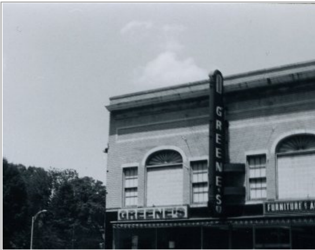
Greene's Furniture Company, 120 West Trade Street, Charlotte