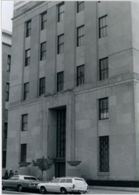
Federal Reserve, 401 South Tryon Street, Charlotte