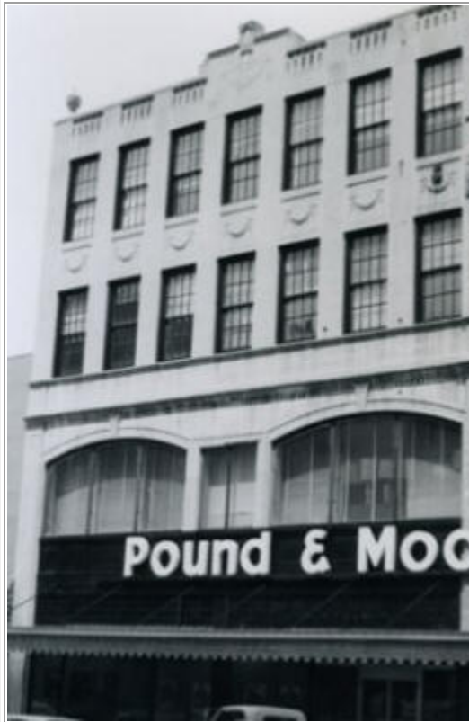
Pound and Moore, 304 South Tryon Street, Charlotte