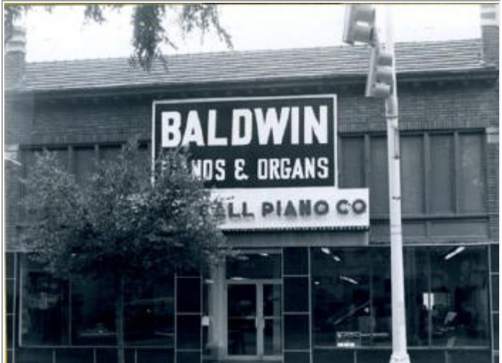
Jack Call Piano Company, 500 North Tryon Street, Charlotte