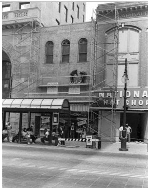
Thomas Trotter Building, 108 South Tryon Street