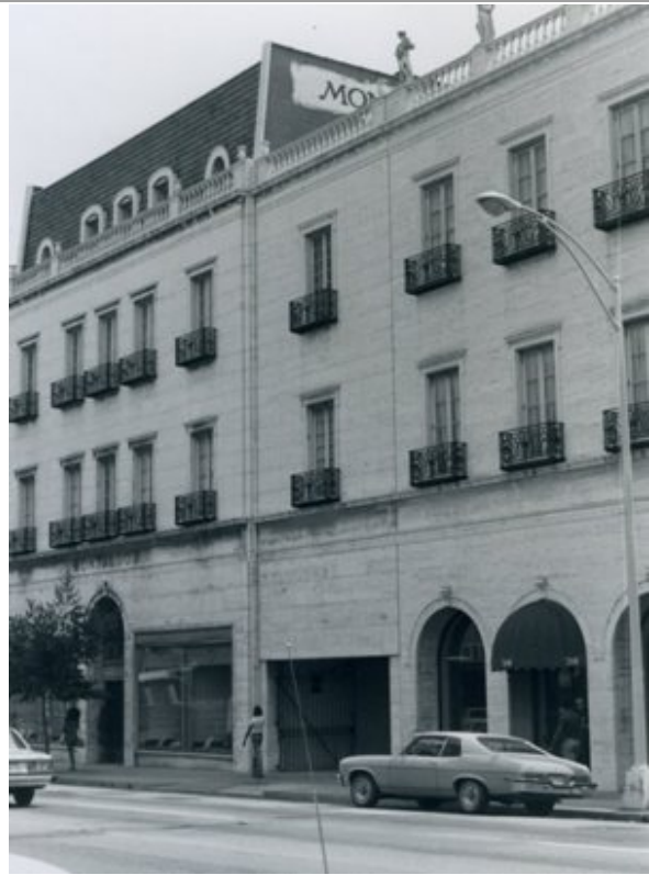
Montaldos, 220 North Tryon Street, Charlotte