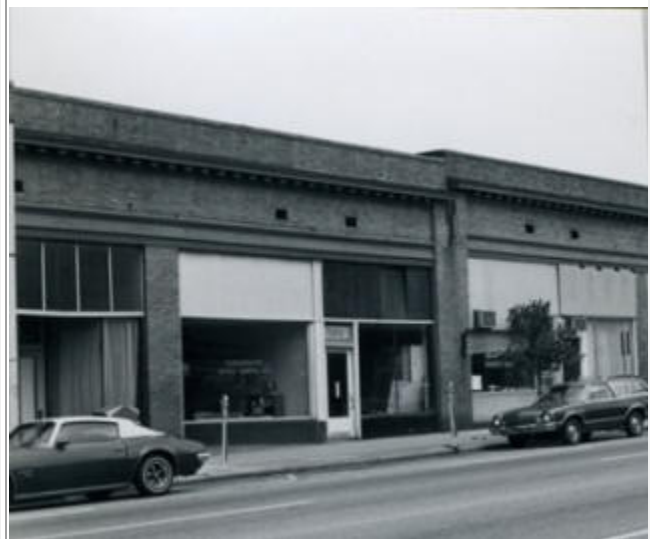
D 'n P Restaurant; Funderburk Office Supply; Barber, 510 South Tryon Street, Charlotte