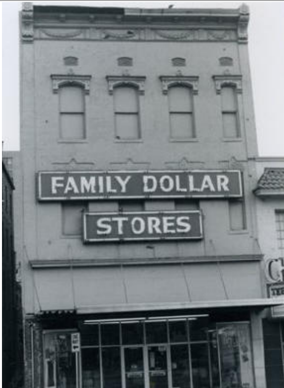
Family Dollar Store, 121 West Trade Street, Charlotte