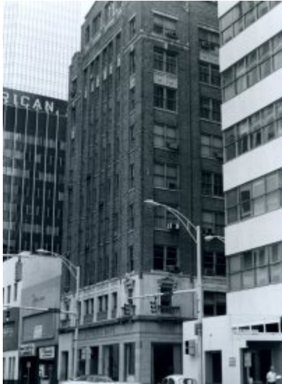
City National Bank, 239 South Tryon Street, Charlotte