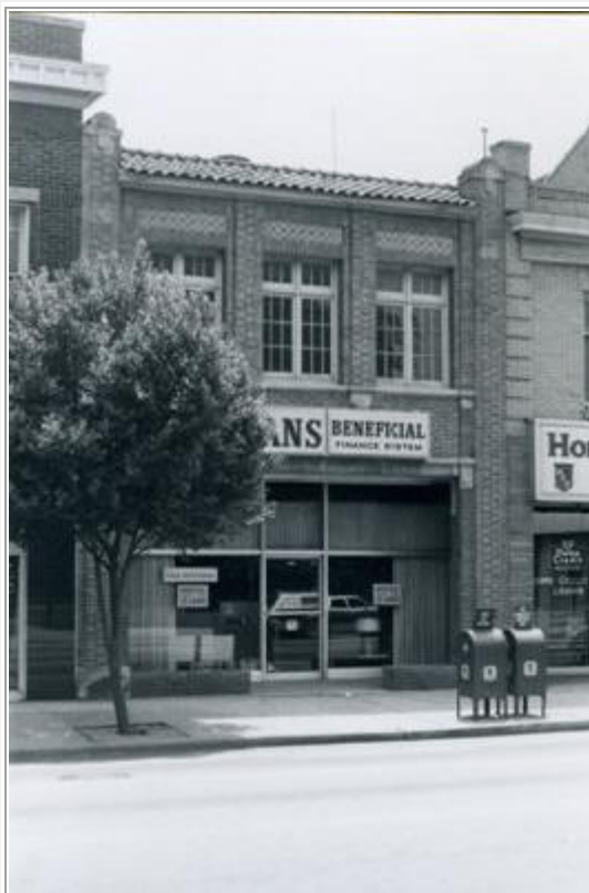
Beneficial Loans, 328 North Tryon Street, Charlotte