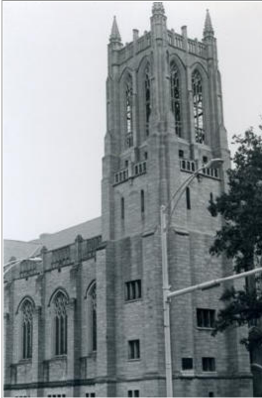
First Methodist Church, 501 North Tryon Street, Charlotte