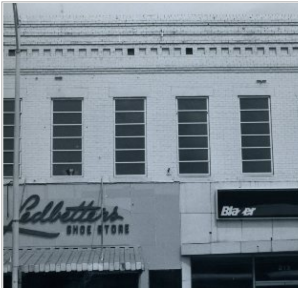
Ledbetter's Shoe Store & Blazer Financial Services, 211-13 North Tryon Street, Charlotte