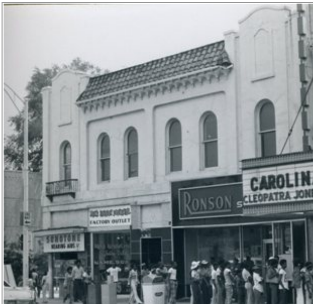
Carolina Theatre, 226-36 North Tryon Street, Charlotte