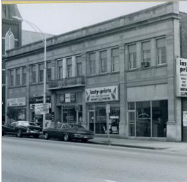
Family Finance; Queen City T.V.; Insty-Prints; Charlotte Office Supply, 509-11 South Tryon Street, Charlotte