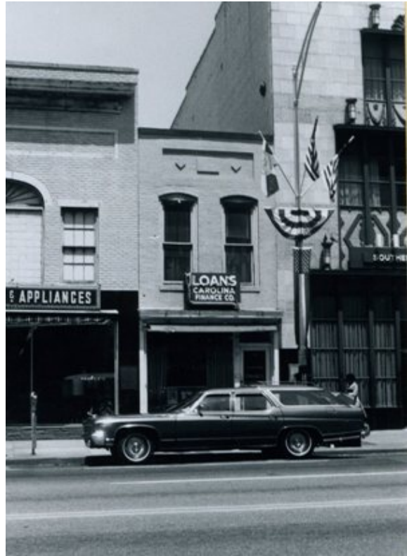
118 West Trade Street, Charlotte