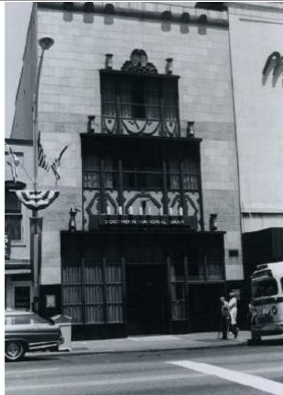
S&W Cafeteria, 116 West Trade Street, Charlotte