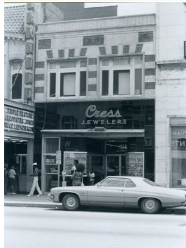
Cress Jewelers, 224 North Tryon Street, Charlotte