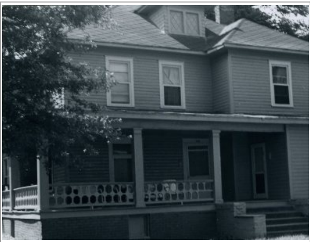
237 South Cedar Street, Charlotte