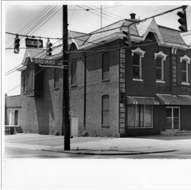
William Treloar House, 328 N. Brevard Street