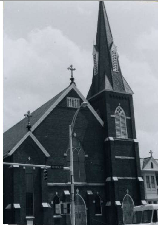
Saint Peter's Catholic Church, 501 South Tryon Street, Charlotte