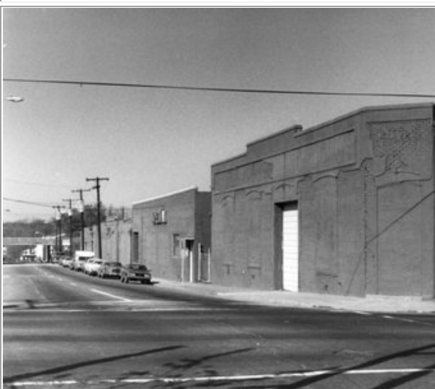
Old Cotton Mills, 508 West Fifth Street, Charlotte