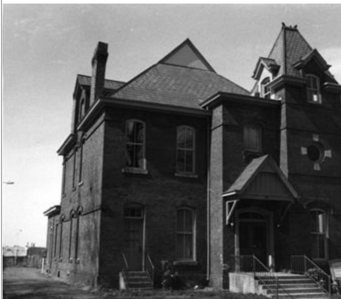
Bagley-Mullen House, 129 North Poplar Street, Charlotte