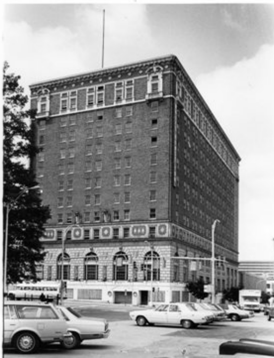
Hotel Charlotte, 231 W. Trade Street, Charlotte