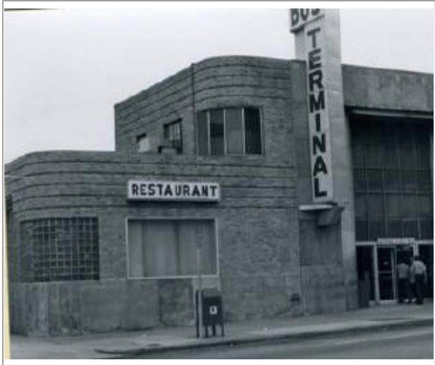
Bus Terminal, 418 West Trade Street, Charlotte