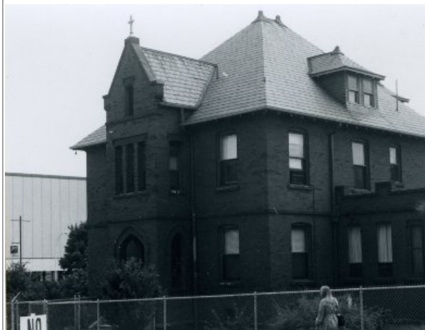
116 East First Street, Charlotte