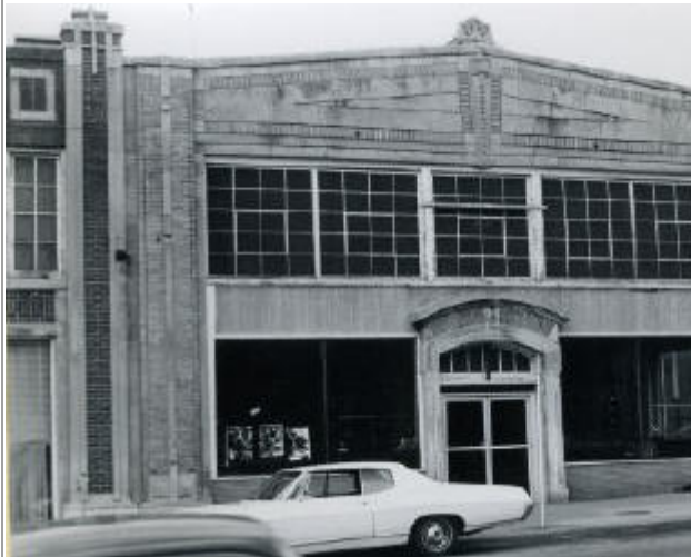
West Trade Street, Charlotte