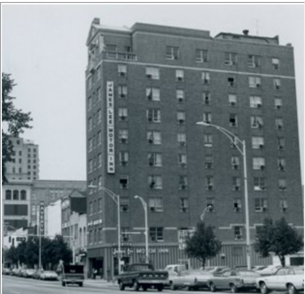
James Lee Motor Inn (Mayfair Manor), 227 North Tryon Street, Charlotte