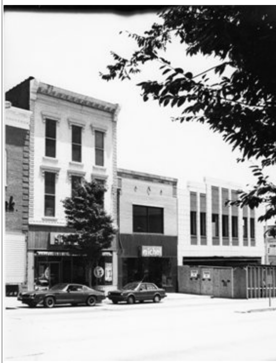
Merchants & Farmers National Bank Building, 123 E. Trade Street