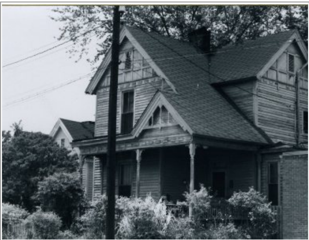
225 North Caldwell Street, Charlotte