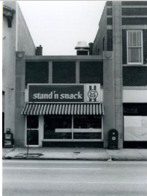
Stand 'n Snack, 433 South Tryon Street, Charlotte