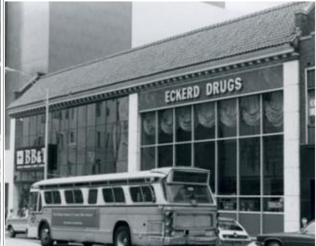
Eckerd Drugs; Branch Banking & Trust Company, 324 South Tryon Street, Charlotte