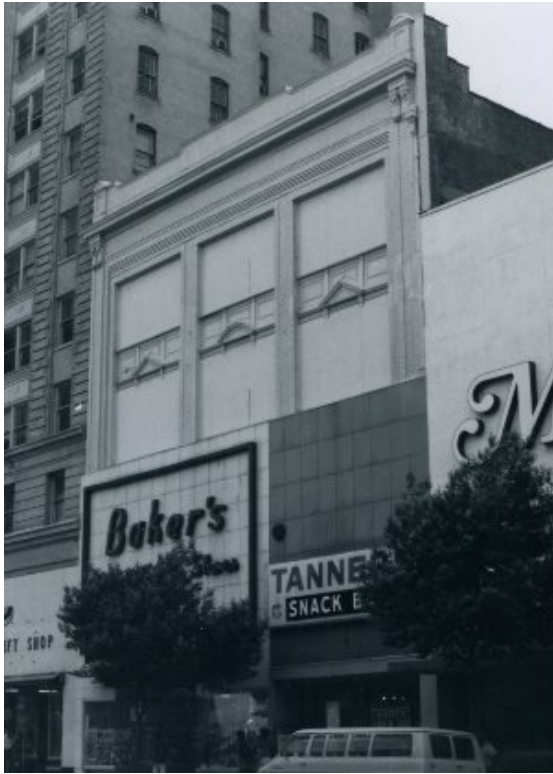
Tanner Cafe and Baker's, 109 North Tryon Street, Charlotte