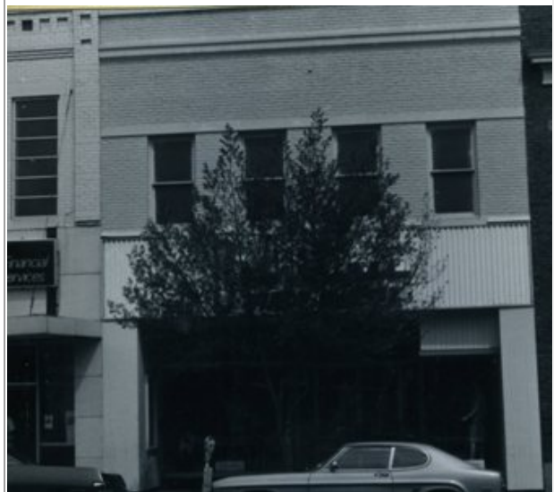
Catherine's Stout Shop, 215 North Tryon Street, Charlotte