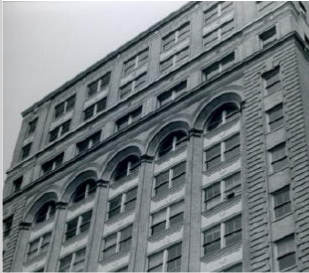
Independence Building, corner of Tryon & Trade Streets, Charlotte