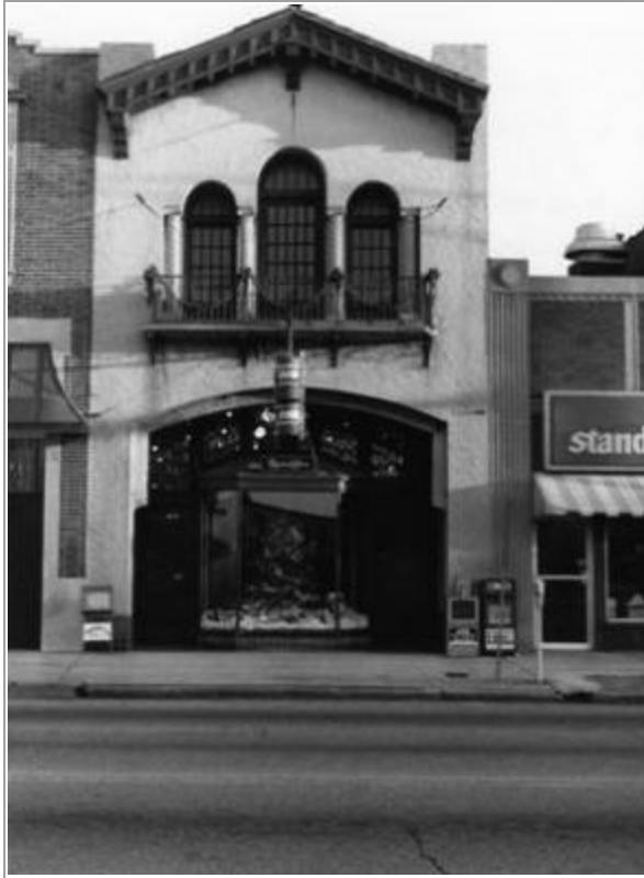
Ratcliffe Florist Shop, 431 South Tryon Street, Charlotte