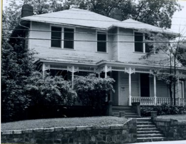
J. T. Williams House, 215 S. Brevard St.