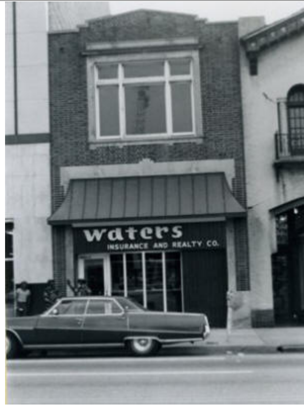
Waters Insurance and Realty, 429 South Tryon Street, Charlotte