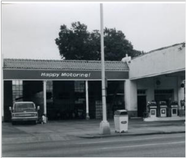
Exxon Gasoline Station, 800 West Trade Street, Charlotte