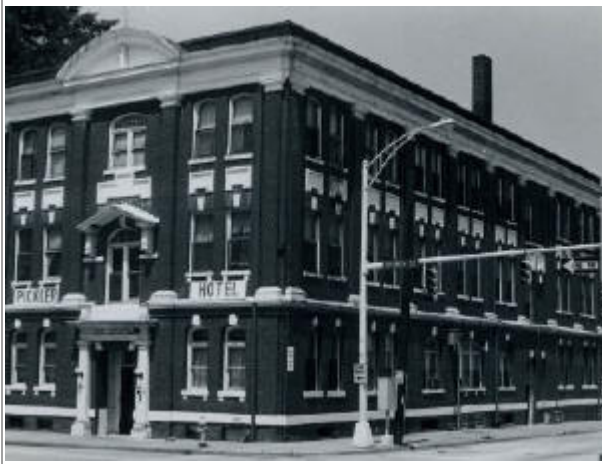
North Carolina Medical College, 229 North Church Street