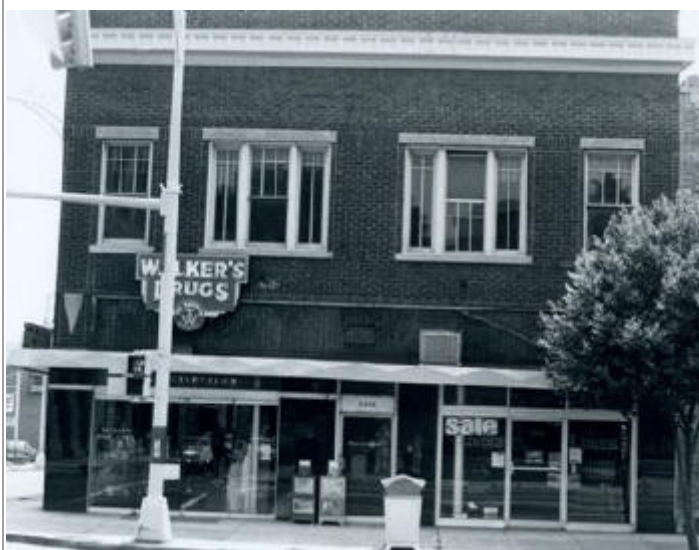
Walkers Drugs and Fine Shoe Liners of Charlotte, 330 North Tryon Street, Charlotte