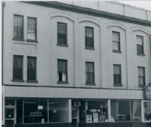
Stonewall Hotel, 525 West Trade Street, Charlotte