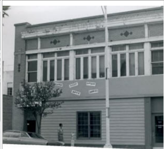
Why-Not Lounge; EFC Screening Room, 523 South Tryon Street, Charlotte