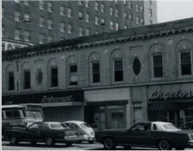
Angelo's Restaurant, 301-309 West Trade Street, Charlotte