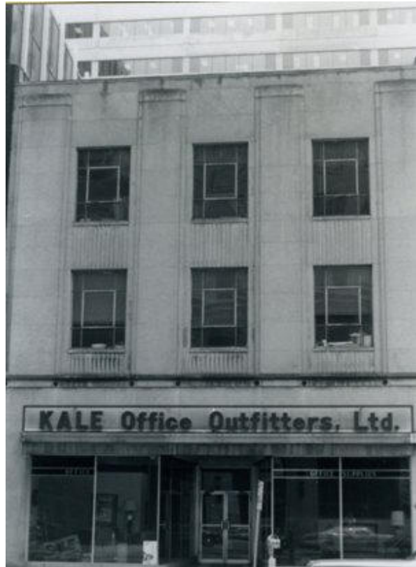
Kale Office Outfitters, Ltd., 217 South Tryon Street, Charlotte