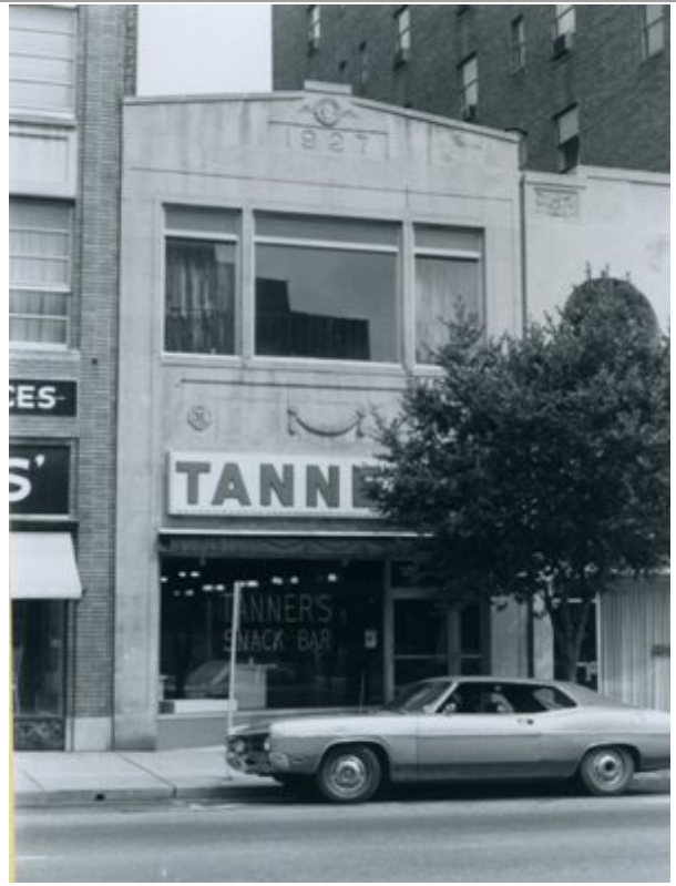
Tanners Snack Bar, 233 North Tryon Street, Charlotte