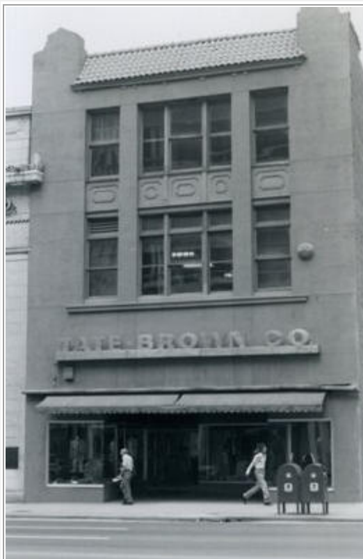
Tate Brown Company, 126 South Tryon Street, Charlotte