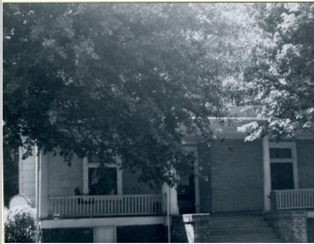
245 South Cedar Street, Charlotte