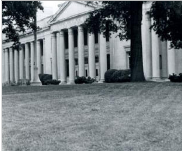
U.S. Post Office and Court House, 301 West Trade Street