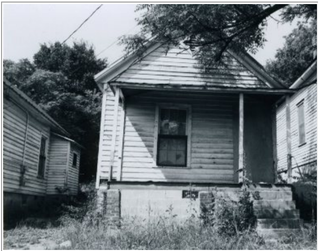
418 East 8th Street, Charlotte