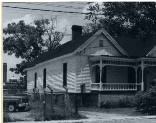
221 North Caldwell Street, Charlotte