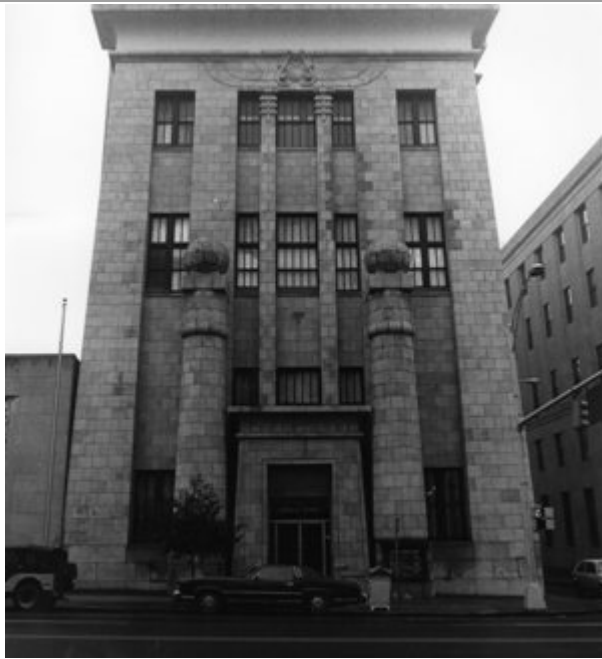
Masonic Temple, 329 S. Tryon Street