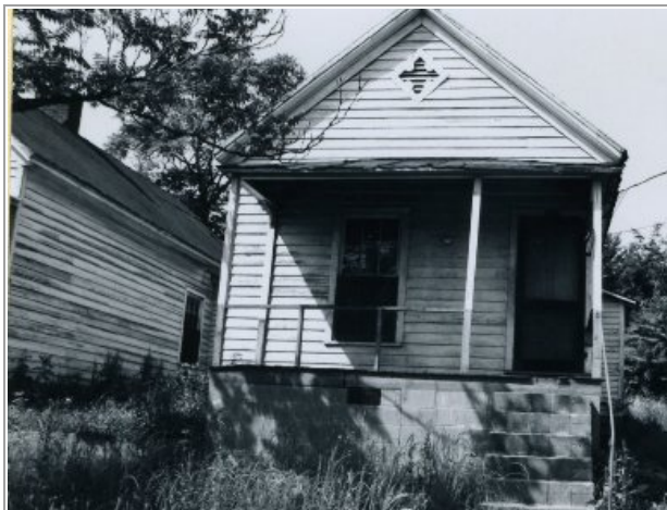
420 East 8th Street, Charlotte