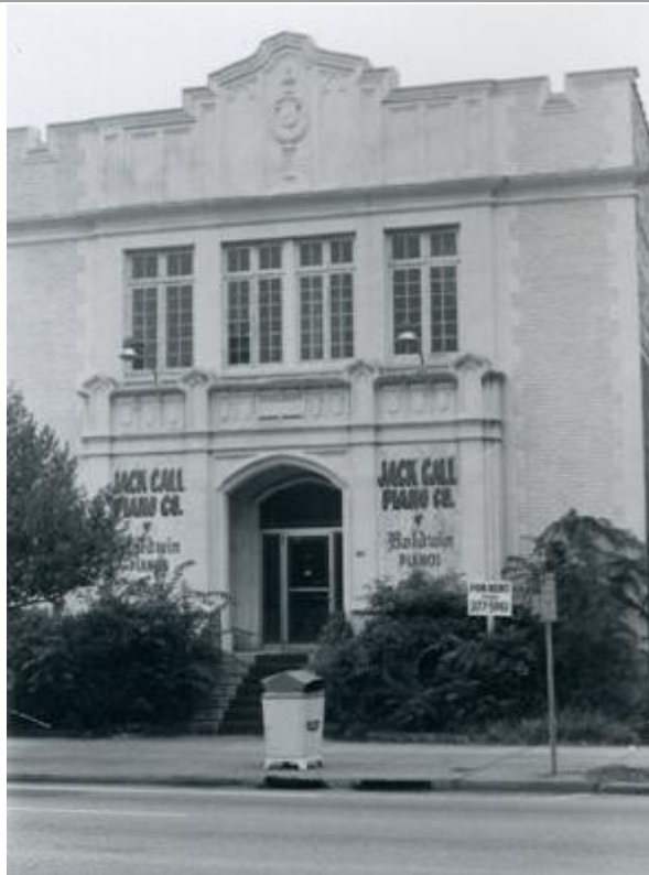
Hovis Funeral Home, North Tryon Street, Charlotte