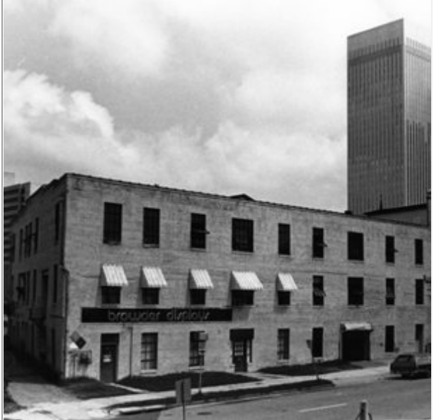
Query, Spivey, McGee Building, Corner of College & Stonewall Streets, Charlotte