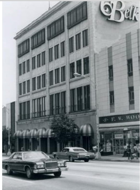
Belk's, North Tryon Street, Charlotte