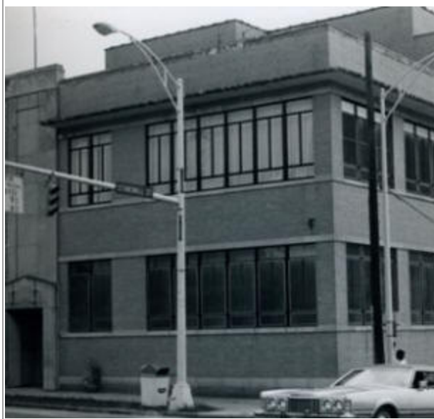
Charlotte Liberty Mutual Insurance Co., 531 South Tryon Street, Charlotte