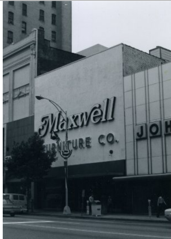
Maxwell Furniture, 113 North Tryon Street, Charlotte