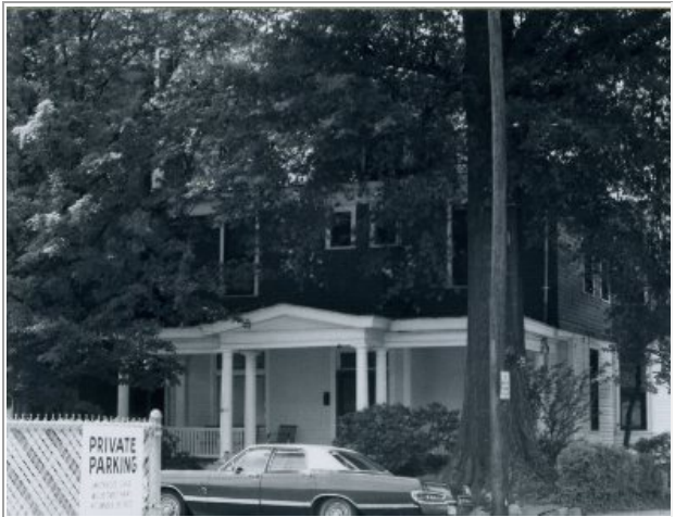
415 North Church Street, Charlotte