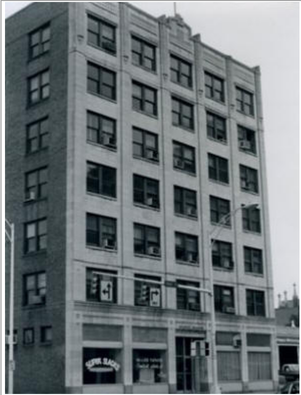
Builders Building, 314 West Trade Street, Charlotte