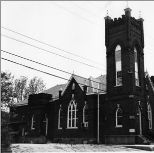
Grace AME Zion Church, 219-223 S. Brevard Street, Charlotte