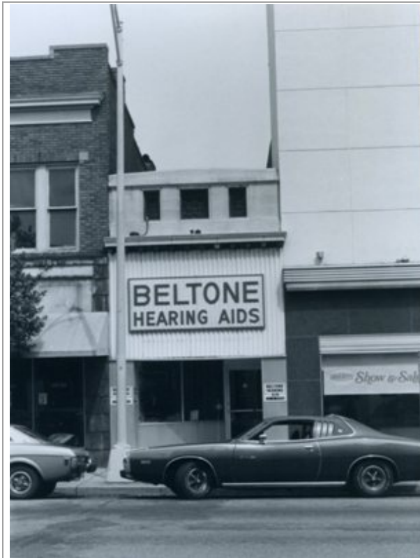
Beltone Hearing Aids, 221 North Tryon Street, Charlotte