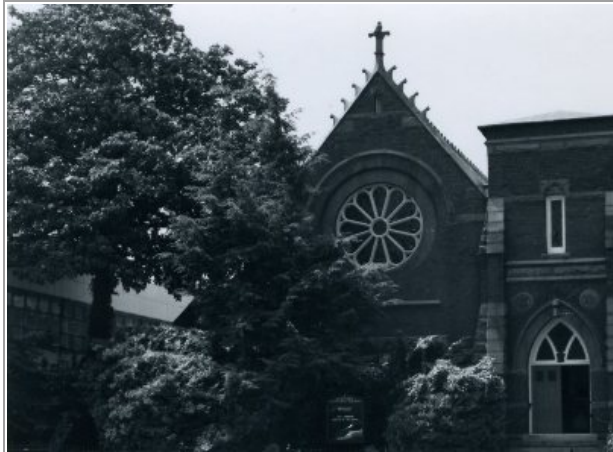
Saint Peter's Episcopal Church, 335 North Tryon Street, Charlotte