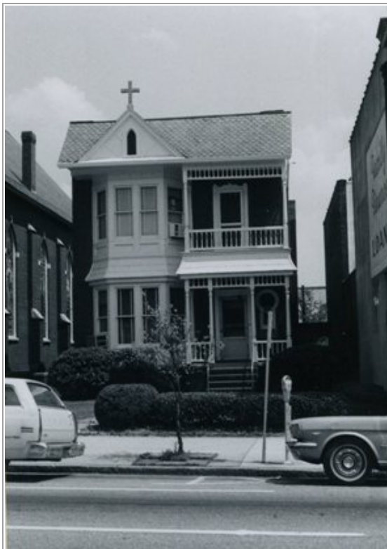
Saint Peter's Rectory, 507 South Tryon Street, Charlotte