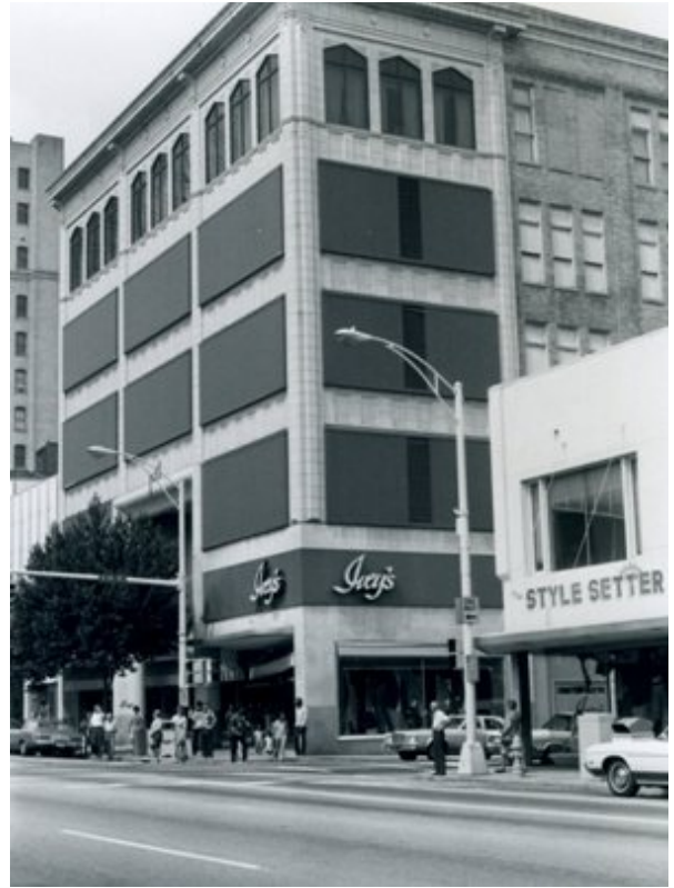
Ivey's Department Store, 127 North Tryon Street, Charlotte