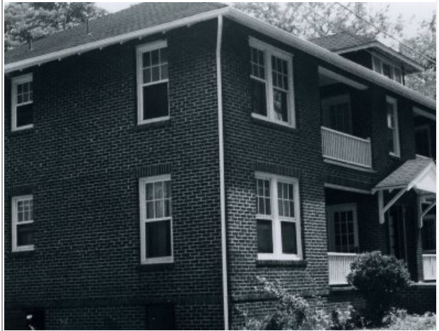
1021 South College Street, Charlotte