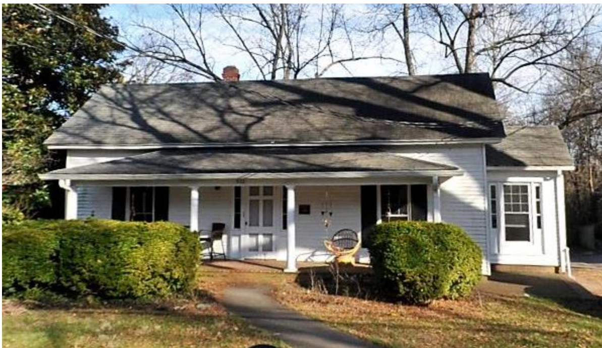
Figure 1 The Isaac Johnston House, just down the street from the Helper-Walley House at 532 North Main Street, is the oldest extant (and only other known) hall-and-parlor house in Davidson.

Pre-1900s houses in Davidson fall under two categories—either they have remained relatively unchanged from their original style of construction, or the houses have been so altered from their original state that they no longer retain architectural integrity. The antebellum Isaac Johnston House, as seen above, appears from the street much like it did a century ago. The same may be said for the ca. 1898 Currie-Adams House, an I-house at 525 North Main Street. In comparison, the ca. 1890 Cranford-Kneedler House next door to the Helper-Walley House at 609 North Main Street was bricked with a new full-height front porch added to the original frame house ca. 1950.