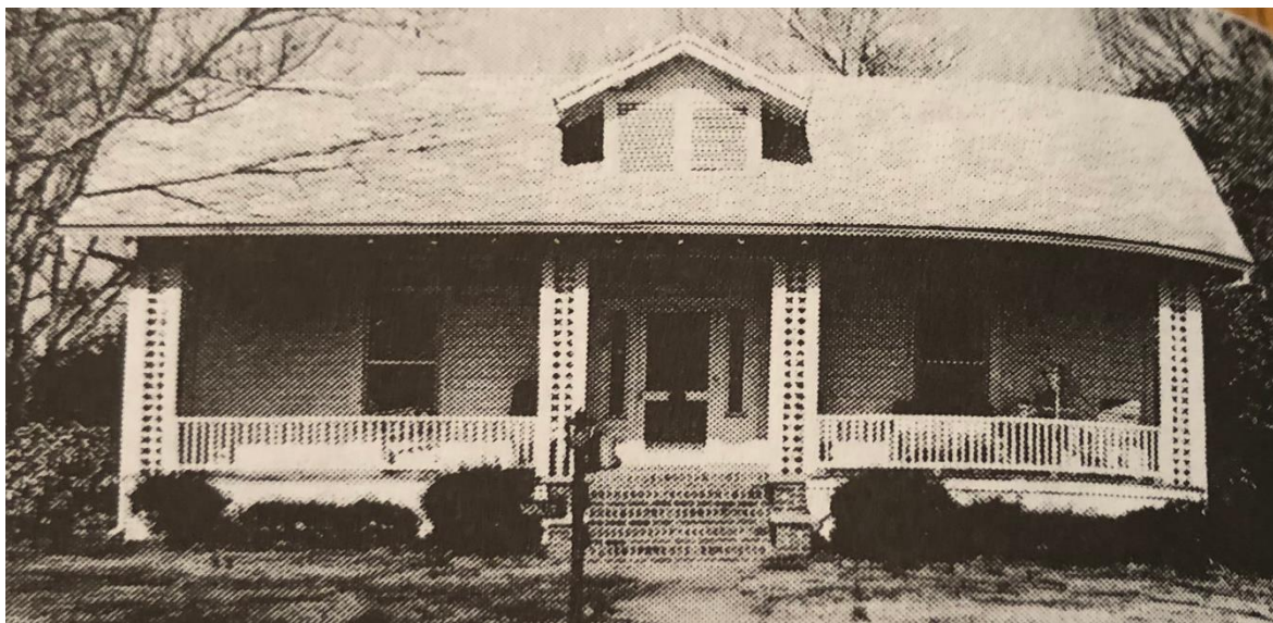
Figure 5 The Helper-Walley House as it appeared around 1979. Beaty, 94.

The Parkers remodeled the house and expanded it to the current layout during their ownership, adding the to back two rooms, enclosing the back porch into a kitchen, and building a utility/laundry room and new back porch. In the back bedroom, office, rear vestibule, and kitchen, Charlie used wood flooring that was taken from Johnston Gymnasium at the college. 9