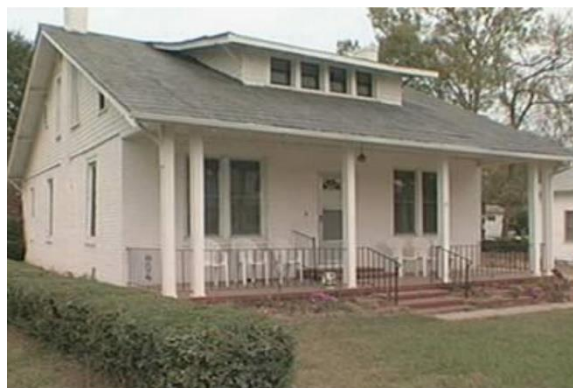
Figure 3 The Ralph Johnson House as it appeared in 2006. Today, the Craftsman-style duplex appears even more like the Helper-Walley House, as the middle columns are now paired, and the railing is wood rather than wrought iron. 4