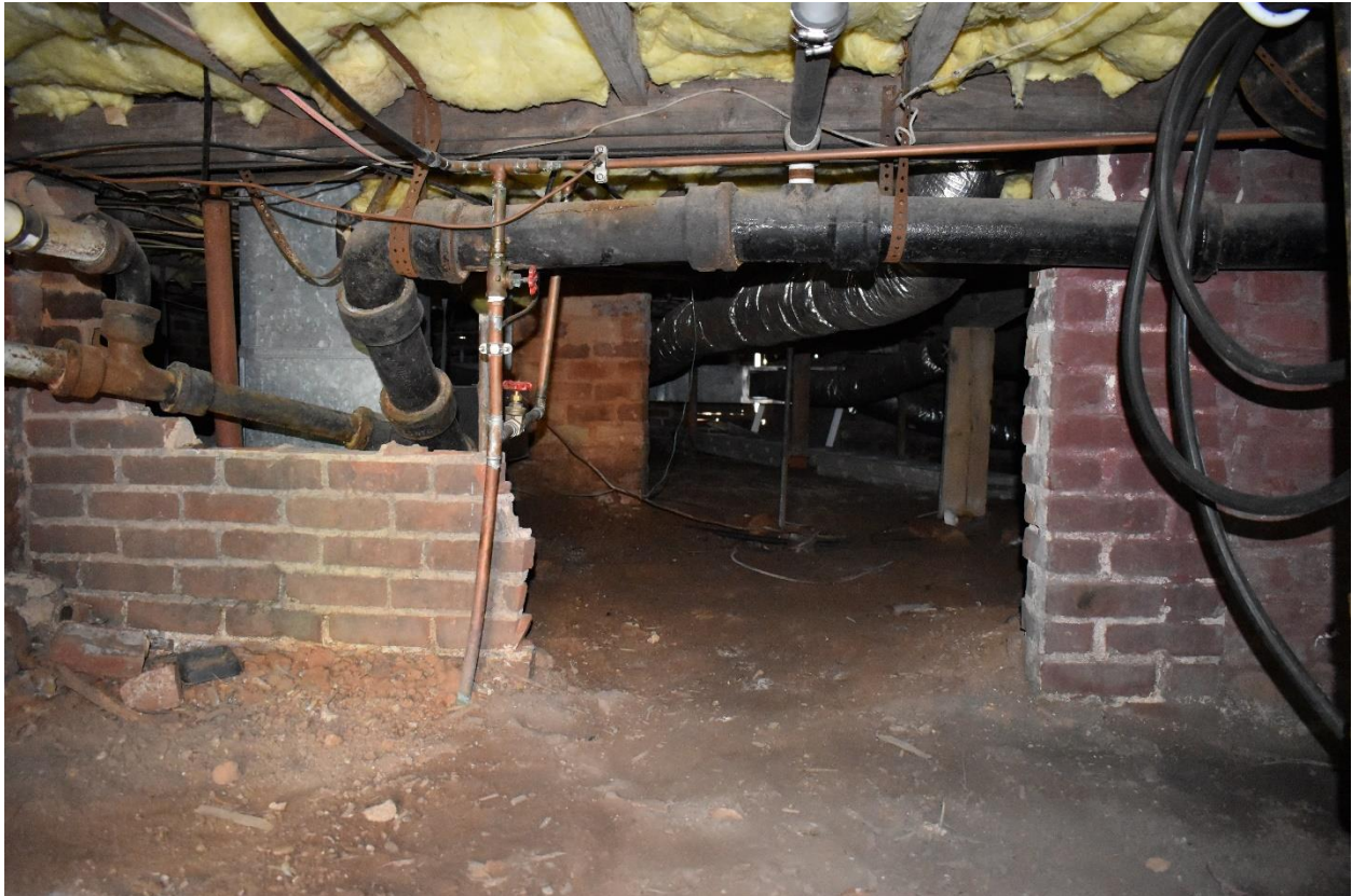
Figure 6 Under the Helper-Walley House, the various phases of construction are visible. In the background, you can see the foundation of a chimney that was formerly in the current dining room. In the foreground are the brick piers and remaining walls from the ca. 1925 addition.

enclosed and expanded the porch into a kitchen and utility/laundry room, and added a new back porch. Throughout these changes, the Helper-Walley House retained the integrity of its original hall-and-parlor portion while adding the charm of Craftsman style. The ca. 1950 addition reflects both the existing aesthetics of the house and the utilitarian needs of the owners.