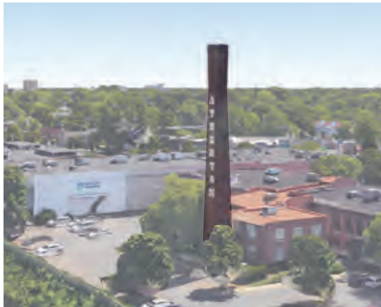
1 Elevation Scale NTS