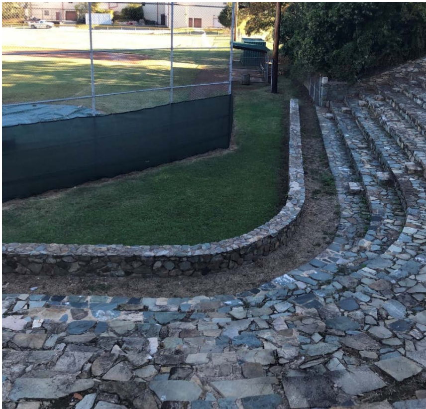
LOW WALL AT THE BASE OF THE GRANDSTAND

Justification: Provide space for accessible seating. In renovating the park all the paths and program elements will be accessible. The modifications to the low wall will provide accessible seating connected to the sidewalk system.