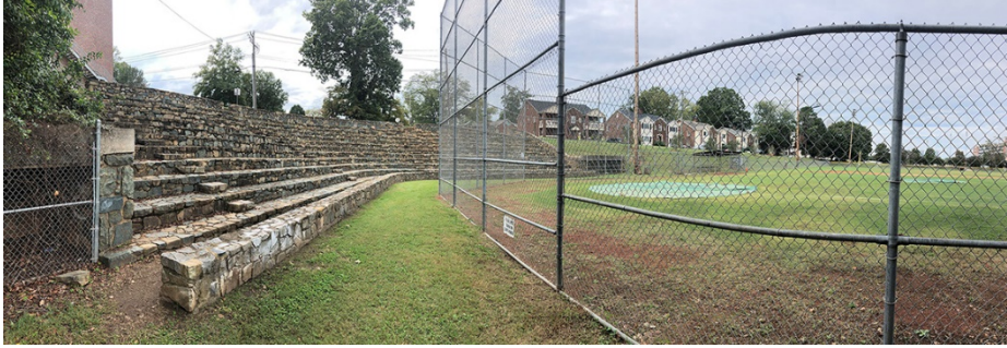
LOW WALL AT THE BASE OF THE GRANDSTAND