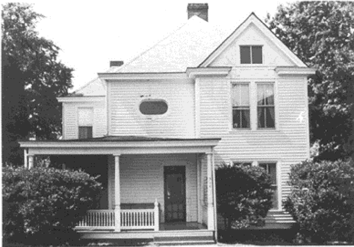
The Martin-Worth-Henderson House in the 1930's