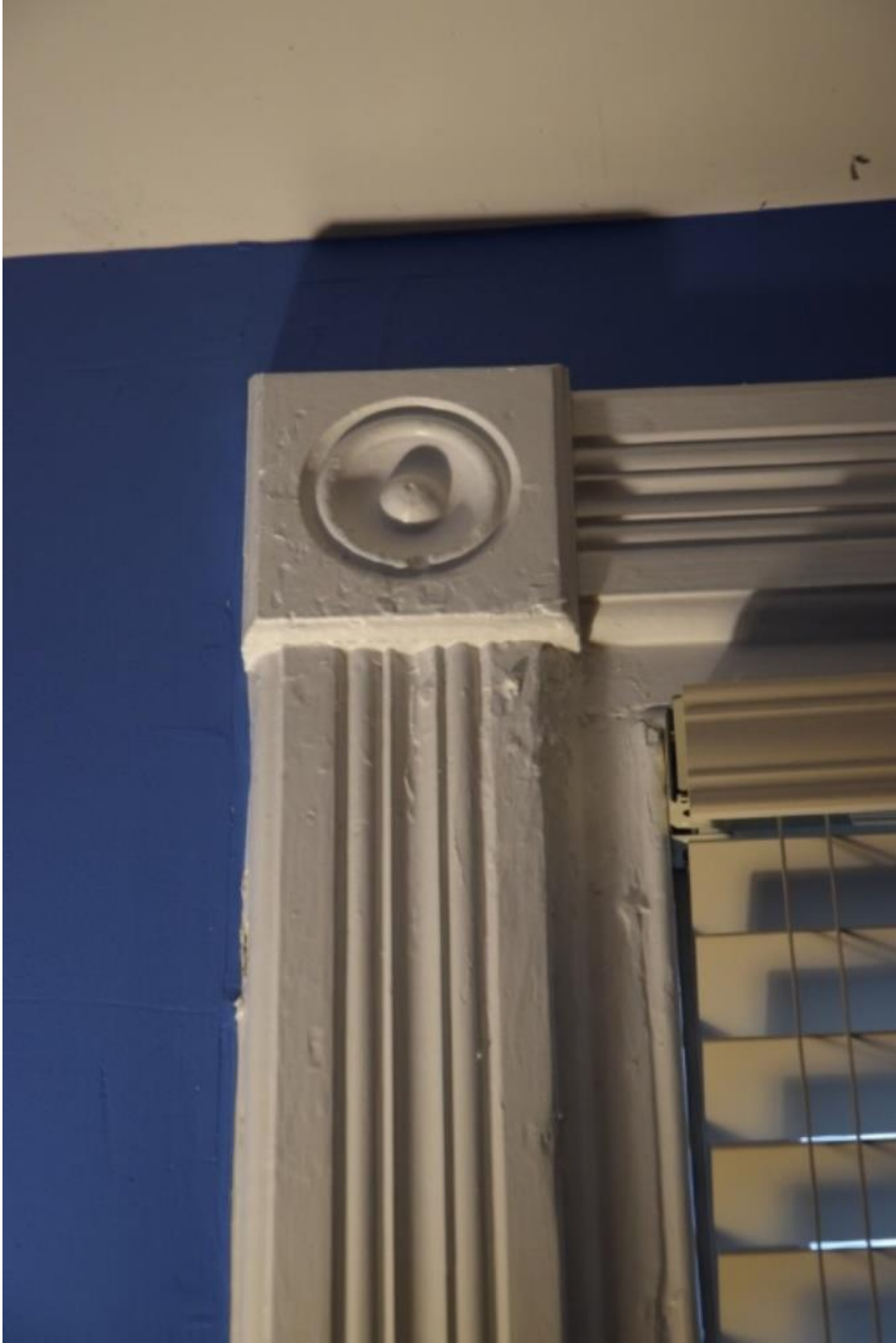
Typical Trim Detail