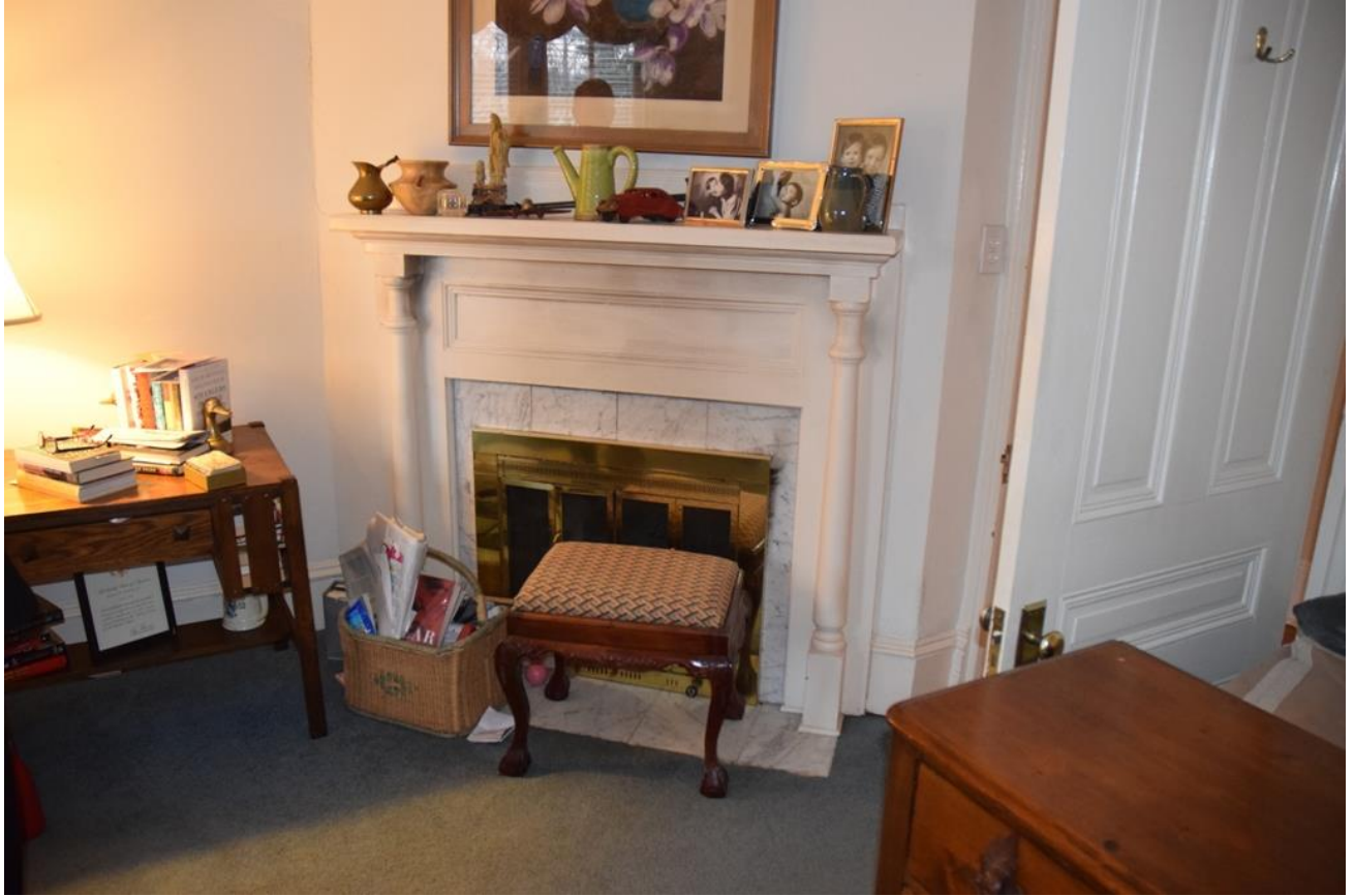
Second Story Rear Bedroom – West