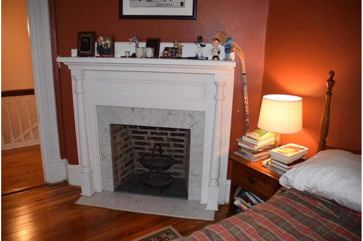
Second Story Front Bedroom