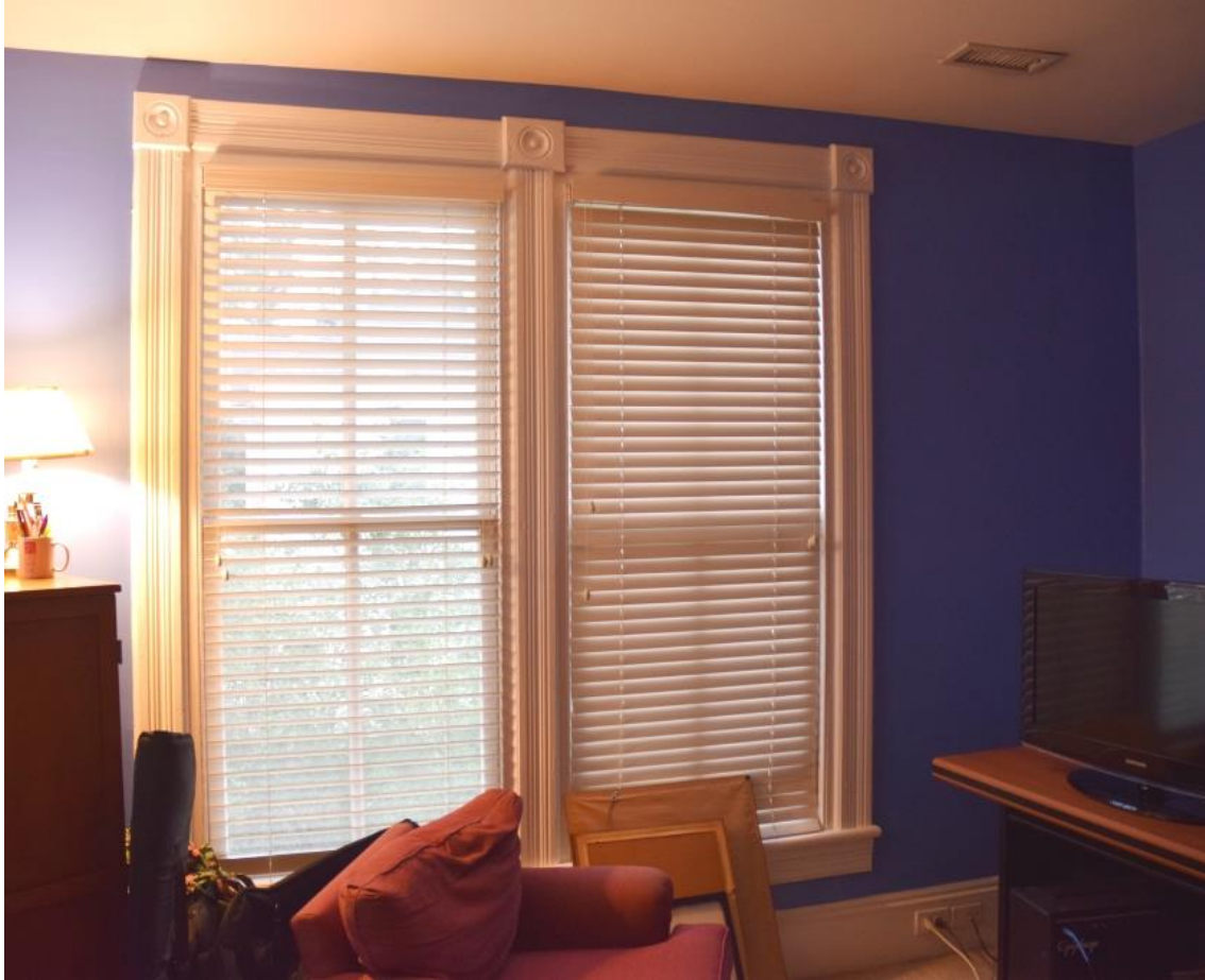
Second Story Rear Bedroom – East