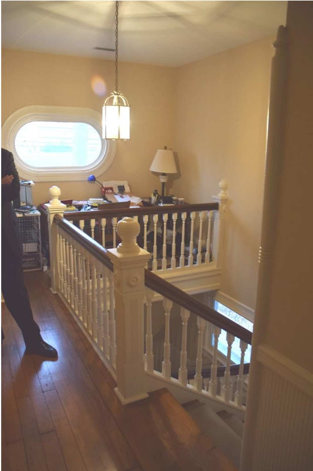
Second Story Hall