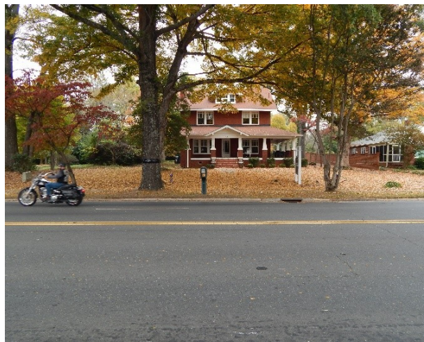
Renfrow Lemmond House (c. 1924)