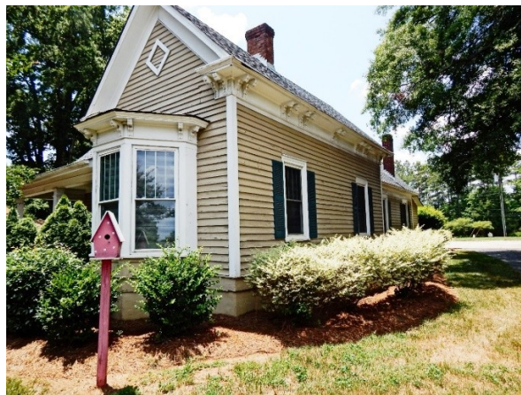
Folk Victorian style Hooks-McLaughlin House (c. 1890)