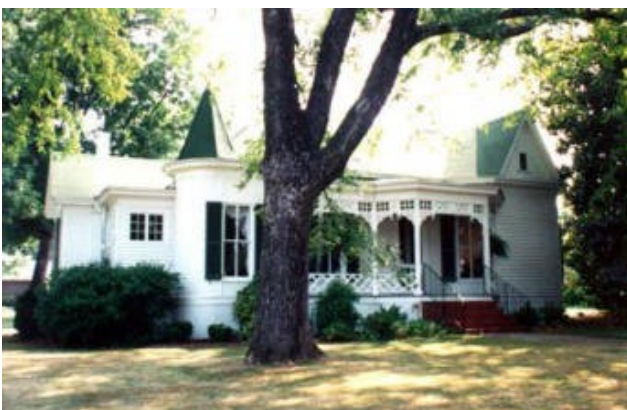
Queen Anne style Nancy Reid House (1890)