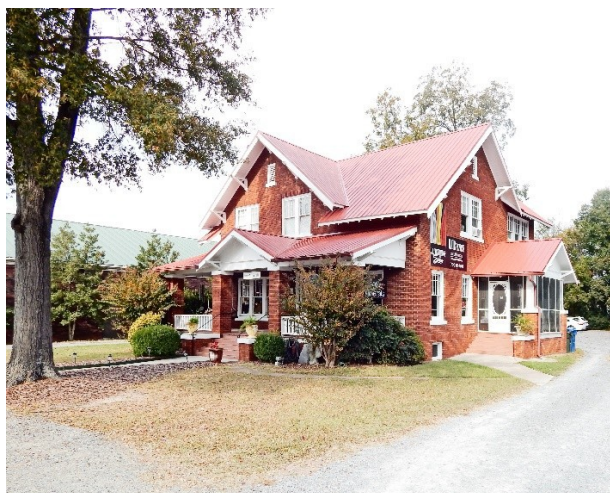
Barnum A. Sustare House (1919)

The majority of the homes erected in Matthews in the first two decades of the twentieth century were Craftsman style dwellings. Most were built in the 1920s. They include such notable structures as the Barnum A. Sustare House (1919), the Renfrow Lemmond House (c. 1924), the “Pete” Phillips House (1925), and the William and Nell Freeman House (1927).