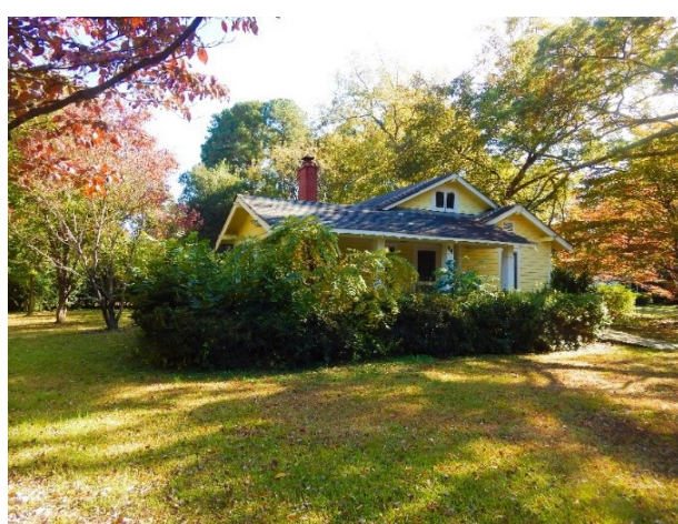
Freeman House (1927)