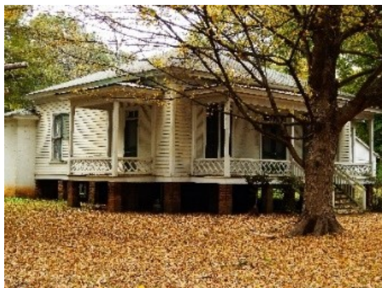
Folk Victorian style McLaughlin-Bost House (c. 1891)