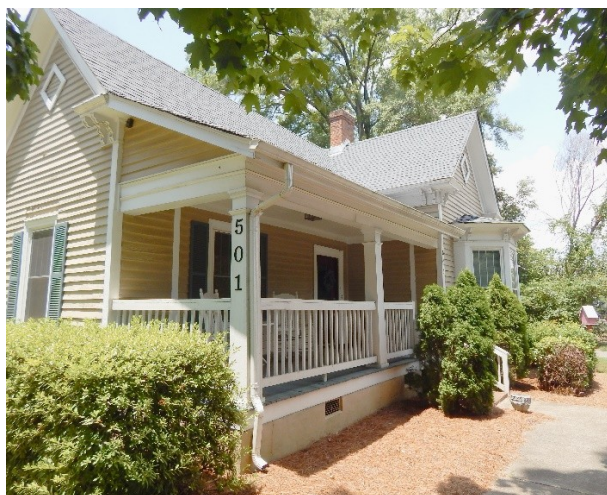
House from the Northeast