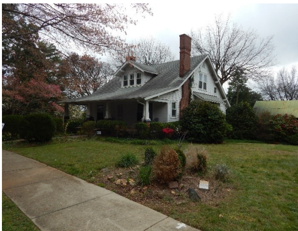
Phillips House (1925)