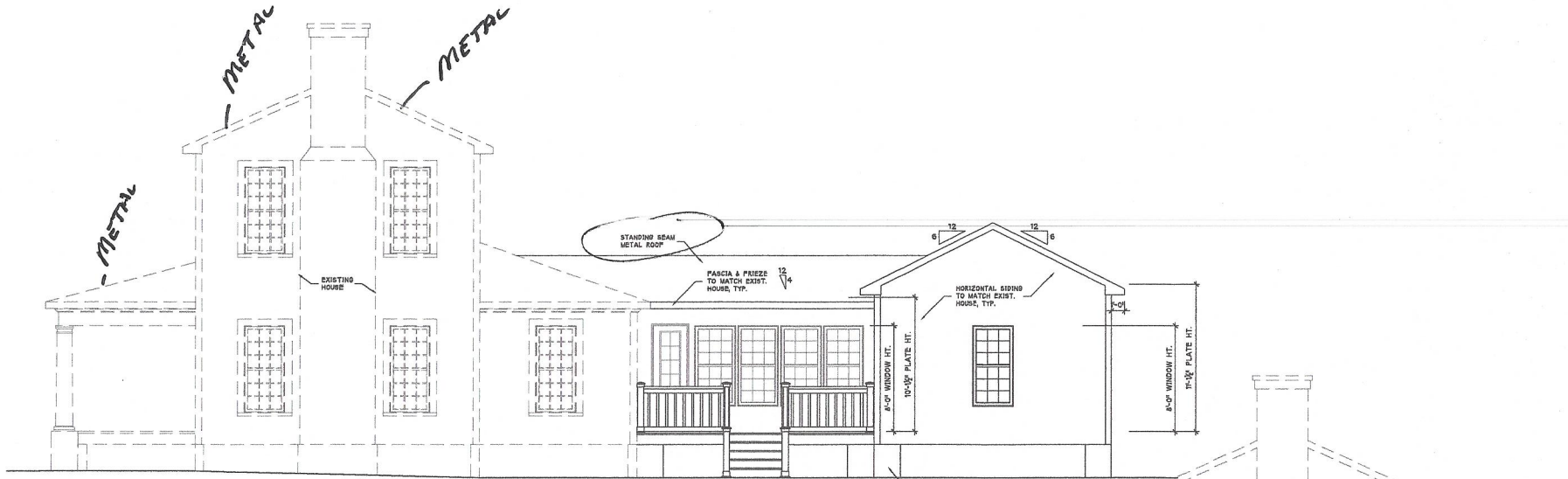
1 RIGHT SIDE ELEVATION 6.0 SCALE: 1/8"=1'-0" (11X17" SHEET SIZE) SCALE: 1/4"=1'-0" (14X36" SHEET SIZE)