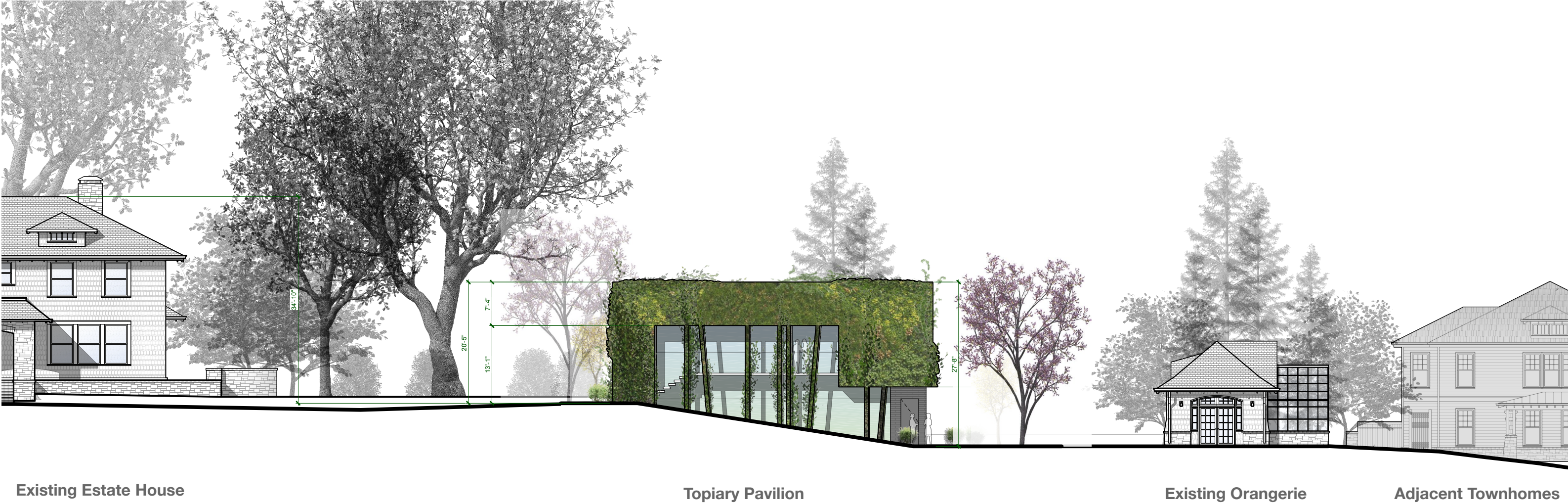
Existing Estate House