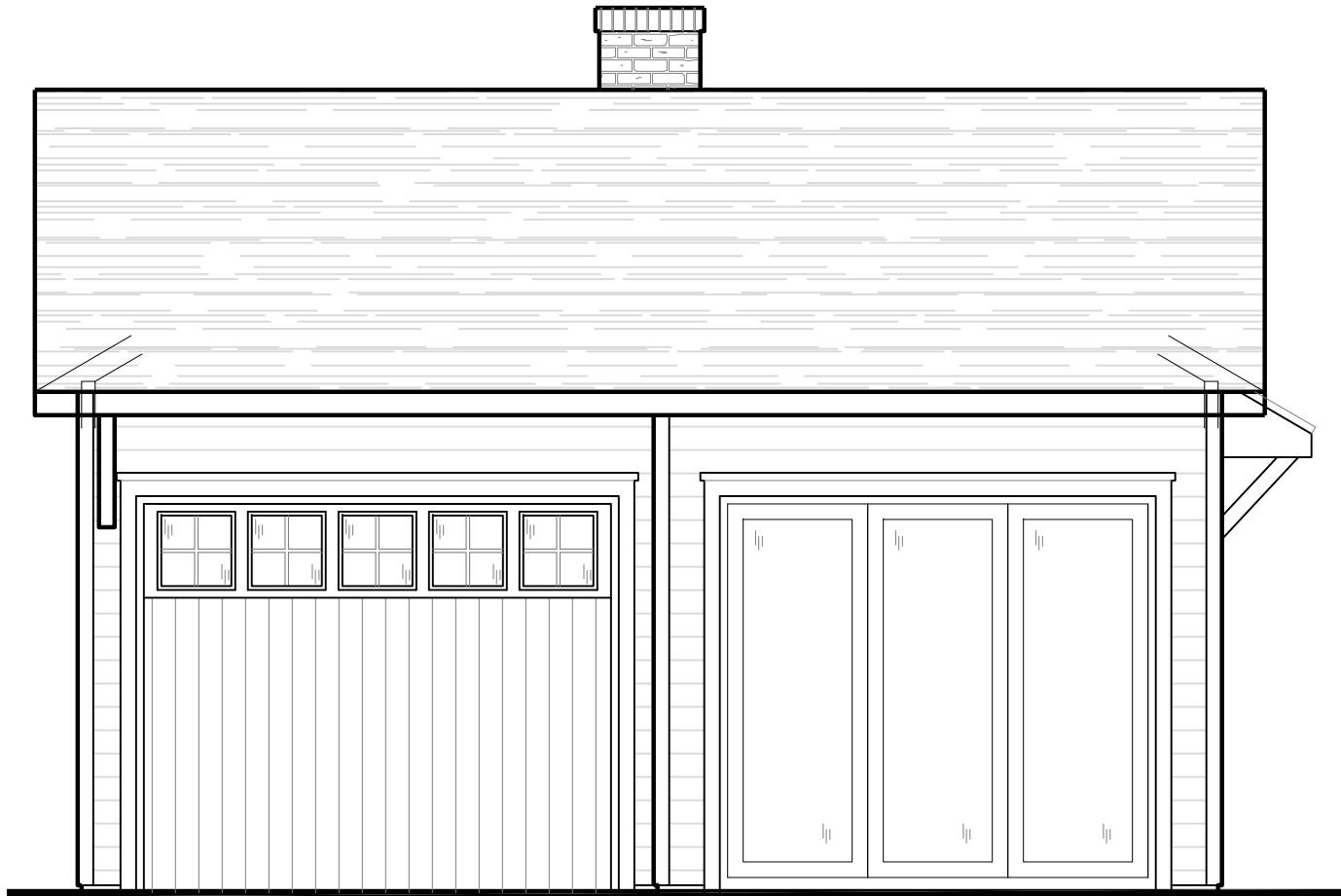
LEFT ELEVATION (WATSON STREET)