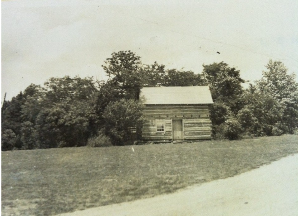
A 1949 photograph shows a restored log house, with exposed chinking, and repaired or replaced windows. The log house features a door centered in the façade. Originally additional fenestration on the façade was limited to a single window to the west of the door. The west elevation features a centered, shouldered, brick chimney.