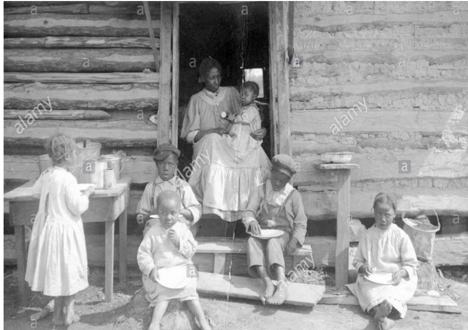
African American Sharecropper Mother With Her Children

old, a scrawny, infinitely tired, delicate animal.” 21 The women sharecroppers, they said, wore “dresses wet in front with the dishwashing” and “hands softened and seamed as if withered with water.” 22