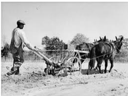
Mules And A Plow Break The Brittle Soil