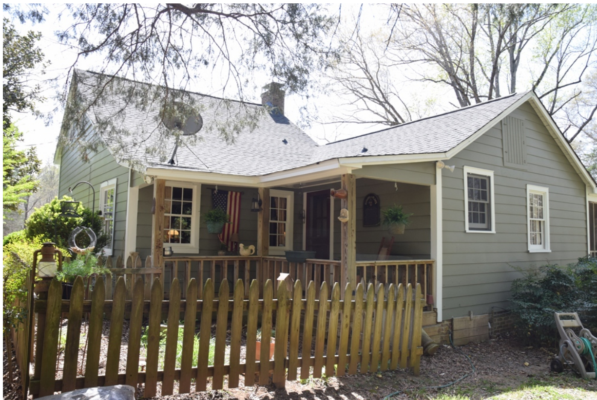
A shed-roofed porch and a ca. 1956 gabled wing extend from the rear of the house. The rear wing rests on a brick foundation.