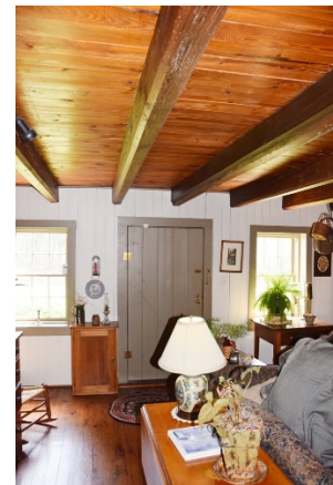
Albert Wallace Log House March 2018