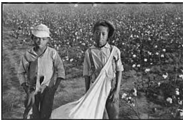
Pickers With A Tow Sack For Gathering Cotton