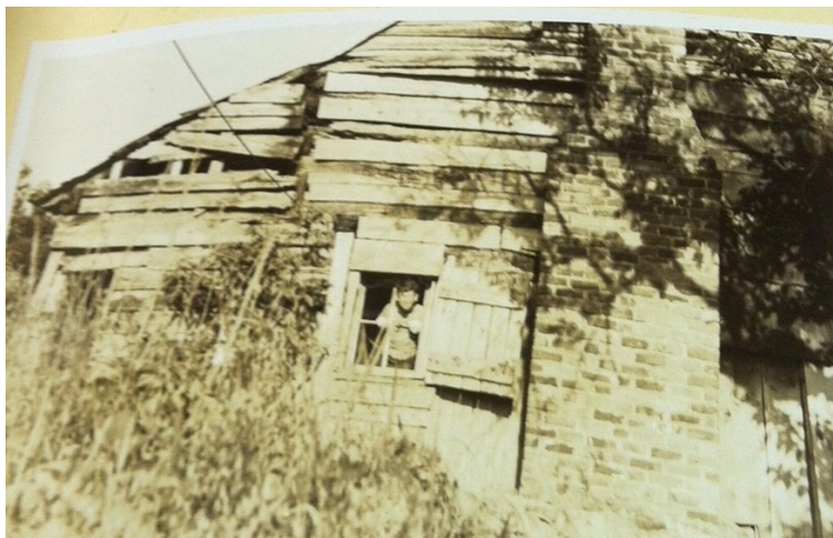
Western Façade Of The Albert Wallace Log House Before Restoration c. 1948