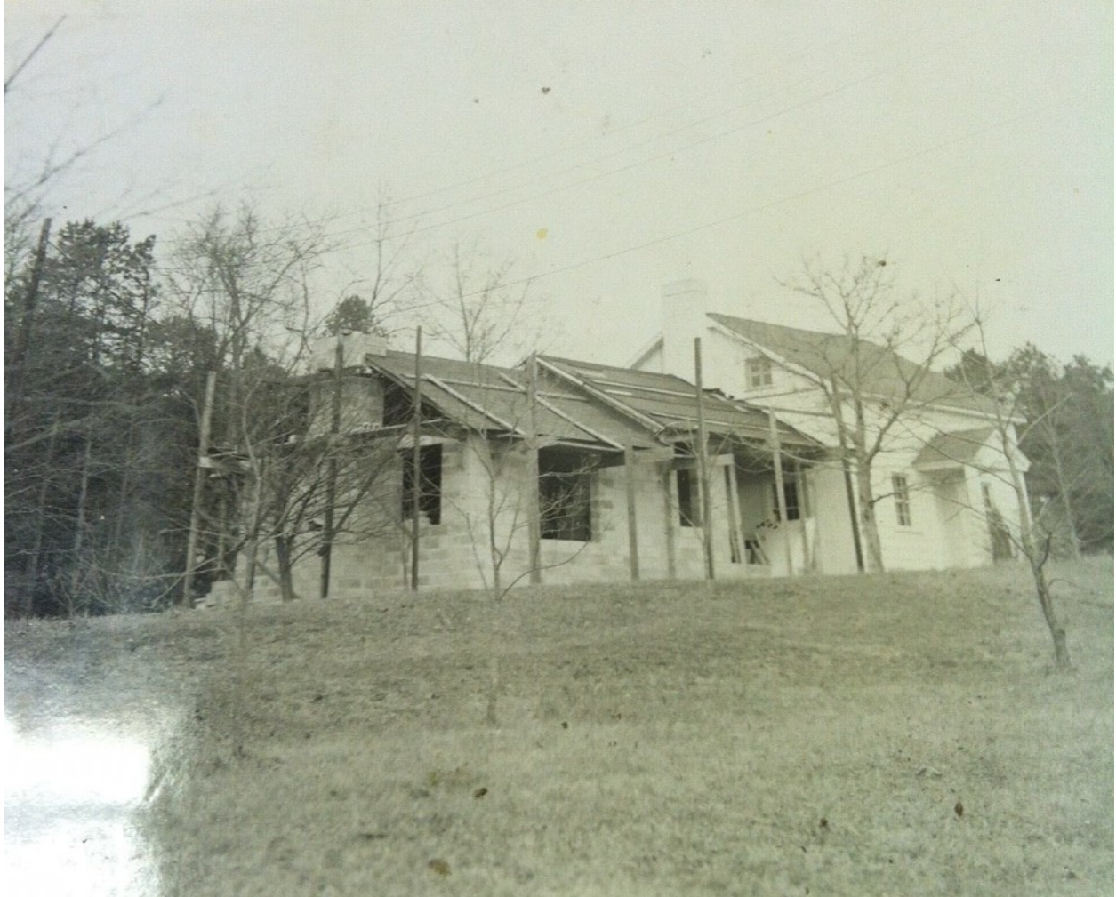
A ca. 1956 photograph shows a block (CMU) wing being constructed on the west elevation. The principal section of the house features a small gabled porch supported by boxed posts. The west elevation is covered with siding. The façade features a replacement vertical-board door. The windows on the facade are flanked by simple decorative shutters.