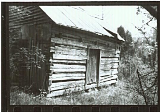
Stafford Slave Log House