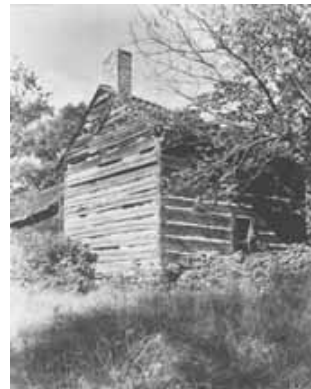
McIntyre Log House (Destroyed)

In keeping with their limited economic resources, many of the early white settlers in Mecklenburg County, like their counterparts throughout North Carolina, erected “unpretentious, practical, and conservative homes.” Log buildings were especially popular. At a time when labor was scarce and wood and clay were plentiful and when the “transportation of imported materials was difficult and expensive,” homeowners and artisans naturally turned to familiar forms and techniques of construction. Some early abodes were crude structures made of “unhewn logs and without windows.” Local examples of early log buildings in Mecklenburg County are the Stafford Slave Log House and the McIntyre Log House. Others, such as the one-story, gable-roofed Albert Wallace Log House, were “better-finished buildings.” 4 Log houses were widespread in the North Carolina Piedmont in the eighteenth and nineteenth centuries. Most are gone, especially in highly urbanized places like Mecklenburg County. The Albert Wallace Log House has special significance because it is one of the few