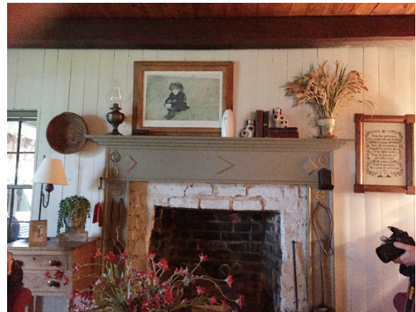
Albert Wallace Log House March 2018