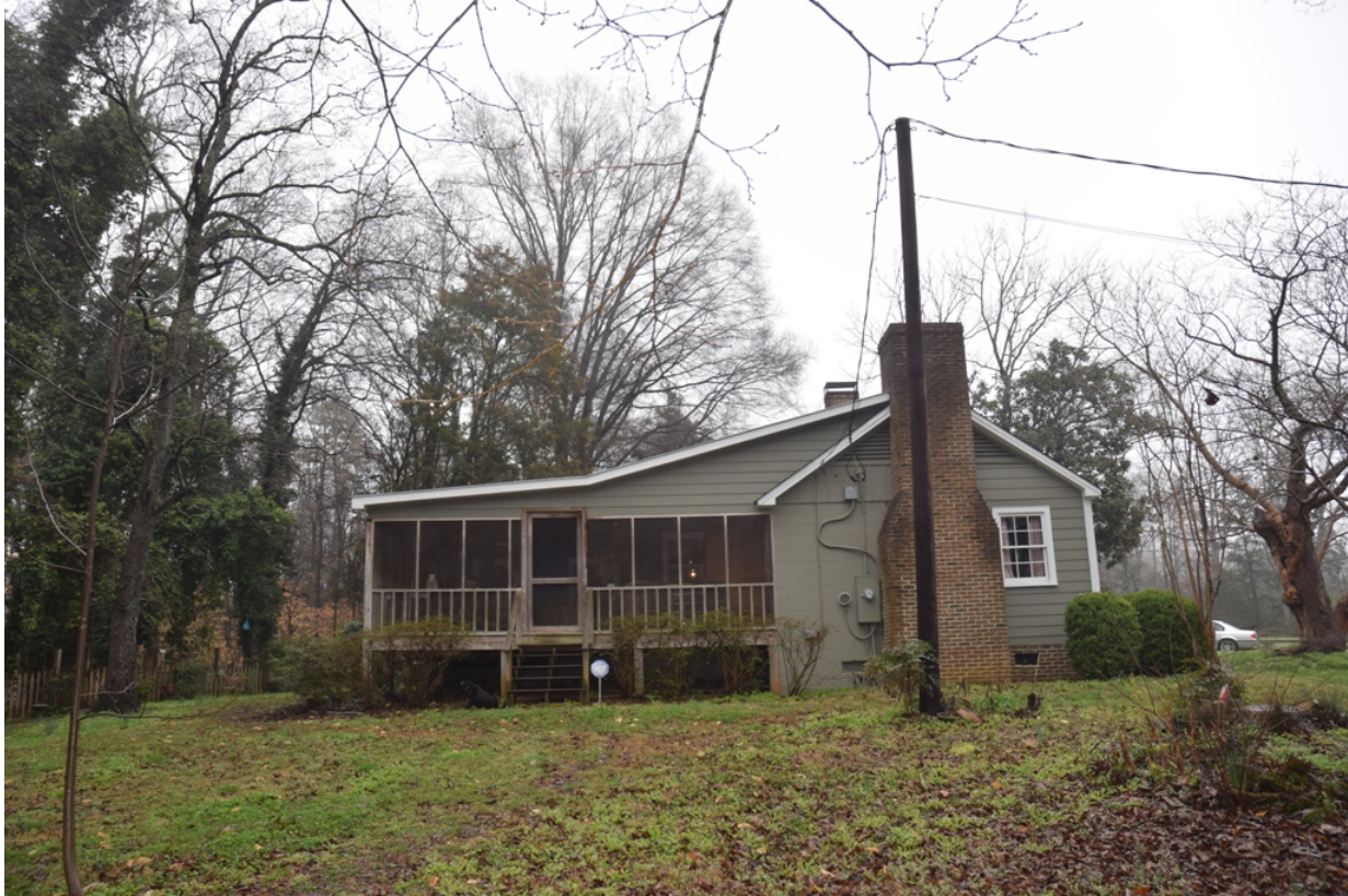
A two-part shed roof extends from the rear of the block wing, and covers a screened porch that is supported by wooden posts.