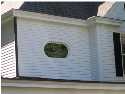
Elliptical window on front elevation

All of these characteristics combine to make the Martin-Worth-Henderson House a distinctive structure in the Town of Davidson.