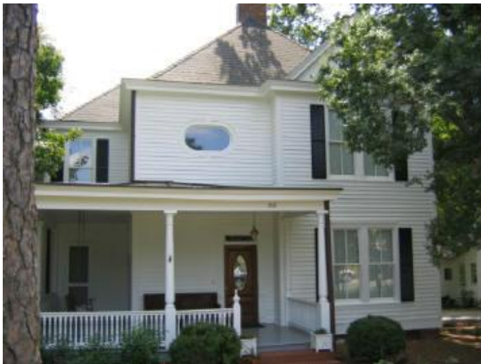
The Martin-Worth-Henderson House, 2005