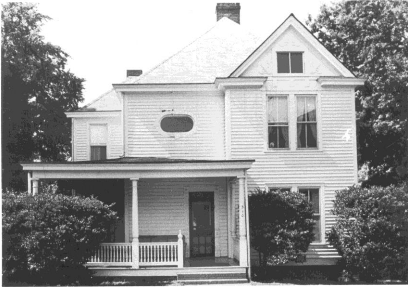
The Martin-Worth-Henderson House in the 1930's