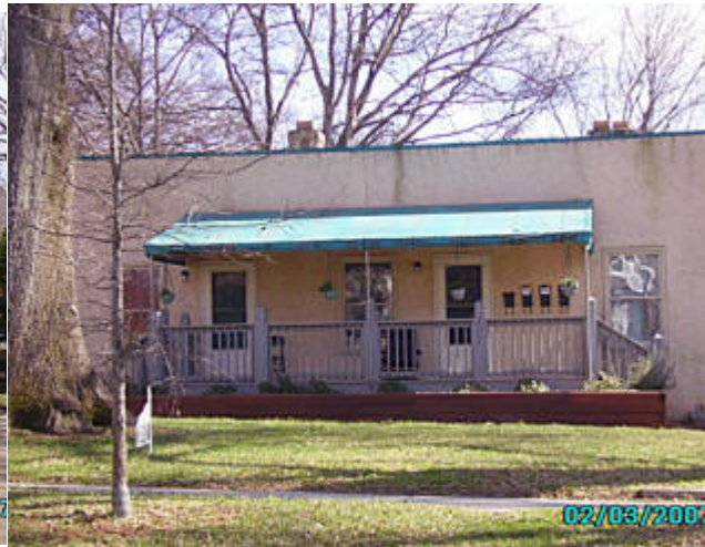
1408 Dilworth Road