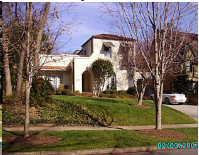
2019 Beverley Drive