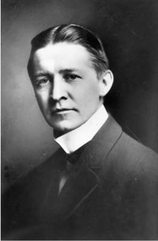
Bertram Goodhue had been best known for his devotion of Gothic Revivalism. Bertram Goodhue's Spanish Colonial Revival style creation in San Diego.

During the late 1910's and throughout the 1920s a wide range of buildings appeared in the Spanish Colonial Revival style, especially in California and the Southwest. These included retail stores, office buildings, gasoline stations, courthouses, and movie theaters. But residences constituted the most widespread use of the style, both in single family and in multi-family domiciles. Spanish Colonial Revivalism debut in Florida in 1919 with the completion of architect Addison Mizner's Everglades Club in Palm Beach. Mizner would go on to design palatial estates for East Coast millionaires who wintered in Florida. During the 1920s, Spanish Colonial Revivalism began to spread from Florida into other Southeastern states, including North Carolina. 13