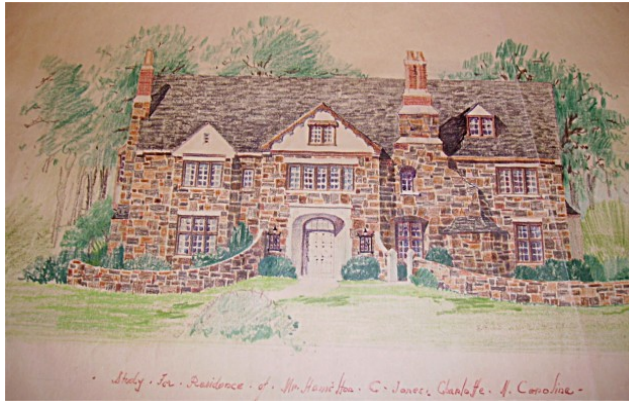
Boyer's drawing of the extant Tudor Revival Style Hamilton C. Jones House. Special Collections Department UNCC Atkins Library

mostly designed homes for wealthy patrons. 4 Illustrative of Boyer's commitment to traditional Revivalism are two imposing extant homes he designed in Charlotte's exclusive Eastover neighborhood.