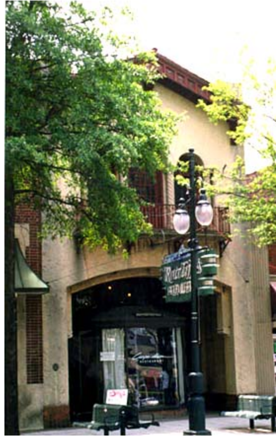
Ratcliffe Florist Shop (1929)