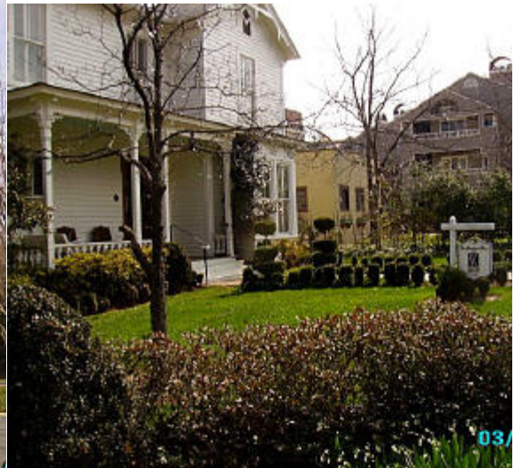
Smith House & Its Streetscape