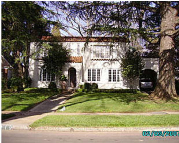
212 Ridgewood Avenue