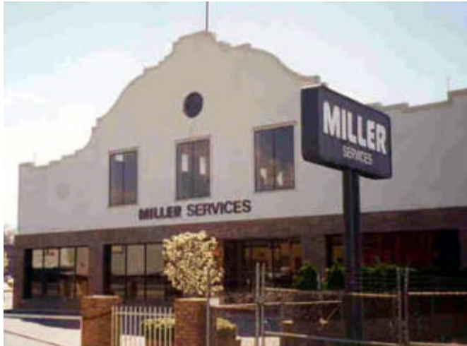
Made In The Carolinas Exhibition Building (1923)