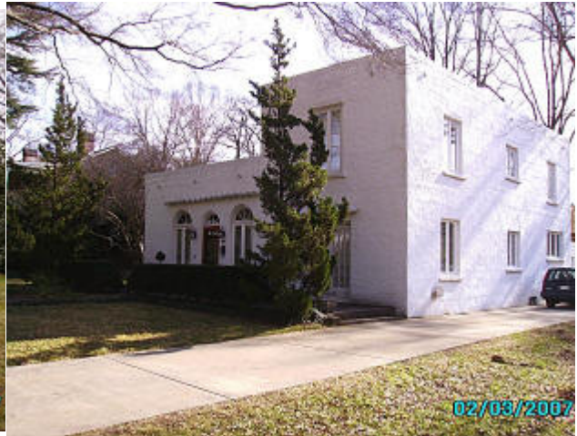
255 Ridgewood Avenue