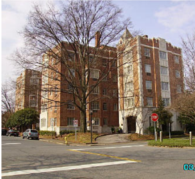
Poplar Apartments & The Tenth Street Median