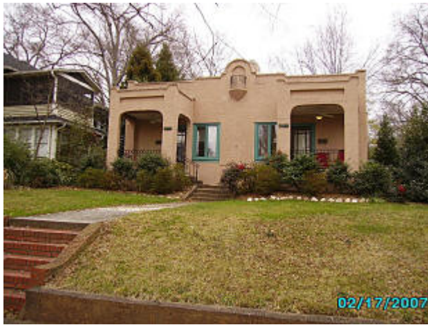
2215-17 E. 5th Street

in Wesley Heights; one is on Camp Greene Street in southwest Charlotte; three are in Elizabeth, and the C. H. Smith House stands in the Fourth Ward neighborhood. The construction of an essentially suburban house