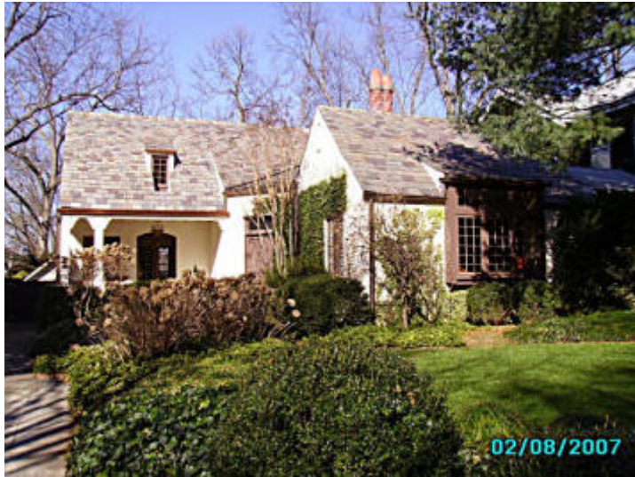
House at 522 Hermitage Court