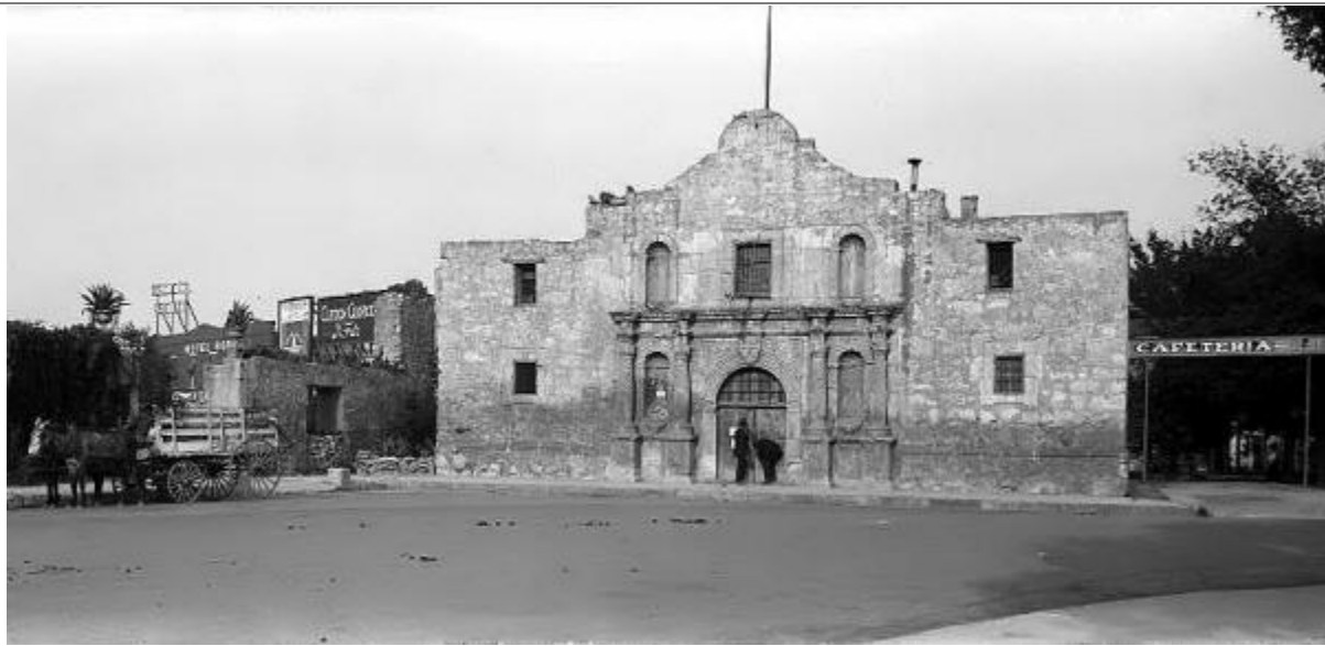
The Alamo ( the Spanish word for Cottonwood) was purchased by the State of Texas as a historic site in 1883.

Native American construction techniques, Franciscan priests used blocks of sun-dried earth or adobe for the walls of their missions. Most were surmounted by substantial red-tiled roofs to protect the earthen walls of the buildings from the devastating impact of water, which did fall during infrequent rainstorms. By the 1780s a series of Franciscan missions of this type had been built in California and the American Southwest. Perhaps the best known of these Spanish colonial churches is the mission of San Antonio de Valero (c.1755), better known as the Alamo, in San Antonio, Texas. 9