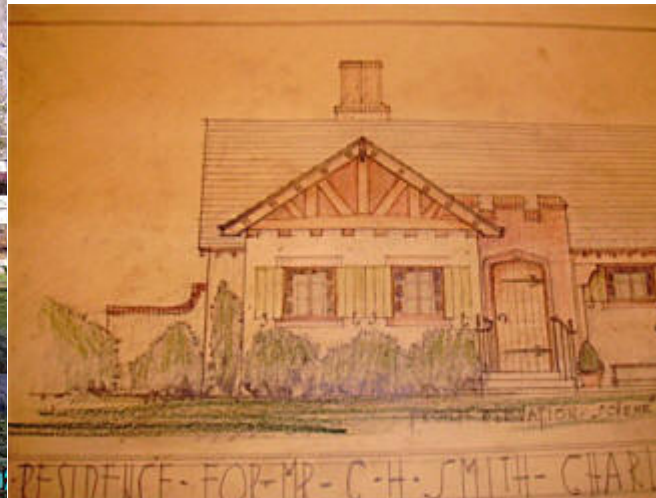
Initial Proposal For The House At 220 West 10th St. Special Collections Department UNCC Atkins Library

There are other Spanish Colonial Revival style houses in Charlotte but only a handful. All but the Smith House are located in what would have been Charlotte's outlying neighborhoods in the 1920s. Four are in Myers Park; two are in Dilworth; one is