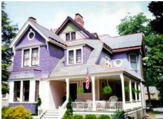
Liddell McNinch House

and garage design into the built environment of Center City Charlotte in 1923 bears testimony to the fact that middle class white residents of Charlotte in the 1920s were still selecting parts of uptown, especially the fringes of Fourth Ward, as a place they where wanted to live. This circumstance would end as the twentieth century progressed. 16