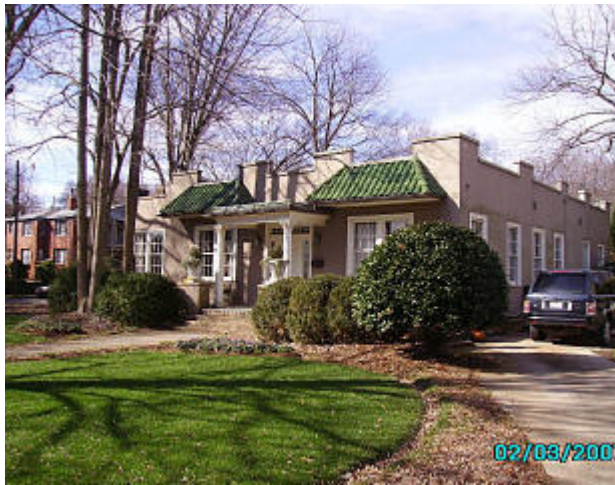
2100 Camp Greene St.