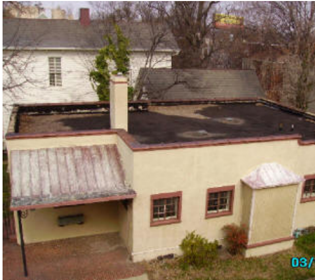
Smith House looking toward northwest.