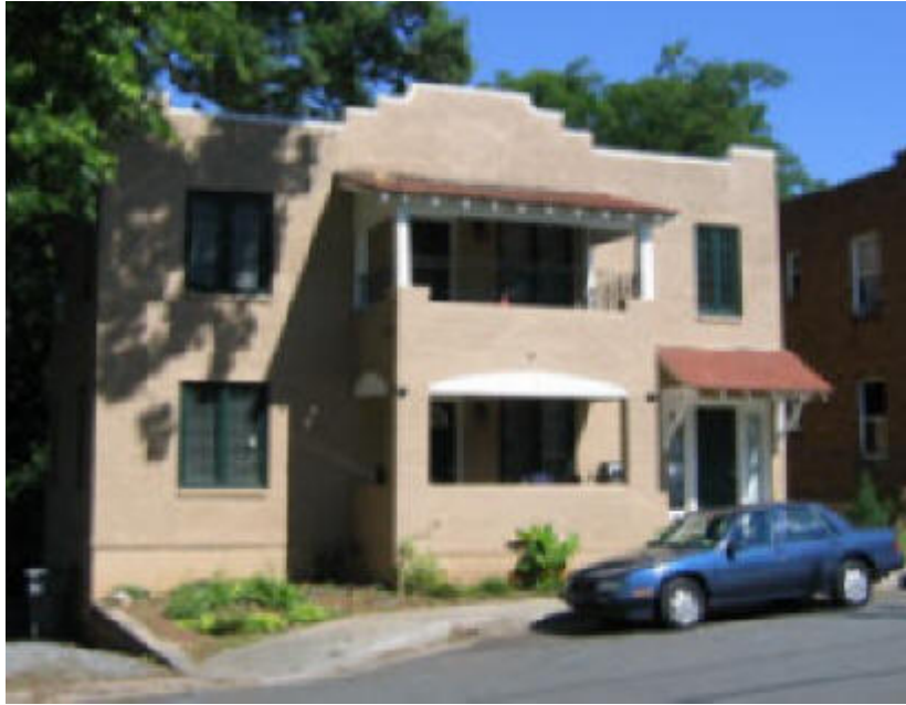
Woodlawn Ave. Duplex