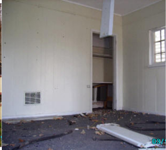
Typical interior room treatment.