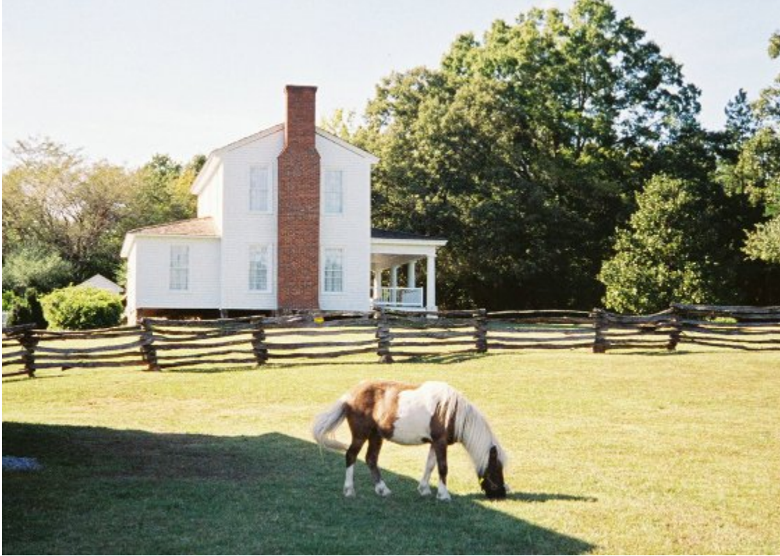
This photograph is circa November 2006.