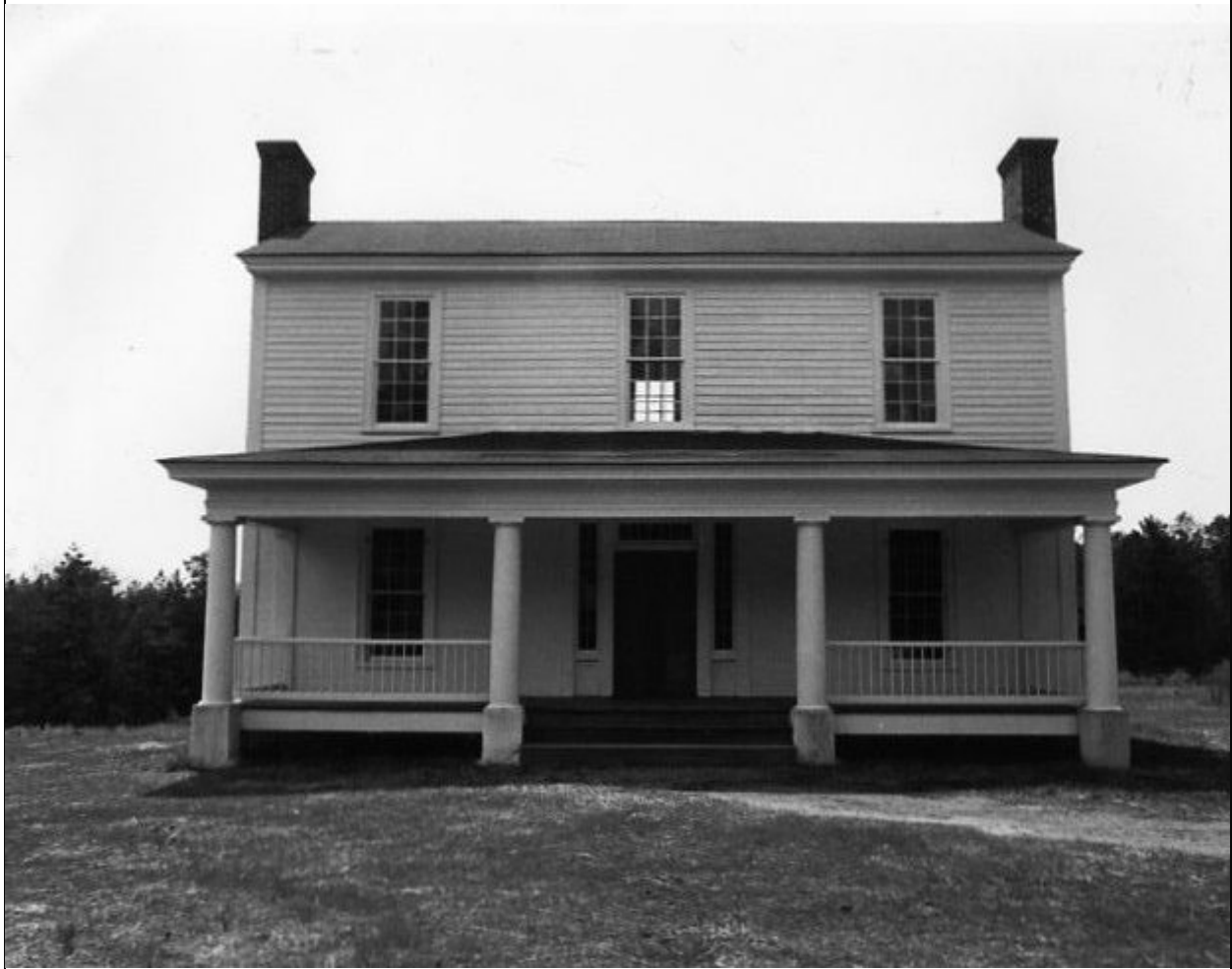
This photograph is circa 1980.

The colors used for the trim throughout the house, as described herein, constitute one of the more unusual features of the house. Their use in the restoration is based on physical evidence of the original paint colors. The only outbuilding at the present site is a small weatherboarded well house to the right of the main house. It is of totally new construction, but is compatible with the house and setting.