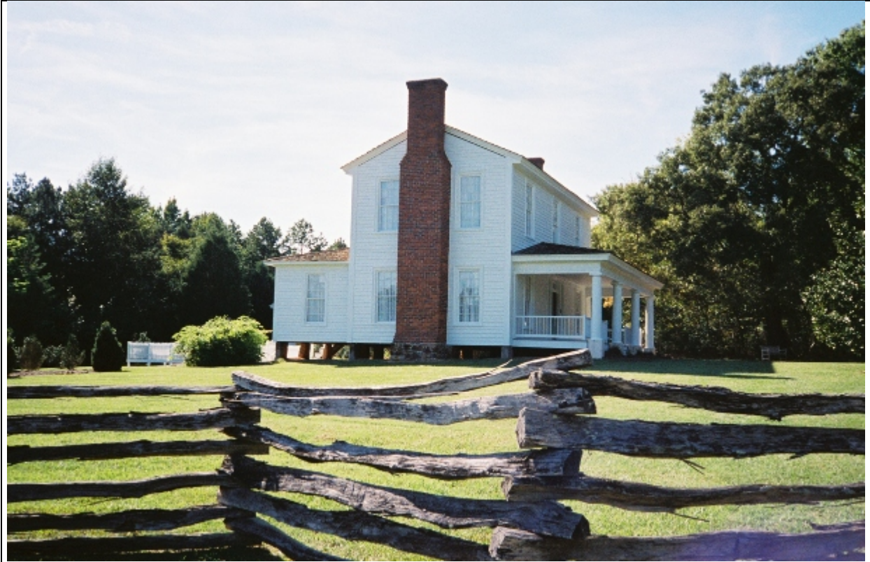
This photograph is circa November 2006.