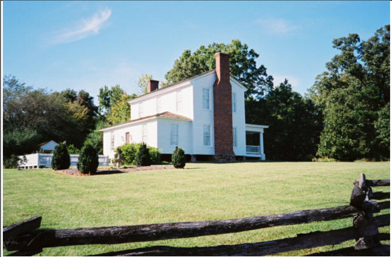
This photograph is circa November 2006.